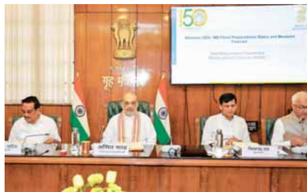
Union Home Minister Amit Shah chairs a high-level meeting to review preparedness to deal with floods that affect various parts of the country during the monsoon, in New Delhi, on Sunday. Union Minister of Jal Shakti C R Paatil and Union MoS for Home Affairs Nityanand Rai are also seen

This would aid in effective flood and water management by providing accurate and