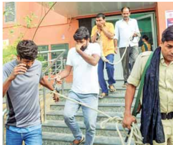
Economic Offences Unit (EOU) personnel leave with the accused arrested in connection with the alleged irregularities in NEET-UG exams 2024 case, after the latter's medical examination at LNJP hospital, in Patna, on Sunday