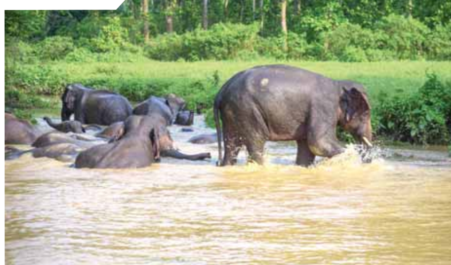
A herd of wild elephants bathes in water to get respite from the heat, in Kamrup