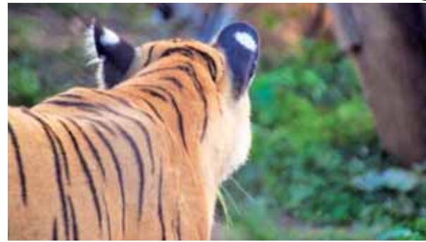
A representational image

owners of the cows which were killed by the big tiger. Wayanad, a high range district situated on the periphery of the Western Ghats forests, is no stranger to wild animals. Elephants, tigers, cheetahs, leopards and deers make frequent visits to the human settlements in search of food and water as the reserve forests are short of drinking water and food. The big cats target domestic animals like cows, sheep and bulls while the elephants prefer to have banana plants, jackfruits and mangoes in addition to their favourite