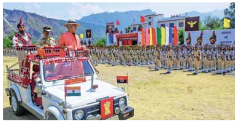
Jammu and Kashmir Lieutenant Governor Manoj Sinha reviews the Passing out Parade of Jammu and Kashmir Police's 16th BRTC Batch at the Subsidiary Police Training Centre in Reasi district on Sunday