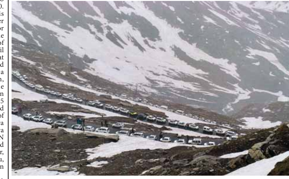
Traffic congestion on a road owing to tourists' rush near Rohtang Pass, in Manali, on Thursday

After registering the case, the police have launched a probe to find out from where the ice cream was brought, and where and when it was manufactured, he said.