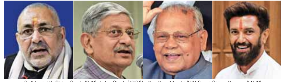
(Left to right): Giriraj Singh (BJP), Lalan Singh (JD(U)), Jitan Ram Manjhi (HAM) and Chirag Paswan (LNPJ)

Bihar got a better pie in the Modi.3 Council of Ministers when compared to Uttar Pradesh given the coalition dharma since the Nitish Kumar-led Janata Dal (U) and Chirag Paswan-led LJP have extended support to Narendra Modi with 12 and five Lok Sabha seats, respectively. Among the new faces included is Ram Nath Thakur. JD(U) leader and son of Bharat Ratna Karpoori Thakur. The moves sent a strong message to the EBCs in Bihar. For the States — Bihar and UP — caste