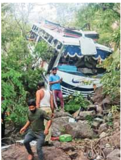
The damaged bus after it plunged into a gorge following an alleged attack by suspected terrorists, in Reasi district of Jammu and Kashmir