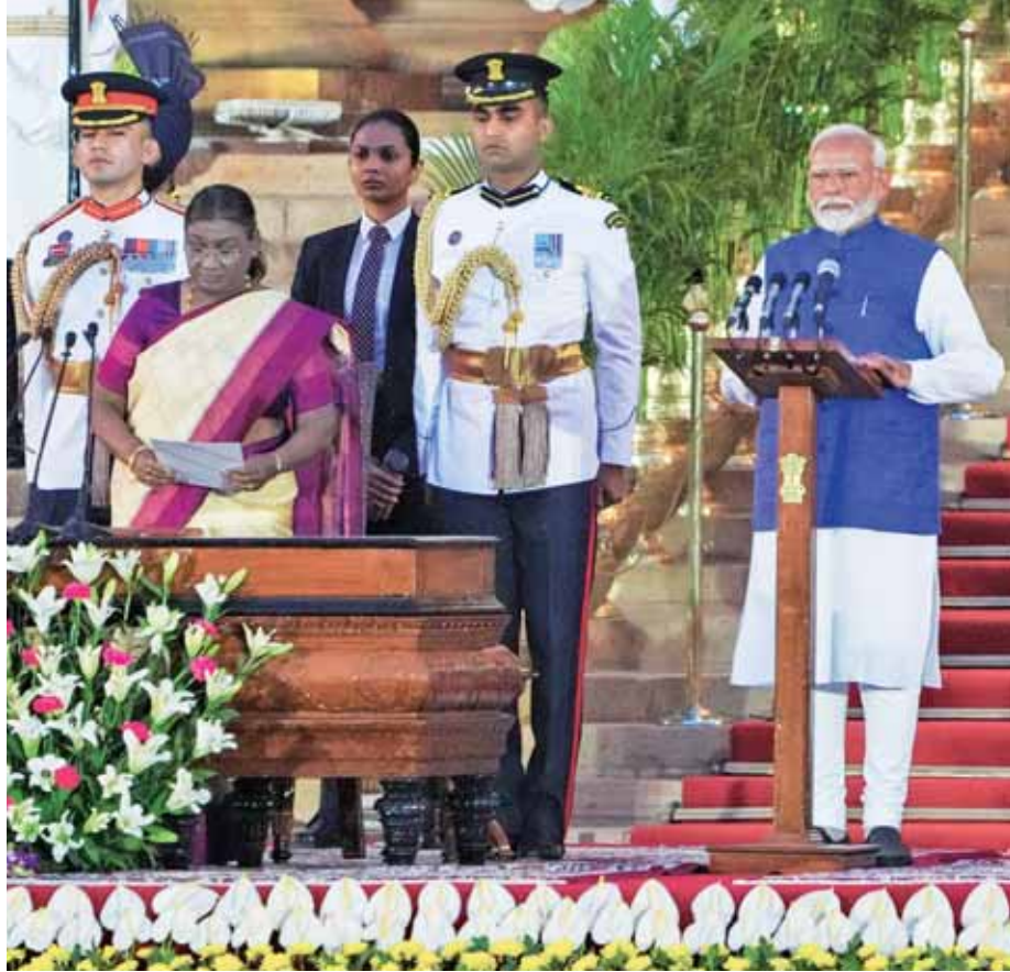
President Droupadi Murmu administers the oath of office to Narendra Modi as Prime Minister at Rashtrapati Bhavan in New Delhi on Sunday

Scripting a history, Prime Minister Narendra Modi on Sunday took over as Prime Minister for a third consecutive term becoming the first non-Congress leader and second after first Prime Minister Jawaharlal Nehru to don the mantle. With this Modi also becomes the only leader in the country to hold a constitutional post back to back for more than two decades which includes — three term as PM and prior serving 12 years as Chief Minister of Gujarat. President Draupadi Murmu administered Modi the oath of office and with this he also become the only PM to have been administered the oath by three presidents, including Pranab Mukherjee and Ramnath Kovind. Modi also under his regime was part of the consecration of Ram Temple in Ayodhya early this year and dedicated to the nation a new Parliament last year in September. If Modi completes his current five year term as PM leading the NDA regime he will have served a total of 27 years in office. He has been since leading his party to victory and power in 2002, 2007 and 2012 in Gujarat as CM and then in 2014 and 2019 at the Centre and again in 2024. It is though different this time as the BJP has lost majority on its own. Modi's third term which has