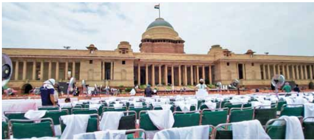
Preparations underway for the swearing-in-ceremony of the new Government, at the Rashtrapati Bhavan in New Delhi