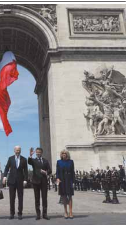
French President Emmanuel Macron, center right, stands with US President Joe Biden, First Lady Jill Biden and Brigitte Macron, right, during a ceremony at the Arc de Triomphe on Saturday in Paris. President Joe Biden is being feted by French President Emmanuel Macron with a state visit Saturday, as the two allies aim to show off their partnership on global security issues and move past trade tensions.