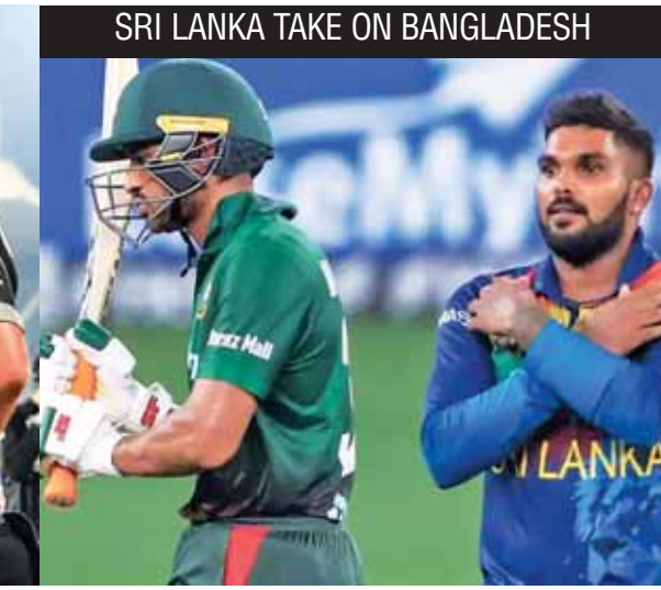
SRI LANKA TAKE ON BANGLADESH

On paper, New Zealand have all bases covered, they have depth in batting and variety in bowling. Trent Boult will look to dominate with the new ball, with Lockie Ferguson and Tim Southee complementing him.