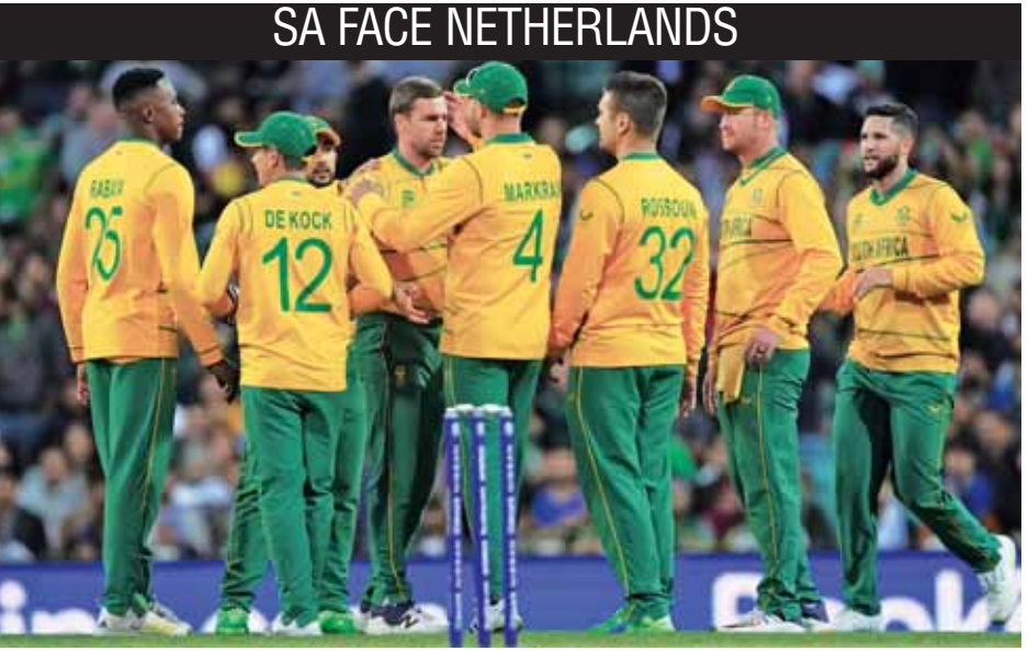
SA FACE NETHERLANDS

would certainly want a reversal this time around. The most encouraging signal from their win over Sri Lanka was the form of Anrich Nortje.