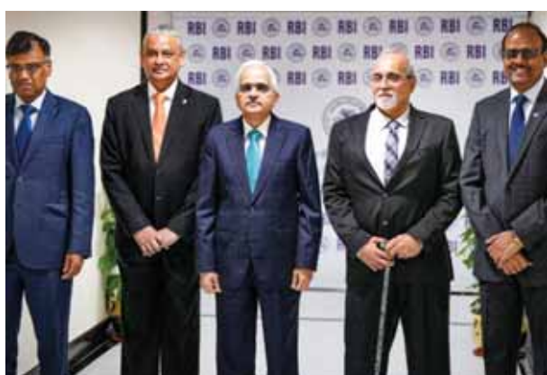
2023 to March 2024) fiscal year, while inflation was 4.83 per cent in April, above the RBI's target. The FY24 growth was helped by a faster-than-expected pace of 7.8 per cent in the March quarter. Das said while the MPC took note of the disinflation achieved so far without hurting growth, it remains vigilant to any upside risks to

cut, compared to one in the previous meeting. The decision comes just days ahead of Narendra Modi assuming the office of the Prime Minister of India for the third straight time but with a smaller-than-expected election victory that forced his party BJP to share power in a coalition government. The slim majority, according to global rating agencies, may delay more far-reaching elements of economic and fiscal reforms like land and labour, and impede progress on fiscal consolidation. With the Indian economy, Asia's third-largest, growing faster than expected in the previous year, the RBI raised its GDP growth projection for the current fiscal through March 2025 to 7.2 per cent from 7 per cent while maintaining its inflation forecast at 4.5 per cent. India's real GDP grew by 8.2 per cent in the 2023-24 (April