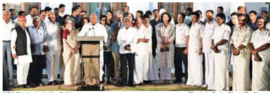
INDIA bloc leaders in New Delhi

sessions, leading to blockades within the complex. The Parliament Library building and the Annex are separated by a road that has a reception office and a row of barracks, housing security offices along a compound wall. The statue of Babasaheb Ambedkar is located inside the Parliament complex and thousands of visitors through the premises to pay tributes to him on his birth and death anniversaries. The Red Cross Road outside the Parliament premises will also become a part of the complex as there are plans to develop offices for Lok Sabha and Rajya Sabha members on the land which currently houses the International Red Cross Society. The row of barracks has been vacated and plans are also being made to demolish the compound wall separating the Parliament buildings from the Annex. These offices have been shifted to the North Utility Block of the new Parliament building.