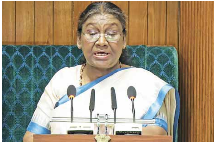
President Droupadi Murmu addresses the joint sitting of the Lok Sabha and Rajya Sabha, in New Delhi, on Thursday. The first session of the 18th Lok Sabha began on Monday and the 264th session of the Rajya Sabha will begin on June 27

Sabha Speaker Om Birla condemned the imposition of Emergency, Murmu too described in her speech the imposition of Emergency in 1975 as the "biggest and darkest chapter" of a direct attack on the Constitution and said the country triumphed over unconstitutional forces.