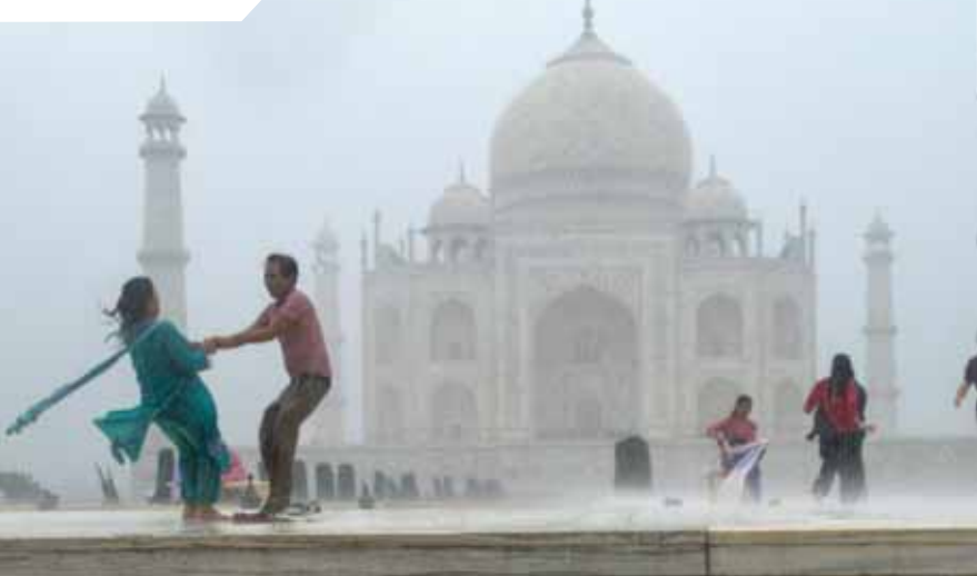
Tourists enjoy during rains, at the Taj Mahal, in Agra