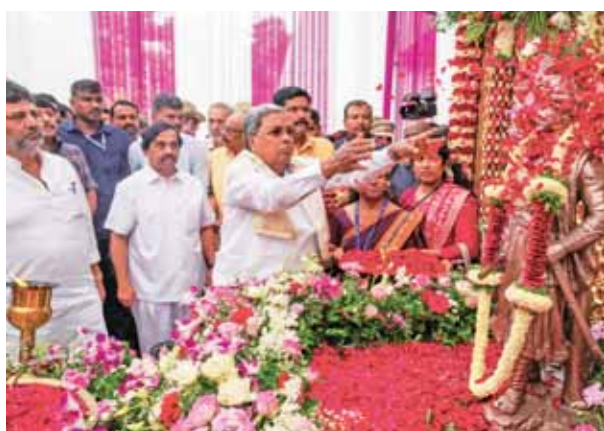
Karnataka Chief Minister Siddaramaiah pays floral tribute during the 51st birth anniversary celebration of Bengaluru's founder Nadaprabhu Kempegowda, at Kanteerava Stadium, in Bengaluru

In his address, Chandrashekhara Swami stated, "It is possible only if Siddaramaiah makes up his mind," requesting the present Chief Minister to consider the transition. "I urge Siddaramaiah to appoint DK Shivakumar as Chief Minister of the state. Despite others having held this position, DK Shivakumar has not yet served as Chief Minister. I believe it is within Siddaramaiah's power to make this decision, and I request him to fulfill this request," he said. Echoing similar remarks, Channagiri Congress MLA Basavaraju V Shivaganga urged the party to make Shivakumar the chief minister "and then they can make a dozen people deputy CMs; there won't be any objections".