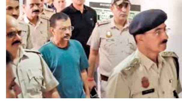
Delhi Chief Minister and AAP leader Arvind Kejriwal being produced before the Rouse Avenue Court in connection with a money laundering case related to the Delhi liquor policy, in New Delhi, on Wednesday