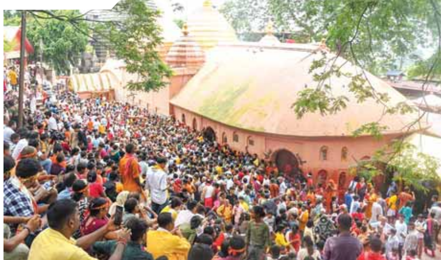
Devotees visit the Kamakhya temple that opened for prayers after the four days of Ambubachi Mela, in Guwahati