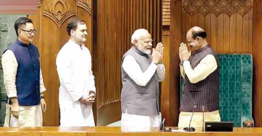
Prime Minister Narendra Modi greets Om Birla after the latter was elected as the Speaker of the House during the first Session of the 18th Lok Sabha, in New Delhi, on Wednesday. Leader of the Opposition Rahul Gandhi and Union Minister for Parliamentary Affairs Kiren Rijiju are also seen