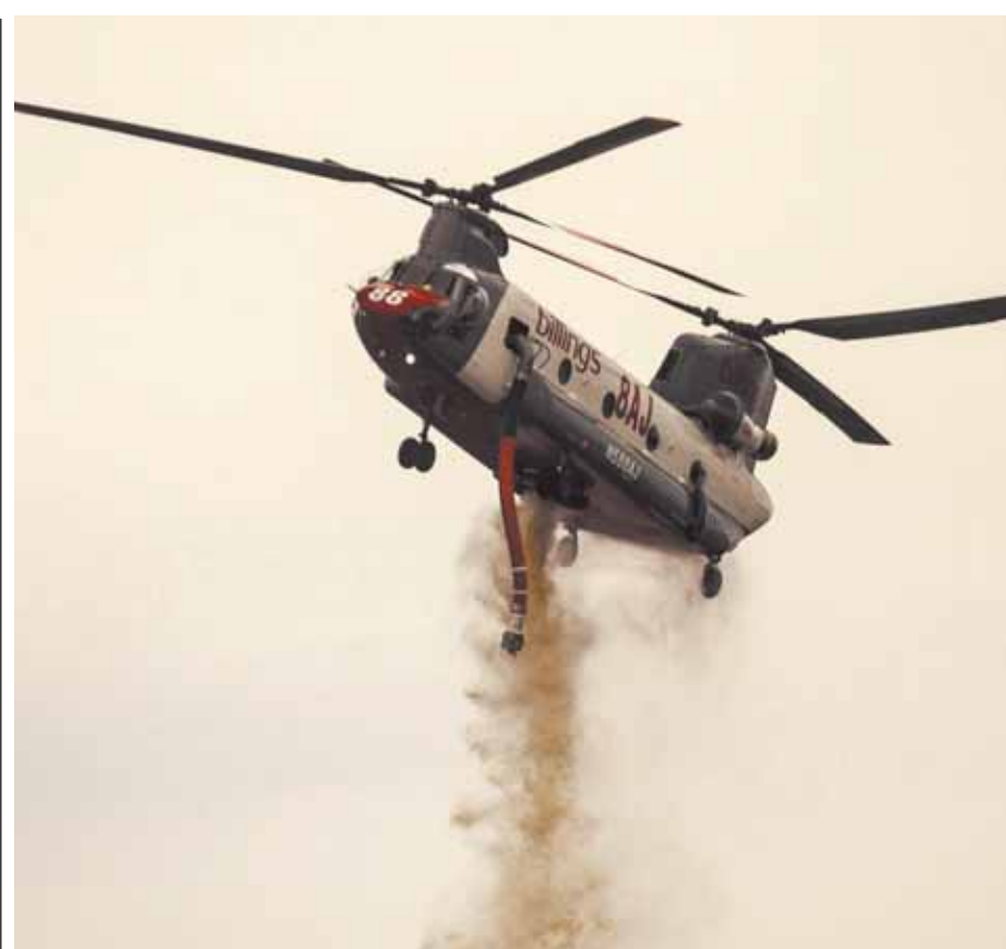
A helicopter drops water on the Apache Fire as it burns in Palermo, Calif., on Tuesday, Jun. 25, 2024. According to Cal Fire, more than a dozen new fires sparked by lightning

Brussels (AP): NATO appointed Mark Rutte as its next secretary-general on Wednesday, putting the outgoing Dutch prime minister in charge of the world's biggest security organisation at a critical time for European security as war rages in Ukraine. Rutte's appointment was sealed by NATO ambassadors during a meeting at the 32-nation alliance's headquarters in Brussels. US President Joe Biden and his counterparts will formally welcome him to their table at a summit in Washington on July 9-11. The outgoing Dutch premier will take over from the current secretary general, Norway's Jens Stoltenberg, on October 1. Stoltenberg spent more than a decade at the helm. His mandate was repeatedly extended, in part to provide continuity after Russia invaded Ukraine in 2022.