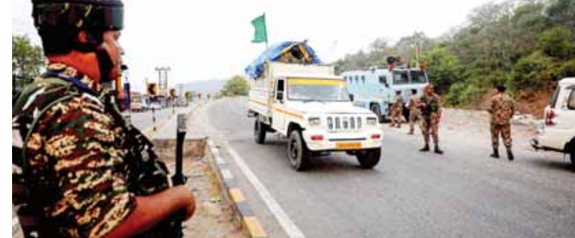
Security personnel guard as vehicles leave the Amarnath yatra base camp Bhagwati Nagar during a 'dry run' conducted by the authorities ahead of annual Amarnath Yatra, in Jammu, on Wednesday