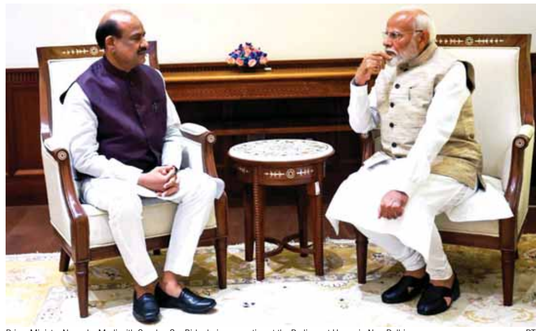
Prime Minister Narendra Modi with Speaker Om Birla during a meeting at the Parliament House in New Delhi

resolution condemning the imposition of Emergency and termed the decision by then prime minister Indira Gandhi an attack on the Constitution, triggering a wave of protests by the opposition in the House. Birla's reference to the Emergency, shortly after his election as Lok Sabha speaker, also saw a face-off between the government and the opposition in the first session of the lower house. "This House strongly condemns the decision to impose Emergency in 1975. We appreciate the determination of all those people who opposed the Emergency, fought and fulfilled the responsibility of protecting India's democracy," Birla said amid vociferous protests by opposition parties. Opposition MPs, including from the Congress, were on their feet, raising slogans against the reference to the Emergency. "June 25, 1975 will always be known as a black chapter in the history of India. On this day, then prime minister Indira Gandhi imposed Emergency in the country and attacked the Constitution made by Babasaheb Ambedkar," the speaker said. Birla said India was known all over the world as the mother of democracy. "Democratic values and debate have always been supported in India. Democratic values have always been protected, they have always been encouraged.