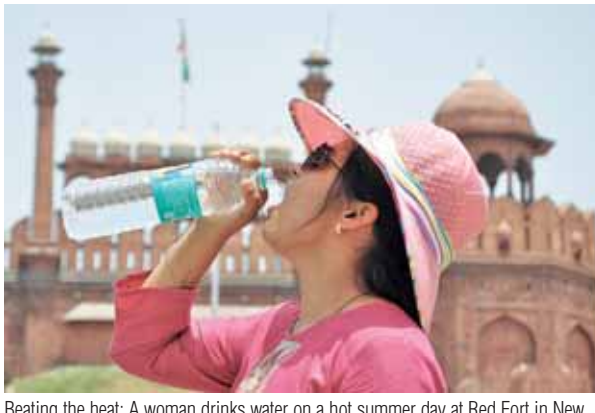
Beating the heat: A woman drinks water on a hot summer day at Red Fort in New

The heatwave currently affecting Northern India is quite intense, with extreme temperatures and severe conditions impacting a broad