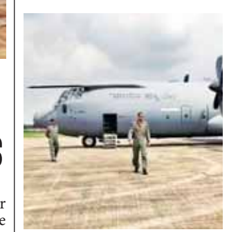
IAF aircarft brings back mortal remains of Indian fire victims from Kuwait on