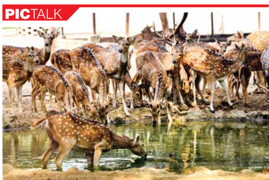
Spotted deer drink water inside their zoo enclosure on a hot summer day, in Patna

country's engagement with the G7 is driven by several strategic national interests. India aims to bolster its economic growth through increased trade and investment. The G7 economies are significant trading partners and sources of foreign direct investment. Engaging with the G7 helps India to advocate for fairer trade practices, access to advanced technologies and support for its economic initiatives. Besides, India is deeply invested in the global climate agenda. As a developing nation facing the dual challenges of economic growth and environmental sustainability, India's participation in G7 discussions on climate change is crucial. The G7's commitments to carbon neutrality, renewable energy and financial support for developing nations align with India's goals of transitioning to a green economy. India's participation in these dialogues is vital for addressing security concerns, particularly in the Indo-Pacific region where China's assertive actions have raised alarms. Moreover, as a country aspiring to become a global technology hub, India seeks collaboration with G7 countries on innovation and technological development. Participation in G7 initiatives can help India gain access to cutting-edge technologies, foster research and development partnerships, and support its digital economy.