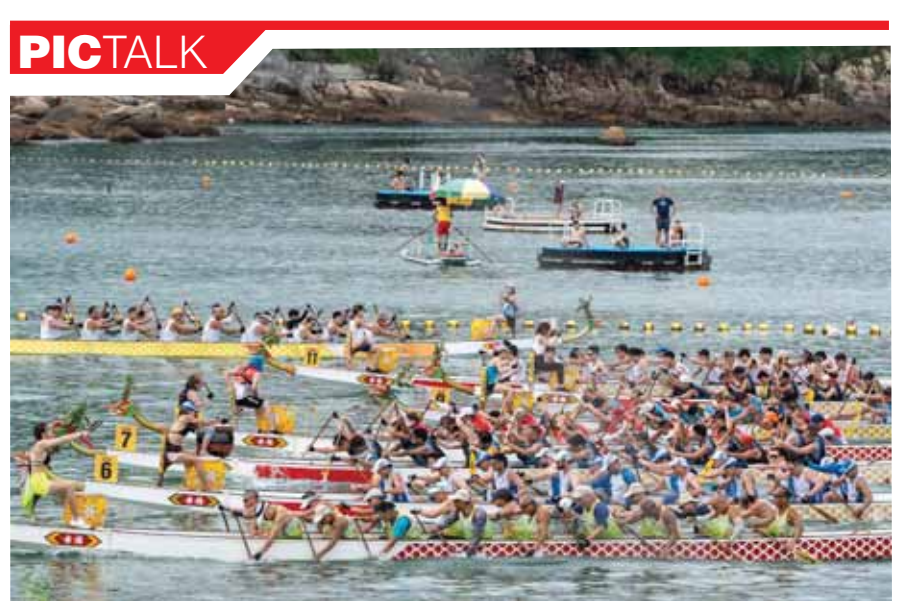
Competitors at the annual dragon boat race in Hong Kong

a more balanced Government and serve as a check on decisions made by one person. In the long run, political instability could result from coalition partners feeling consistently ignored. In maintaining control, the BJP must make sure that its coalition partners are respected and feel included. However, the BJP's chances in States where these allies have sizeable support bases may suffer if coalition members leave over discontent. This might be harmful in elections that are hotly contested. Even if they do not hold important Ministries, the BJP is still able to include coalition partners in significant decision-making processes. This may lessen feelings of isolation. Keeping a stable alliance and addressing coalition partners' concerns can be achieved by regular consultations and talks. Providing them with strategic ministries or other types of political recompense might assist maintain coalition members' commitment and satisfaction. Maintaining important Ministries, therefore, is a two-edged sword for the BJP. It can guarantee policy continuity and improve governance efficiency, but it also runs the danger of upsetting coalition partners, which could result in political instability. The outcome will mostly depend on how the BJP humours its alliances and strikes a balance between inclusiveness and shared authority and centralised control.