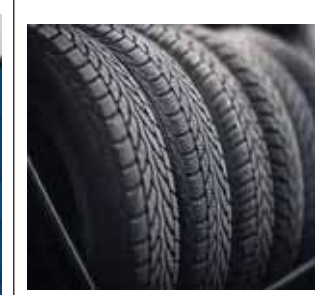
PTI ■ NEW DELHI

The total tyre exports from India during 2023-24 stood at Rs 23,073 crore, matching previous year's figure on the back of a sharp recovery in the second half of the fiscal, the Automotive Manufacturers' Association (ATMA) said on