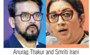
Anurag Thakur and Smriti Irani

Husbandry and Dairying in the Cabinet reshuffling of 2021, is likely to be dropped this time. During the election campaign, Rupala courted controversy by calling erstwhile 'maharajas' being subjects of the British and foreign rulers, angering the Kshatriya community. The omission of Union and Information Minister Anurag Thakur has surprised many as he was not among the leaders invited to meet Modi. The PM customarily