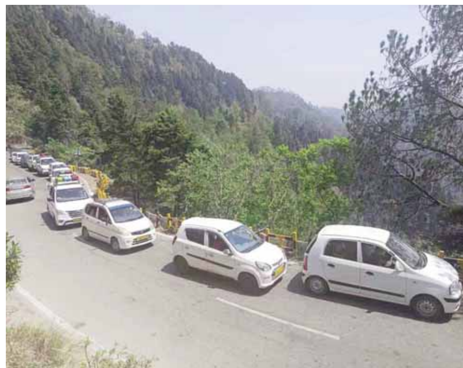
Tourist vehicles queue on the way to Nainital on Sunday with the police allowing entry only for vehicles of those tourists who had booked rooms in hotels with parking