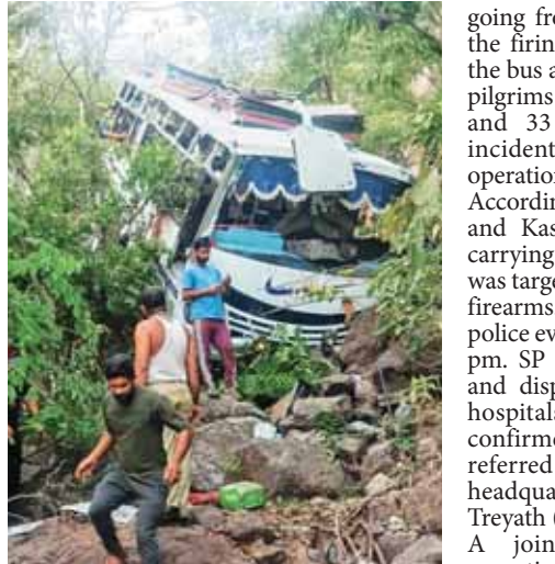
The damaged bus after it plunged into a gorge following an alleged attack by suspected terrorists, in Reasi district of Jammu and Kashmir