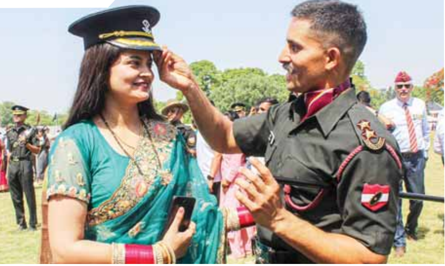
A newly inducted officer with his wife after the Passing Out Parade at the IMA, in Dehradun