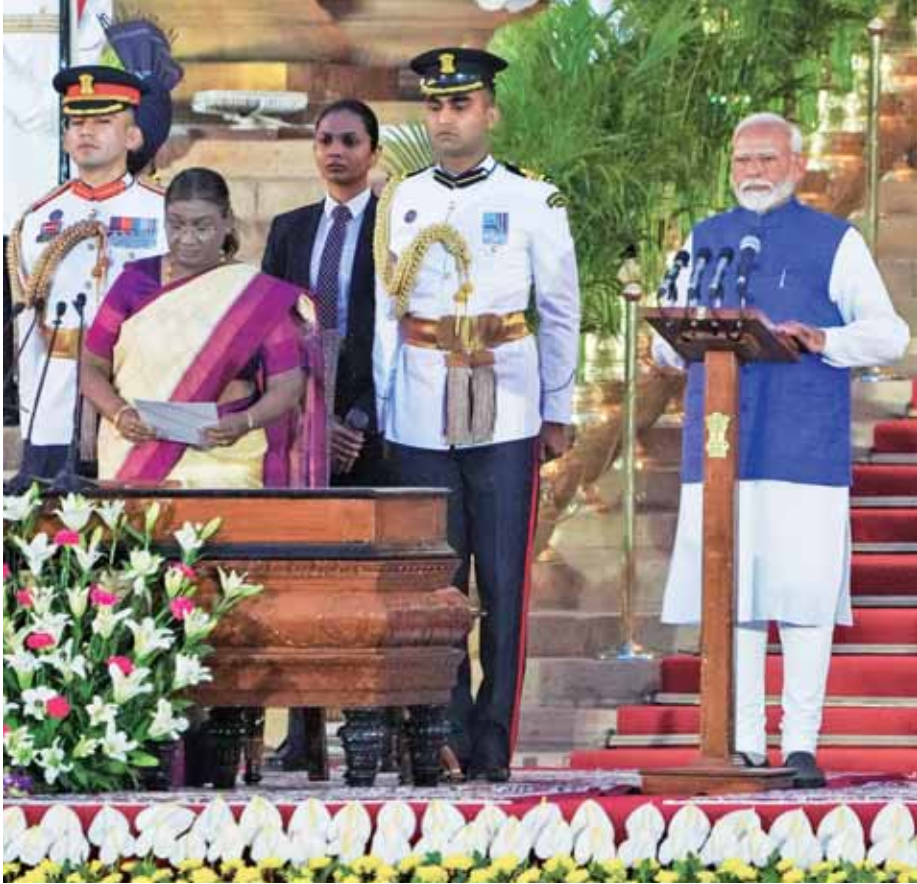
President Droupadi Murmu administers the oath of office to Narendra Modi as Prime Minister at Rashtrapati Bhavan in New Delhi on Sunday

Scripting a history, Prime Minister Narendra Modi on Sunday took over as Prime Minister for a third consecutive term becoming the first non-Congress leader and second after first Prime Minister Jawaharlal Nehru to don the mantle. With this Modi also becomes the only leader in the country to hold a constitutional post back to back for more than two decades which includes — three term as PM and prior serving 12 years as Chief Minister of Gujarat. President Draupadi Murmu administered Modi the oath of office and with this he also become the only PM to have been administered the oath by three presidents, including Pranab Mukherjee and Ramnath Kovind. Modi also under his regime was part of the consecration of Ram Temple in Ayodhya early this year and dedicated to the nation a new Parliament last year in September. If Modi completes his current five year term as PM leading the NDA regime he will have served a total of 27 years in office. He has been since leading his party to victory and power in 2002, 2007 and 2012 in Gujarat as CM and then in 2014 and 2019 at the Centre and again in 2024. It is though different this time as the BJP has lost majority on its own. Modi's third term which has