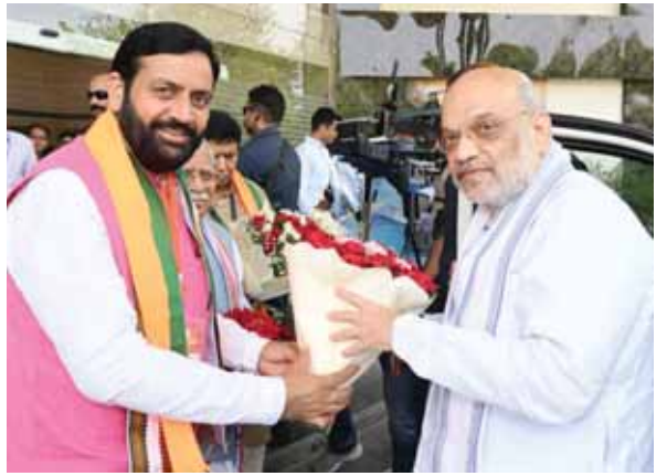
Haryana Chief Minister Nayab Singh welcomed Union Home Minister, Amit Shah at Panchkula on Saturday.

Chandigarh: Union Home Minister Amit Shah on Saturday said the BJP will fight the upcoming Haryana assembly elections alone under the leadership of Chief Minister Nayab Singh Saini, and exuded confidence the party will come back to power with full majority for its third consecutive term.