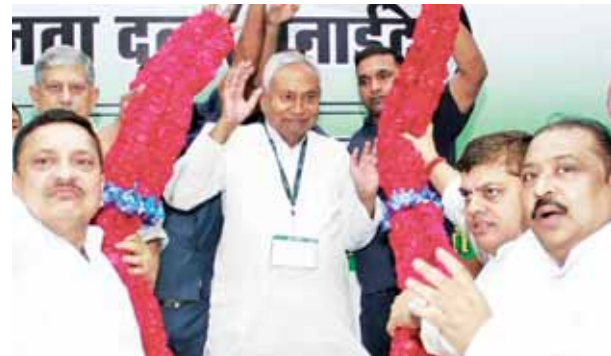
Bihar Chief Minister and JD(U) leader Nitish Kumar during the party's National Executive Meeting in New Delhi on Saturday. PTI

The Janata Dal (U), a major partner in the NDA Government at the Centre, on Saturday urged the Central Government to consider either special category status or a special package for Bihar underlining the party's important role in the formation of the Prime Minister Narendra Modi-led Government. The party's national executive meeting held in the national Capital flagged price rise and unemployment as "burning issues", as its political resolution expressed the confidence that the National Democratic Alliance (NDA) Government would take more effective steps to handle them. In the meeting chaired by JD (U) president and Bihar Chief Minister Nitish Kumar, the party appointed Rajya Sabha MP Sanjay Kumar Jha as its working president since he enjoys good rapport with the BJP leadership and is considered to be very good at crisis management. Meanwhile, Congress took the opportunity to ask JD (U) to pass a Cabinet resolution for the special status in Bihar where it's in alliance with the BJP and simultaneously hoped that another major partner of NDA, TDP, too would gather courage to press demand for a special package.