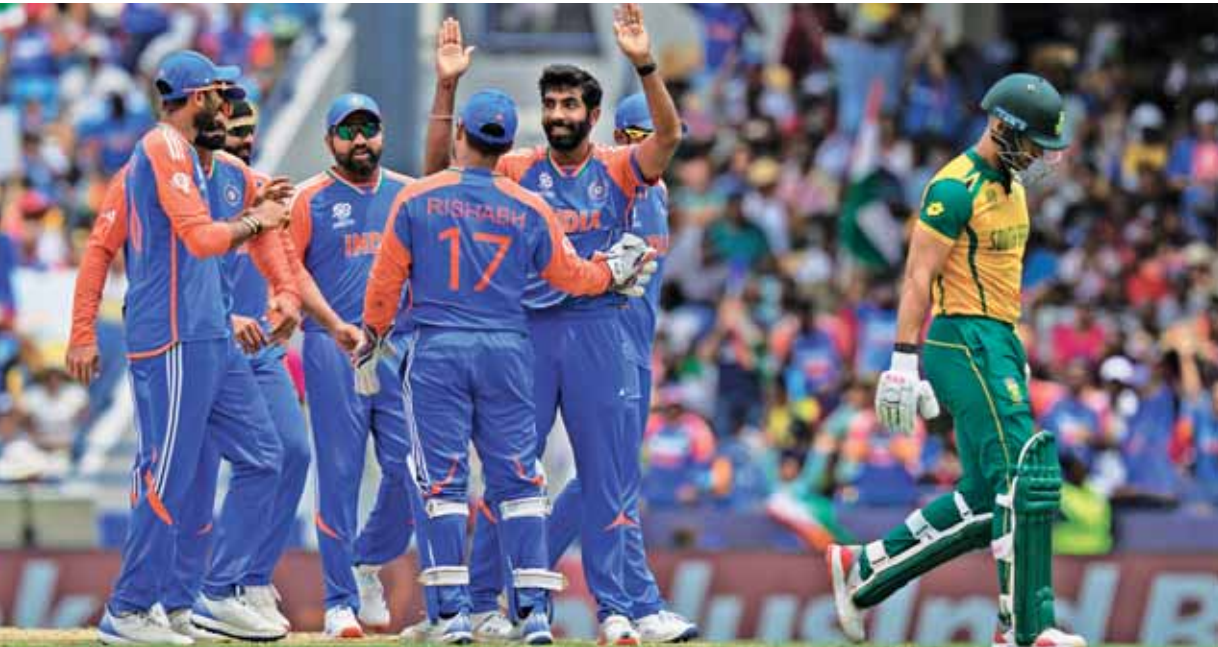
Team India erupts in celebration after South Africa's Reeza Hendricks, right, leaves the field after losing his wicket to India's Jasprit Bumrah, centre, with his arms raised, during the ICC Men's T20 World Cup final cricket match between India and South Africa at Kensington Oval in Bridgetown, Barbados, on Saturday.