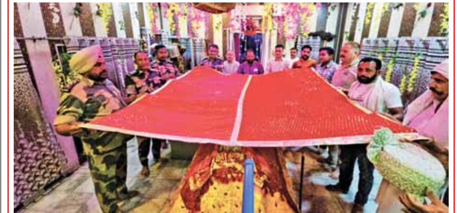
BSF personnel, along with villagers, offer 'chadar' at Baba Chamliyal shrine after the annual Indo-Pak fair organised on the two sides of the International Border (IB), in Samba district, on Thursday