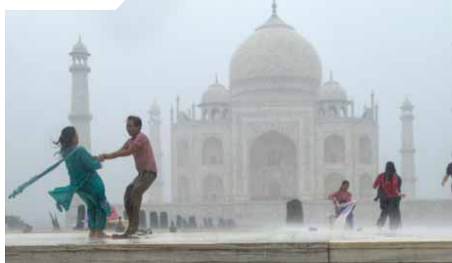
Tourists enjoy during rains, at the Taj Mahal, in Agra