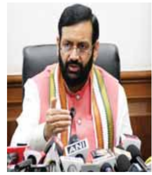
in the meeting.

In a move aimed at supporting the welfare of farmers, Haryana Chief Minister Nayab Singh Saini has decided to voluntarily increase the load of agricultural tube wells for them. Interested farmers can apply on the portal from July 1 to July 15 to increase the load of their tube wells. While addressing the media persons soon after presiding over the meeting of the State Cabinet, the Chief Minister informed about other significant decisions taken