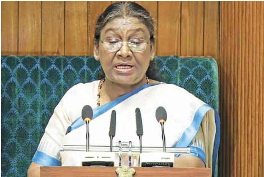
President Droupadi Murmu addresses the joint sitting of the Lok Sabha and Rajya Sabha, in New Delhi, on Thursday. The first session of the 18th Lok Sabha began on Monday and the 264th session of the Rajya Sabha will begin on June 27

Sabha Speaker Om Birla condemned the imposition of Emergency, Murmu too described in her speech the imposition of Emergency in 1975 as the "biggest and darkest chapter" of a direct attack on the Constitution and said the country triumphed over unconstitutional forces.