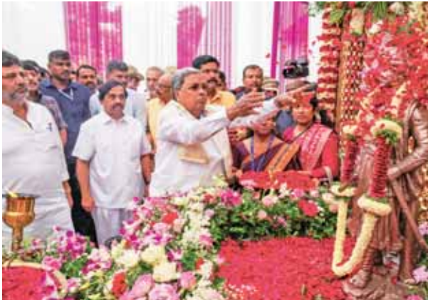
Karnataka Chief Minister Siddaramaiah pays floral tribute during the 515th birth anniversary celebration of Bengaluru's founder Nadaprabhu Kempegowda, at Kanteerava Stadium, in Bengaluru

"I urge Siddaramaiah to appoint DK Shivakumar as Chief Minister of the state. Despite others having held this position, DK Shivakumar has not yet served as Chief Minister. I believe it is within Siddaramaiah's power to make this decision, and I