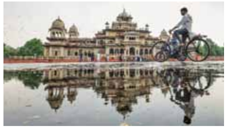
Albert Hall Museum is reflected in the puddle after rain in Jaipur

Regionwise, the MET has forecast, fairly widespread to widespread light to moderate rainfall accompanied with thunderstorm and lightning very likely over Konkan and Goa, Madhya Maharashtra, Karnataka, Kerala &