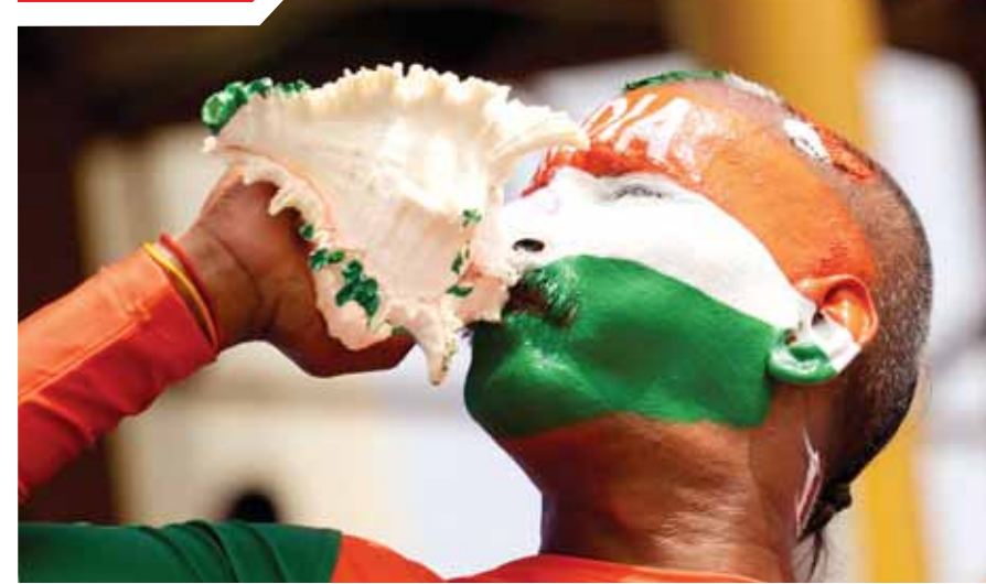
An Indian cricket fan blows into a shell horn prior to the ICC Men's T20 World Cup cricket match