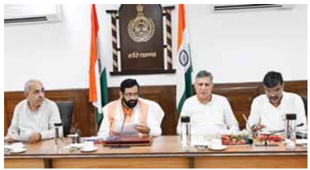
Horticulture University in village Kharkhari, Bhiwani district and Rs 358 crore in Karnal of the same university.

The Government official spokesperson said that in this meeting, final approval was given for the tender of 96 houses to be built for police personnel in Ambala at a cost of about Rs 19 crore. Apart from this, approval was given for construction work worth Rs 9.47 crore in Regional Research Station of Maharana Pratap