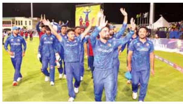
After scripting history on Tuesday by storming into the semi-finals of T20 World Cup, Afghanistan players celebrate

Sachin Tendulkar, Virender Sehwag, former Australia all-rounder Tom Moody, almost all Indian Premier League (IPL) teams and former India cricketers Yuvraj Singh,