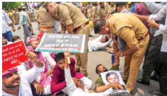
Police personnel detain Samajwadi Party workers protesting over the alleged irregularities in NEET 2024 results, near party chief Akhilesh Yadav's residence, in Lucknow, on Tuesday

According to sources present in the meeting, the committee took stock of the current situation and