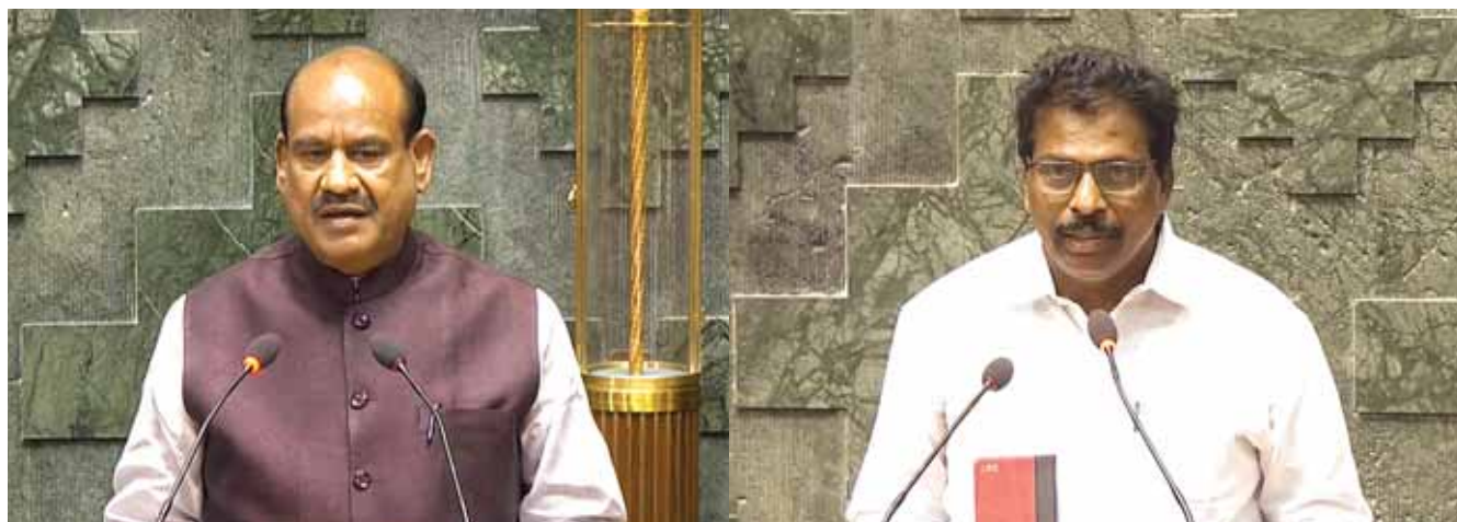
BJP MP Om Birla takes oath as a member of the House during the first session of the 18th Lok Sabha, in New Delhi, on Tuesday. Congress MP Kodikunnil Suresh (R) takes oath as a member of the House on Monday

"I appeal again that they should think about keeping in mind the dignity of the post of Speaker. We have the numbers but still, we are requesting that there should be no election for the post of Speaker because this post does not belong to any party," the