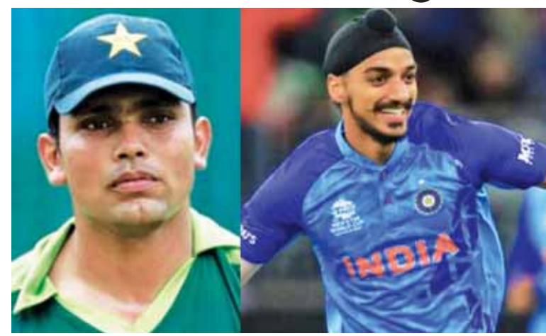
wrote on X, tagging Harbhajan. Akmal's remarks came during the tense penultimate over of the clash, when Pakistan needed 17 runs in the last over in their chase of 120. Left-arm pacer Arshdeep performed the task to perfection, sealing a six-run win over the arch-rivals. Akmal, while

PTI ■ LAHORE A day after being called out for making disrespectful comments against India pacer Arshdeep Singh, former Pakistan wicketkeeper-batter Kamran Akmal apologised for his "inappropriate" remarks while analysing the recent T20 World Cup clash between the two sides in New York. In a viral video, Akmal was seen making fun of Arshdeep's Sikh religion, prompting a furious response from ace Indian cricketer-turned-commentator Harbhajan. "I deeply regret my recent comments and sincerely apologise to Harbhajan Singh and the Sikh community. My words were inappropriate and disrespectful. I have the utmost respect for Sikhs all over the world and never intended to hurt anyone. I am truly sorry. #Respect #Apology," Akmal