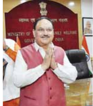
Union Health Minister JP Nadda

After that several names are doing the rounds which