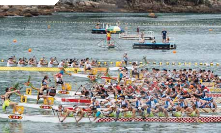
Competitors at the annual dragon boat race in Hong Kong