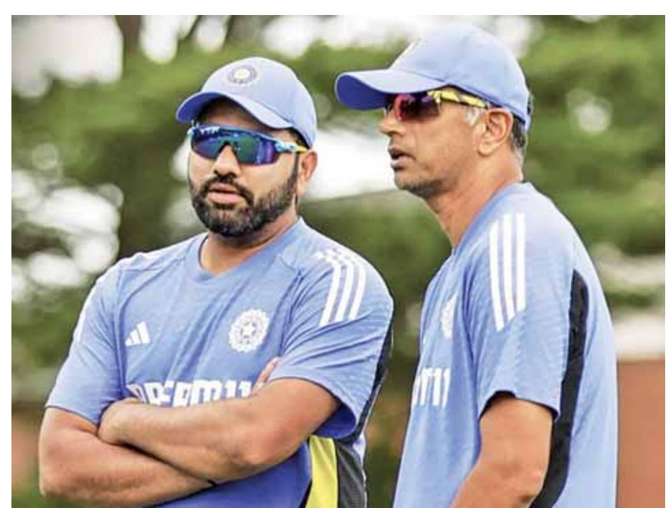
Rishabh Pant quiet will be of accuracy but that could well be dismantled by Pant, who is sure to use his feet. For Ali Khan, his extra pace and the bounce that he extracts from even benign surfaces would certainly provoke Rohit to use his pull shot frequently.

chance to bowl at Kohli and Sharma and face Bumrah even if it's far from being a sweet experience. But it's experience nevertheless and that too of a lifetime. For India, it will be their last match in the 'Big Apple' extension and the one where they wouldn't mind batting first. If India bowl first, there could be a high chance that USA might not be able to touch the three-figure mark against Bumrah, Mohammed Siraj and Ravindra Jadeja. There will be some beautiful and emotional sub-plots as well if Netravalkar gets a chance to bowl to his former Mumbai teammate Suryakumar Yadav with whom he played in Mumbai U-15, Ranji and Vijay Hazare Trophy. "It will be an emotional moment to play against India and especially Surya as we go back a long way," Netravalkar told PTI recently. For the two left-arm spinners Harmeet and Kenjige, the challenge of trying to keep