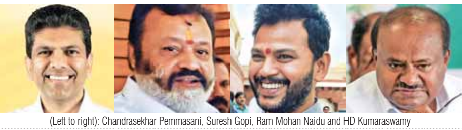
(Left to right): Chandrasekhar Pemmasani, Suresh Gopi, Ram Mohan Naidu and HD Kumaraswamy

Ram Mohan Naidu and Chandra Sekhar Pemmasani, JD(U)'s Lalan Singh and Ram Nath Thakur, Shiv Sena's Prataprao Jadhav besides other National Democratic Alliance members such as Chirag Paswan, Jitan Ram Manjhi, HD Kumaraswamy, Jayant Chaudhary, Ramdas Athawale, and Anupriya Patel are inducted in the Council of Ministers. BJP's G Kishan Reddy, Sukanta Majumdar, Jiten Prasad, Rao Inderjit Singh, Nityanand Rai and Bhagirath Choudhary are also inducted in new Government. Seven former Chief Ministers are part of the new Council of Ministers. The other six former Chief Ministers are Shivraj Singh Chouhan (Madhya Pradesh), Rajnath Singh (Uttar Pradesh), Manohar Lal Khattar (Haryana), Sarbananda Sonowal (Assam), H D Kumaraswamy (once dubbed the "accidental Chief Minister" by Karnataka BJP, (Karnataka), and Jitan Ram Manjhi (Bihar). While five of these former Chief Ministers are from the BJP Kumaraswamy and Manjhi represent two of the BJP's allies — JD(S) and Hindustani Awam Morcha, respectively. Meanwhile one its constituent in the NDA coalition, Ajit Pawar-led NCP, turned down BJP's offer to accommodate Praful Patel as a Minister of State with Independent charge said it was assured that "remedial measures" would be taken.