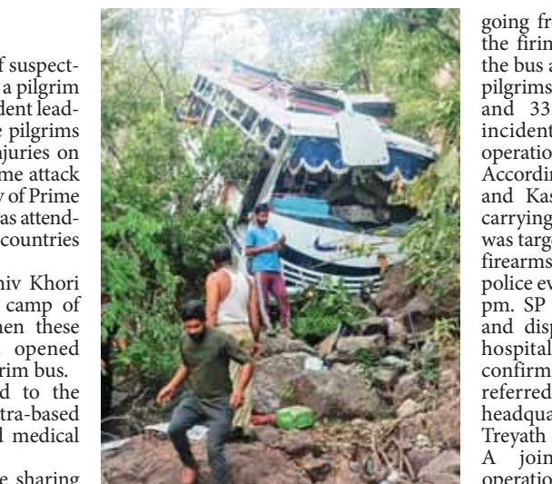
The damaged bus after it plunged into a gorge following an alleged attack by suspected terrorists, in Reasi district of Jammu and Kashmir

In a dastardly attack, a group of suspected Pakistani terrorists targeted a pilgrim bus which resulted in a fatal incident leading to the killing of at least nine pilgrims while 33 others also received injuries on Sunday at 6.10 pm. The gruesome attack coincided with the oath ceremony of Prime Minister Narendra Modi which was attended by heads of the neighbouring countries sans Pakistan. The bus was returning from Shiv Khori shrine towards the Katra base camp of Mata Vaishno Devi Shrine when these terrorists hiding in the area opened indiscriminate firing on the pilgrim bus. The injured have been rushed to the district hospital in Reasi and Katra-based Narayana hospital for advanced medical treatment. SSP Reasi Mohita Sharma while sharing details of the horrific incident told reporters, "Initial reports suggest that terrorists fired upon the passenger bus