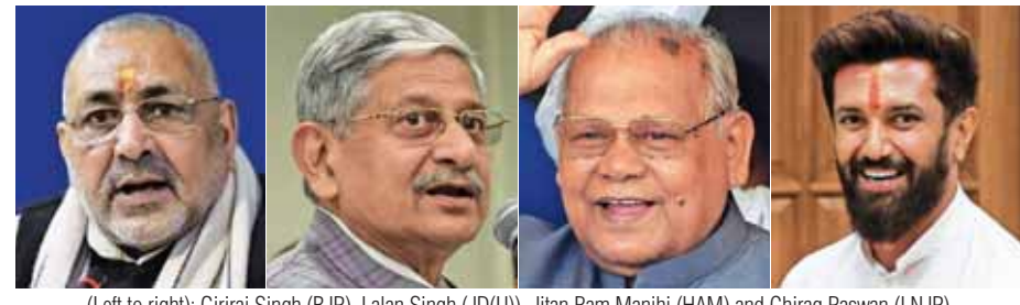
(Left to right): Giriraj Singh (BJP), Lalan Singh (JD(U)), Jitan Ram Manjhi (HAM) and Chirag Paswan (LNPJ)

Bihar got a better pie in the Modi.3 Council of Ministers when compared to Uttar Pradesh given the coalition dharma since the Nitish Kumar-led Janata Dal (U) and Chirag Paswan-led LJP have extended support to Narendra Modi with 12 and five Lok Sabha seats, respectively. Among the new faces included is Ram Nath Thakur. JD(U) leader and son of Bharat Ratna Karpoori Thakur. The moves send a strong message to the EBCs in Bihar. For the States — Bihar and UP — caste