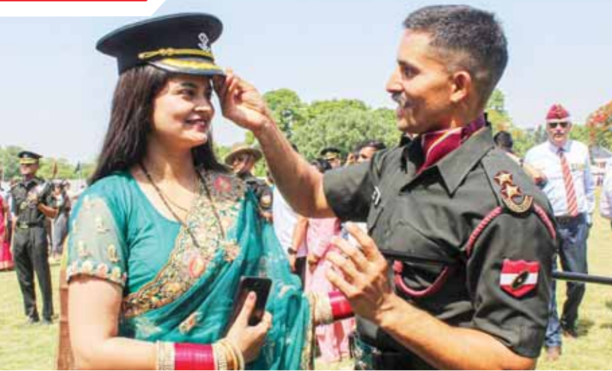
A newly inducted officer with his wife after the Passing Out Parade at the IMA, in Dehradun