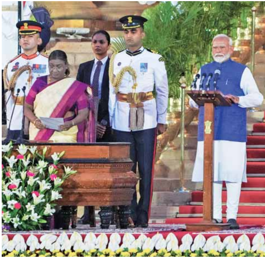
President Droupadi Murmu administers the oath of office to Narendra Modi as Prime Minister at Rashtrapati Bhavan in New Delhi on Sunday

Scripting a history, Prime Minister Narendra Modi on Sunday took over as Prime Minister for a third consecutive term becoming the first non-Congress leader and second after first Prime Minister Jawaharlal Nehru to don the mantle. With this Modi also becomes the only leader in the country to hold a constitutional post back to back for more than two decades which includes — three term as PM and prior serving 12 years as Chief Minister of Gujarat. President Draupadi Murmu administered Modi the oath of office and with this he also become the only PM to have been administered the oath by three presidents, including Pranab Mukherjee and Ramnath Kovind. Modi also under his regime was part of the consecration of Ram Temple in Ayodhya early this year and dedicated to the nation a new Parliament last year in September. If Modi completes his current five year term as PM leading the NDA regime he will have served a total of 27 years in office. He has been since leading his party to victory and power in 2002, 2007 and 2012 in Gujarat as CM and then in 2014 and 2019 at the Centre and again in 2024. It is though different this time as the BJP has lost majority on its own. Modi's third term which has