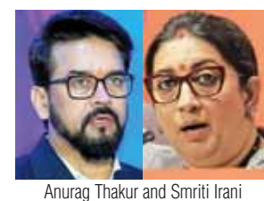
Anurag Thakur and Smriti Irani

Husbandry and Dairying in the Cabinet reshuffling of 2021, is likely to be dropped this time. During the election campaign, Rupala courted controversy by calling erstwhile 'maharajas' being subjects of the British and foreign rulers, angering the Kshatriya community. The omission of Union and Information Minister Anurag Thakur has surprised many as he was not among the leaders invited to meet Modi. The PM customarily