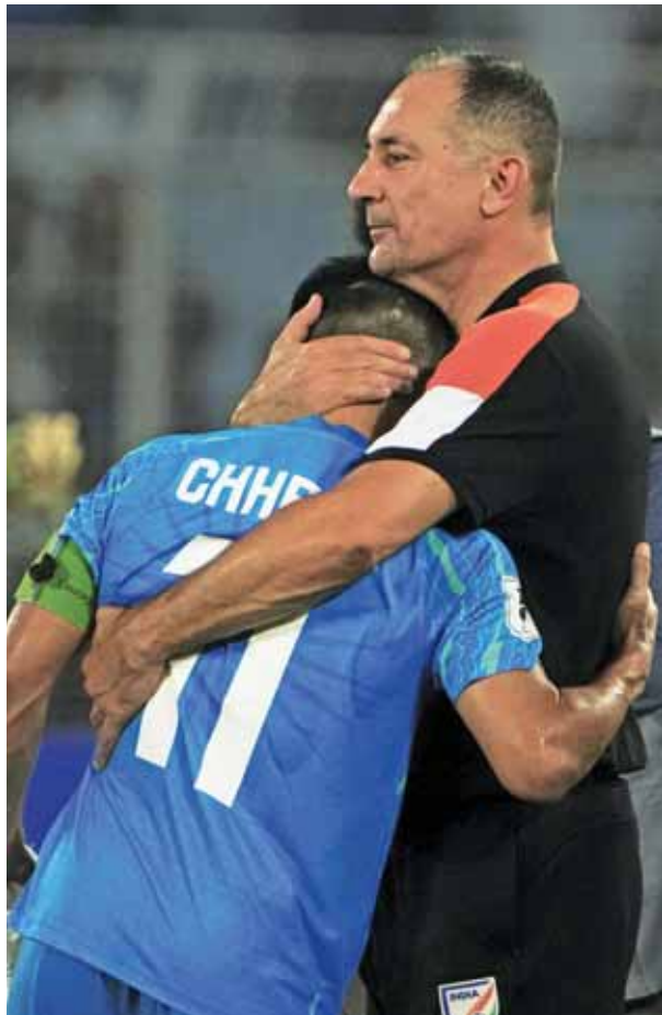
expected. The draw is realistic tonight, they opened the game much better and with more confidence — in terms of passing, speed of passing and moving," Stimac said.

Stimac was critical of Sahal Abdul Samad and Anirudh Thapa who failed to impress. "When you don't win the game and aren't happy with the result, how can you say that some players impressed you. You could see that we couldn't start dominating the game in the middle even if we started with Sahal and Thapa. I expected much more from them in the first half. "Sahal didn't play in the final stages. He was covering lots of ground, his defensive work was fantastic and he looked nice with Sunil. But I needed Sahal to be playmaker to dictate the game, create chances and also put in defensive work." Speaking about Thapa, Stimac said his performance was underwhelming considering that he is an experienced player. "Thapa has got enough experience to adapt to situations. I expect more from them as they have enough experience to do so," he added. The coach further gave his thumbs up to the fans for turning up in huge numbers to make Chhetri's last match extra special. "Huge appreciation for the fans, for their support." Chhetri stirred up emotions in his final outing but the Indian football team failed to convert the chances. "We are obviously disappointed with the result. The game was tough, as we