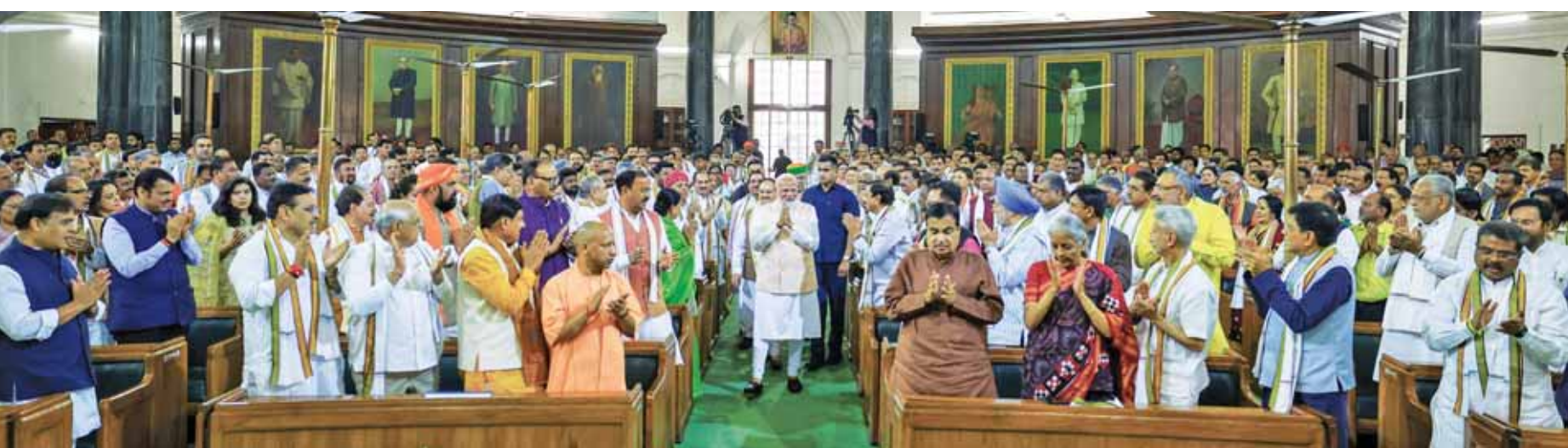
Prime Minister Narendra Modi arrives to attend the NDA Parliamentary Party meeting at Samvidhan Sadan, in New Delhi, on Friday

NEW INDIA, DEVELOPED INDIA, ASPIRATIONAL INDIA