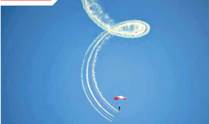
A parachutist lands ahead of the Canadian ceremony marking the 80th anniversary of the World War II D-Day