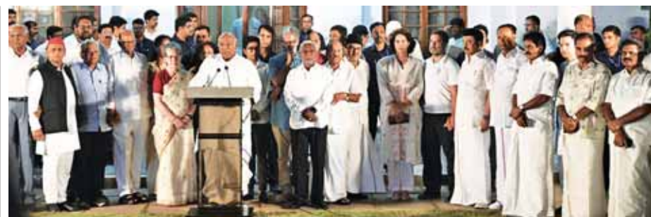
INDIA bloc leaders in New Delhi

sessions, leading to blockades within the complex. The Parliament Library building and the Annex are separated by a road that has a reception office and a row of barracks, housing security offices along a compound wall. The statue of Babasaheb Ambedkar is located inside the Parliament complex and thousands of visitors through the premises to pay tributes to him on his birth and death anniversaries. The Red Cross Road outside the Parliament premises will also become a part of the complex as there are plans to develop offices for Lok Sabha and Rajya Sabha members on the land which currently houses the International Red Cross Society. The row of barracks has been vacated and plans are also being made to demolish the compound wall separating the Parliament buildings from the Annex. These offices have been shifted to the North Utility Block of the new Parliament building.