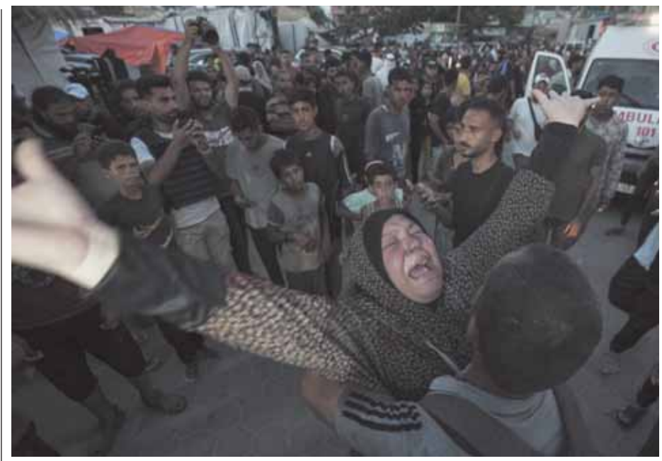
Palestinian woman mourns relatives killed in the Israeli bombardment of the Gaza Strip outside a hospital in Deir al Balah on Tuesday.

of Tuesday's contests as the last major candidates still running. But with many Americans saying in polls that they don't want a rematch of the 2020 election, Tuesday's results were watched for voter concerns about their choices as November's election barrels closer. Trump's domination during the GOP primary season has also been shadowed by support from a minority of GOP voters for former United Nations Ambassador Nikki Haley, who dropped out in March. Tuesday's contests were the first since Haley said two weeks ago that she would vote for Trump in November. In New Mexico, where she was still on the ballot, several thousand voters cast ballots for Haley, but she was running below 10 per cent of the vote late Tuesday. Biden has faced his own protest vote in recent contests as Democratic voters unhappy with his handling of Israel's war with Hamas seek to register their disapproval. There are organised campaigns in several states Tuesday to vote for "uncommitted" in the Democratic contests. In New Jersey's primary, "uncommitted" was on the ballot in many counties above the phrase, "Justice For Palestine, Permanent Ceasefire Now!" More than 35,000 people voted "uncommitted" in New Jersey as of late Tuesday.