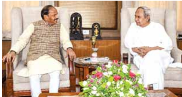
Outgoing Odisha Chief Minister Naveen Patnaik meets Governor Raghuraj Das to submit his resignation following the defeat of his party in the State Assembly elections at Raj Bhavan in Bhubaneswar on Wednesday