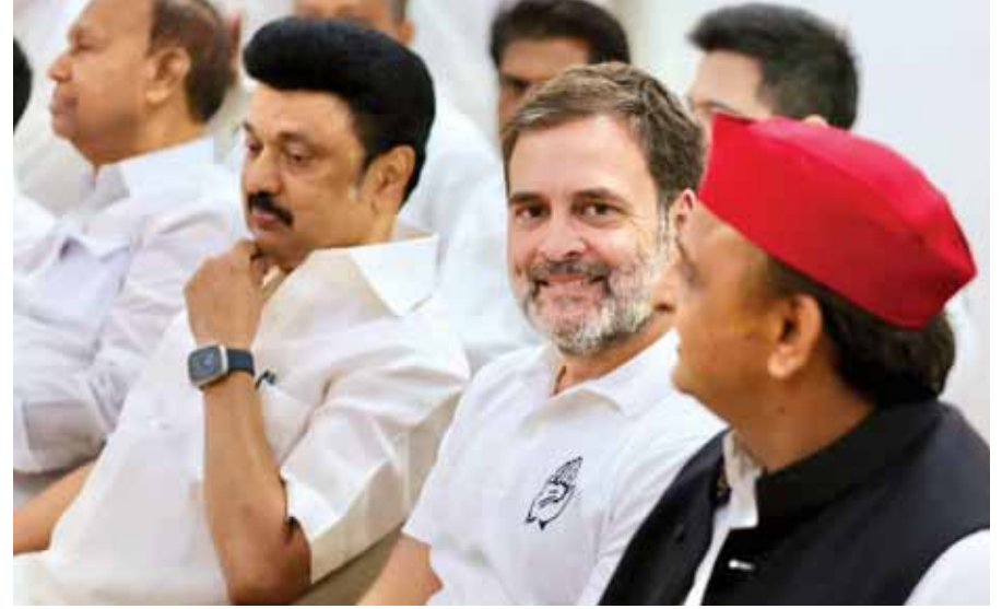
Congress leader Rahul Gandhi, Samajwadi Party leader Akhilesh Yadav, DMK supremo and Tamil Nadu Chief Minister MK Stalin amongst other INDIA Bloc partners at a meeting in New Delhi on Wednesday

Struggling for a tally to form a Government at the Centre by dislodging BJP-led NDA claims, the Congress led INDIA Bloc on Wednesday welcomed all parties that share a fundamental commitment to the values enshrined in the Preamble of Constitution towards formation of a government. Indicating for an "appropriate time", the INDIA Bloc in a statement said it will continue to fight against the fascist rule of the BJP-led by Narendra Modi. "We will take appropriate steps at the appropriate time to realise the people's desire not to be ruled by the BJP Govt. This is our decision that whatever promises we have made to the people, we will keep it up," Congress president Mallikarjun Kharge said while addressing the Opposition leaders who converged at his residence for the first meeting of the Bloc after its impressive gains in Lok Sabha that pulled down the ruling BJP's mark below the majority figure of 273 of the 543 members of Lok Sabha. "The mandate is decisively against Modi, against him and the substance and style of his politics. It is a huge political loss for him personally apart from being a clear moral defeat as well. However, he is determined to subvert the will of the