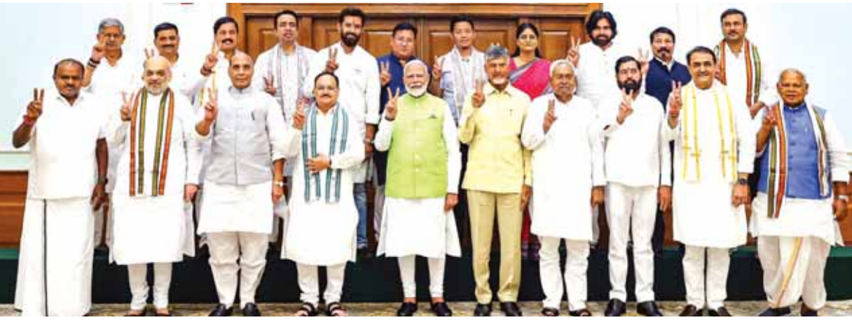
Prime Minister Narendra Modi, BJP president JP Nadda and other leaders during a meeting of the National Democratic Alliance (NDA) at 7, Lok Kalyan Marg, in New Delhi, on Wednesday