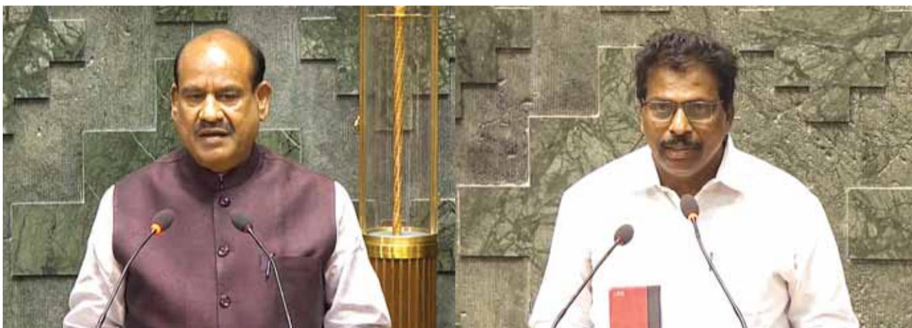
BJP MP Om Birla takes oath as a member of the House during the first session of the 18th Lok Sabha, in New Delhi, on Tuesday. Congress MP Kodikunnil Suresh (R) takes oath as a member of the House on Monday

Parliamentary Affairs Minister Kiren Rijiju urged the Congress not to force a contest for the post of Lok Sabha Speaker as the presiding officer does not belong to any party. "I appeal again that they should think about keeping in mind the dignity of the post of Speaker. We have the numbers but still, we are requesting that there should be no election for the post of Speaker because this post does not belong to any party," the