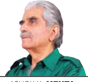
ASHOK K MEHTA

The Govt's decision to extend the tenure of Chief of Army Staff by 30 days, instead of announcing the new appointee has sparked controversy and conjecture