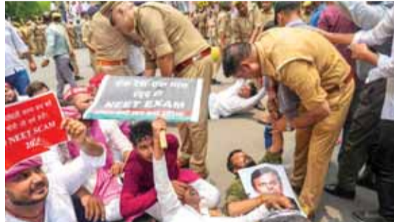
Police personnel detain Samajwadi Party workers protesting over the alleged irregularities in NEET 2024 results, near party chief Akhilesh Yadav's residence, in Lucknow, on Tuesday