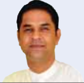
RAJYOGI BRAHMAKUMAR NIKUNJJI

The world is a stage where we each have a unique, pre-scripted part to play