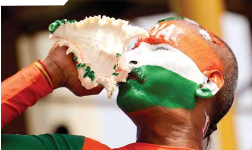
An Indian cricket fan blows into a shell horn prior to the ICC Men's T20 World Cup cricket match