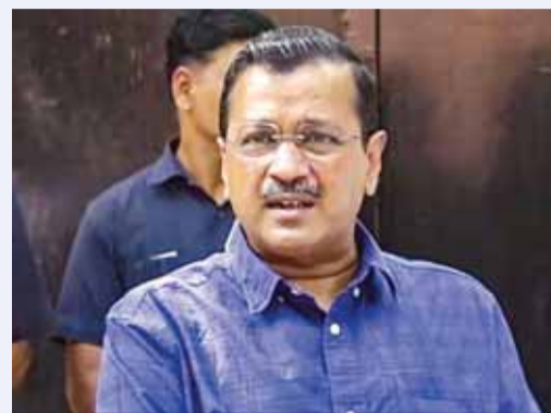
Delhi Chief Minister Arvind Kejriwal File photo