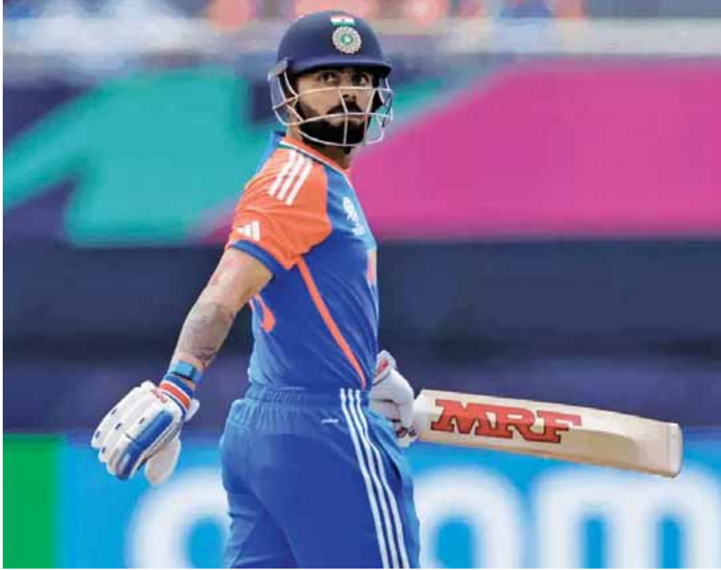
then it has to be as an opener and Kohli will have to return to his No.3 slot. While India's batting might, just as other teams, has been neutralised by the drop-in pitches in New York, their bowling worked like a well-oiled machine on those very tracks.

who must be hurting after those ordinary outings. The pitch at the Broward County stadium might not be as spiteful as the one in New York, where the uneven bounce of the tracks and the slow nature of the outfield became bigger talking points than the cricket that was played. What would ease some pressure on him is the fact that the lean run has not really affected the team's fortunes. However, the premier batter's low scores, particularly since he is opening alongside skipper Rohit Sharma, has put some pressure on the subsequent batters to take the India board forward. Creditably, Rishabh Pant and Suryakumar Yadav have more than made up for Kohli. Pant made 36 and 42 against Ireland and Pakistan, good enough contributions for India to emerge victors. Suryakumar overcame a diffident start to the tournament just at the right time, making a crucial fifty against the USA. 'Spin Basher' Shivam Dube has been on a tailspin since his arrival in the US, but a laboured 31 off 35 balls against the co-hosts might just have fetched him another game ahead of the waiting Sanju Samson and Yashasvi Jaiswal. If India want to bring in Jaiswal,