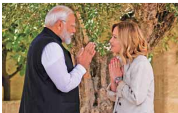
Indian Prime Minister Narendra Modi, left, is welcomed by Italian Prime Minister Giorgia Meloni at the G7 in Borgo Egnazia, near Bari in southern Italy

with punishment for unlawful activities for advocating, abetting or inciting any unlawful activity and is punishable with imprisonment for up to seven years. Section 153A IPC deals with "promoting enmity between different groups on ground of religion, race, place of birth, residence, language, etc., and doing acts prejudicial to maintenance of harmony", while Section 153B with "imputations, assertions prejudicial to national-integration". Section 505 deals with intentional insult with intent to provoke breach of the peace. Roy and Hussain had allegedly made provocative speeches at a conference organised under the banner of 'Azadi — The Only Way' on October 21, 2010 at LTG Auditorium, Copernicus Marg, here. "The issues discussed and spoken about at the conference propagated the separation of Kashmir from India," said the official. Those who delivered speeches at the conference included Syed Ali Shah Geelani, SAR Geelani (anchor of the conference and prime accused in Parliament attack case), Arundhati Roy, Dr Sheikh Showkat Hussain and Varavara Rao.