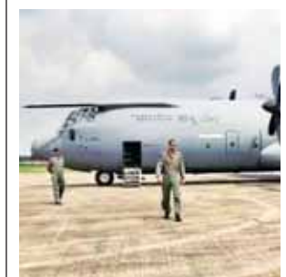
IAF aircraft brings back mortal remains of Indian fire victims from Kuwait on Friday