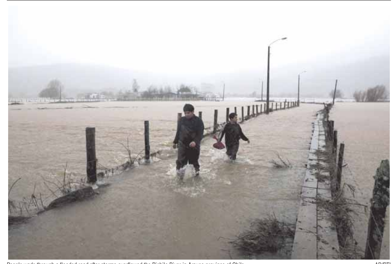
People wade through a flooded road after storms overflowed the Pichilo River in Arauco province of Chile