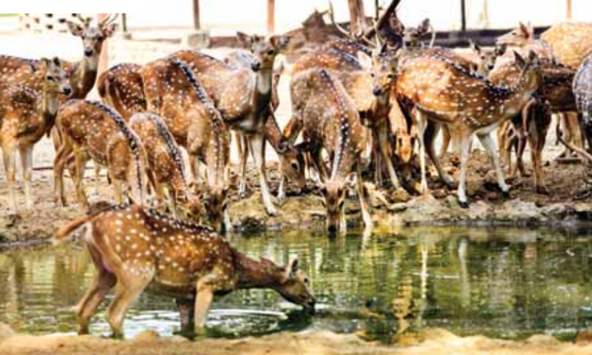
Spotted deer drink water inside their zoo enclosure on a hot summer day, in Patna