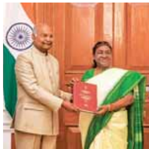
Former President Ram Nath Kovind with President Droupadi Murmu File Photo

Keeping with its commitment, the Centre is all set to table the report of the former President Ram Nath Kovind led high-level committee on "one nation, one election" soon in the Cabinet to decide the future course of action. After the approval of the Cabinet, a Bill in this regard is likely to be tabled in Parliament during the Monsoon Session in July which will be a full-fledged first Session of Narendra Modi's third tenure as the Prime Minister in the BJP-led NDA regime. The annual Budget is also to be brought in beginning of the Monsoon session. Sources said the Union Law Ministry is working "overtime" on it which is also part of the 100-day agenda of the Legislative Affairs Department which was set ahead of the Lok Sabha elections by Prime Minister Narendra Modi. Before going to polls in its last Cabinet of the second tenure in March, Modi had directed all Union Ministries and departments to draw up a 100-day agenda for the next Government. In the midst of election campaign in May, Defence Minister Rajnath Singh said the NDA, if voted to power for the third term, will