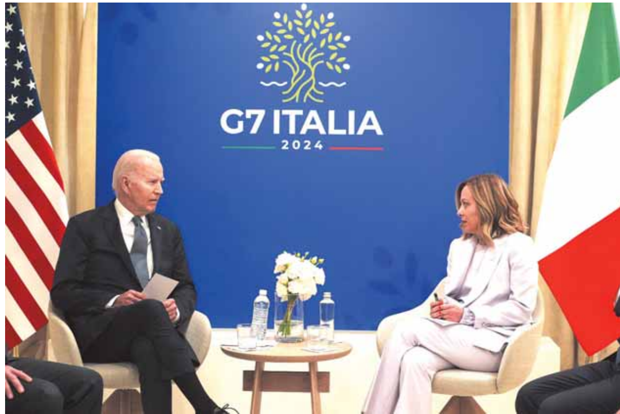
US President Joe Biden and Italian Prime Minister Giorgia Meloni, right, meet for bilateral talks at the G7 on Friday in Borgo Egnazia, near Bari, southern Italy.

Two people have been found dead after explosions in an underground parking garage at an apartment building in northern Switzerland and 11 others sustained minor injuries, authorities said Friday. Swiss media reported that the explosions created a large cloud of smoke that was visible from afar and the explosions were heard from well outside the town. Police said that the fire at one point spread to several floors of the building. Several buildings were evacuated. The explosions rocked the Nussbaumen neighbourhood of the small town of Obersiggenthal, northwest of Zurich, at about 7 pm Thursday. Police in Aargau canton (state) said they appeared to have been caused by an accident, but didn’t give more details.