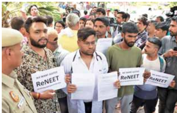
Students' organisations protest at Shastri Bhawan on Friday against NEET exam, demanding for the exam to be held again

Panchayats elections are held within 100 days of holding elections to the House of the People and the State Legislative Assemblies. Separately, the Law Commission is also likely to come up soon with its own report on simultaneous polls, of which Modi has been a strong votary. Sources said the Law Commission is likely to recommend holding simultaneous polls for all three tiers of Government — Lok Sabha, State Assemblies and local bodies — starting from 2029 and a provision for a unity Government in cases like hung house or no-confidence motion. The Kovind panel had also proposed setting up an 'Implementation Group' to look into the execution of the recommendations made by the committee. "Simultaneous polls will help save resources, spur development and social cohesion, deepen 'foundations of democratic rubric' and help realise the aspirations of 'India, that is Bharat', the panel had said. It has also recommended the preparation of a common electoral roll and voter ID cards by the Election Commission of India in consultation with state election authorities.