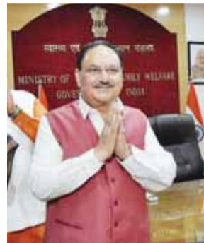
Union Health Minister JP Nadda

After that several names are doing the rounds which include the party's general