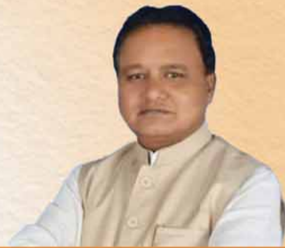
Shri Mohan Charan Majhi Hon'ble Chief Minister (Designate)