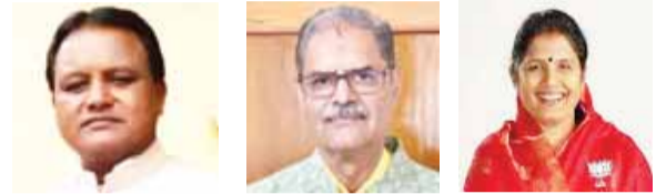
Mohan Charan Majhi