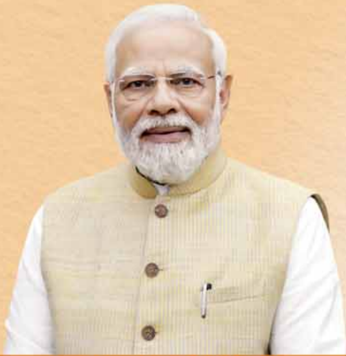
Shri Narendra Modi Hon'ble Prime Minister