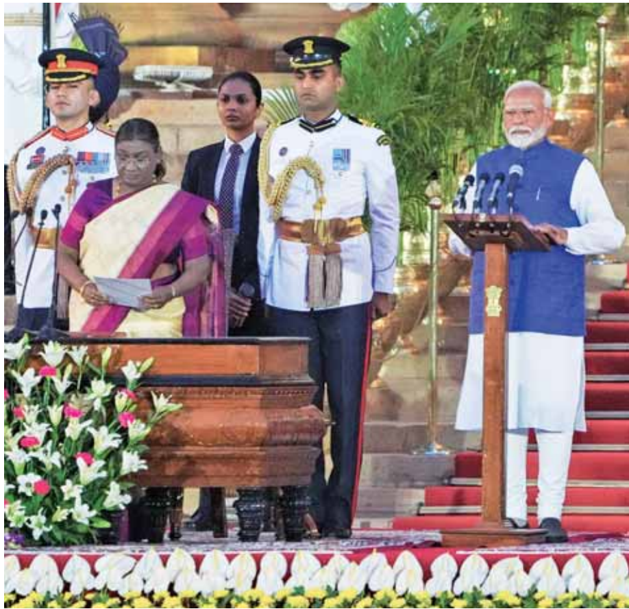
President Droupadi Murmu administers the oath of office to Narendra Modi as Prime Minister at Rashtrapati Bhavan in New Delhi on Sunday

Scripting a history, Prime Minister Narendra Modi on Sunday took over as Prime Minister for a third consecutive term becoming the first non-Congress leader and second after first Prime Minister Jawaharlal Nehru to don the mantle. With this Modi also becomes the only leader in the country to hold a constitutional post back to back for more than two decades which includes — three term as PM and prior serving 12 years as Chief Minister of Gujarat. President Draupadi Murmu administered Modi the oath of office and with this he also become the only PM to have been administered the oath by three presidents, including Pranab Mukherjee and Ramnath Kovind. Modi also under his regime was part of the consecration of Ram Temple in Ayodhya early this year and dedicated to the nation a new Parliament last year in September. If Modi completes his current five year term as PM leading the NDA regime he will have served a total of 27 years in office. He has been since leading his party to victory and power in 2002, 2007 and 2012 in Gujarat as CM and then in 2014 and 2019 at the Centre and again in 2024. It is though different this time as the BJP has lost majority on its own. Modi's third term which has