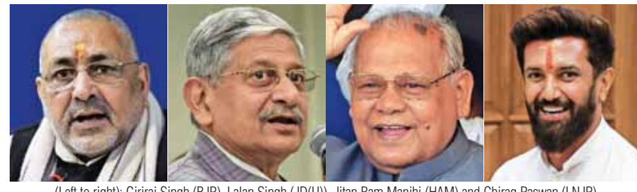
(Left to right): Giriraj Singh (BJP), Lalan Singh (JD(U)), Jitan Ram Manjhi (HAM) and Chirag Paswan (LJNP)

Among the new faces included is Ram Nath Thakur. JD(U) leader and son of Bharat Ratna Karpoori Thakur. The moves send a strong message to the EBCs in Bihar. For the States — Bihar and UP — caste