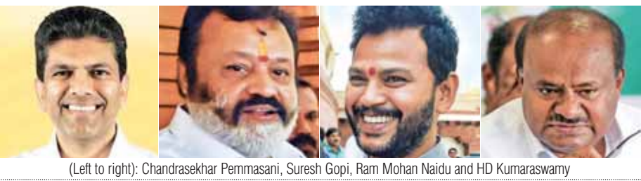
(Left to right): Chandrasekhar Pemmasani, Suresh Gopi, Ram Mohan Naidu and HD Kumaraswamy

Ram Mohan Naidu and Chandra Sekhar Pemmasani, JD(U)'s Lalan Singh and Ram Nath Thakur, Shiv Sena's Prataprao Jadhav besides other National Democratic Alliance members such as Chirag Paswan, Jitan Ram Manjhi, HD Kumaraswamy, Jayant Chaudhary, Ramdas Athawale, and Anupriya Patel are inducted in the Council of Ministers. BJP's G Kishan Reddy, Sukanta Majumdar, Jiten Prasad, Rao Inderjit Singh, Nityanand Rai and Bhagirath Choudhary are also inducted in new Government. Seven former Chief Ministers are part of the new Council of Ministers. The other six former Chief Ministers are Shivraj Singh Chouhan (Madhya Pradesh), Rajnath Singh (Uttar Pradesh), Manohar Lal Khattar (Haryana), Sarbananda Sonowal (Assam), H D Kumaraswamy (once dubbed the "accidental Chief Minister" by Karnataka BJP, (Karnataka), and Jitan Ram Manjhi (Bihar). While five of these former Chief Ministers are from the BJP Kumaraswamy and Manjhi represent two of the BJP's allies — JD(S) and Hindustani Awam Morcha, respectively. Meanwhile one its constituent in the NDA coalition, Ajit Pawar-led NCP, turned down BJP's offer to accommodate Praful Patel as a Minister of State with Independent charge said it was assured that "remedial measures" would be taken.