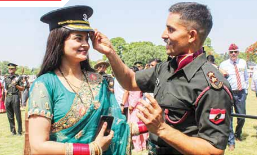
A newly inducted officer with his wife after the Passing Out Parade at the IMA, in Dehradun