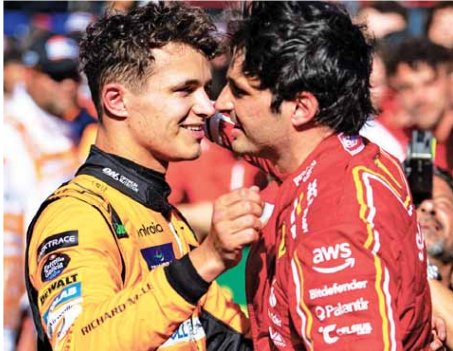
picture once we hit the track, the reality is we are so closely matched between those three teams." Verstappen has a 31-point lead over Leclerc in the drivers' championship. Norris trails Leclerc by 25 points, equal to one race win. But three drivers from three teams - Norris, Leclerc and Verstappen - have won the last three races for the first time since 2021. Last season, Verstappen won his second consecutive Canadian Grand Prix amid a run of a record 10 straight victories. "I'm not focused on what the others are doing because that's just a waste of time and energy," the 26-year-old Dutchman said. "We know that from our side, there are things that we can do better and that's what we'll focus on." While Ferrari appears to thrive on courses where curbing-riding is a big factor, the opposite has been true for Red Bull. Verstappen called Monaco, where he finished sixth and Red Bull teammate Sergio Perez did not finish, a reminder of that. "This is something that we know, and we haven't been able to fix it yet. I do think that after Monaco, it gave us another wake-up call," Verstappen said. "With everyone catching up, naturally, you can't rely on your advantage anymore even though your curbing-riding is bad.

Lando Norris is putting the Lpressure on Ferrari. The McLaren Formula 1 driver said the Canadian Grand Prix could be anyone's race Sunday, but he's giving the edge to the Italian team after Charles Leclerc's victory two weeks ago in Monaco. "I think they're favorites," Norris said Thursday. "It's impossible for me to say if it's going to be us, Ferrari or Red Bull on top. That's why it's exciting, because none of us really know." Led by three-time defending season champion Max Verstappen, Red Bull won 21 of 22 races last year. Verstappen had a record 19 victories. Red Bull tops the constructors' championship this season, but Leclerc's victory helped Ferrari move within 24 points. Norris thinks Ferrari could have the upper hand again this weekend, partially because curbing-riding is such a factor at recently resurfaced Circuit Gilles Villeneuve. Leclerc downplayed the favorite talk. "Everybody doesn't want to be going into a weekend hearing that they are favorites," Leclerc said. "You're never going to hear me (say) we are 100% the favorite this weekend and the same for them, so you've got to throw the ball to your closest opponents. "It might not be the true