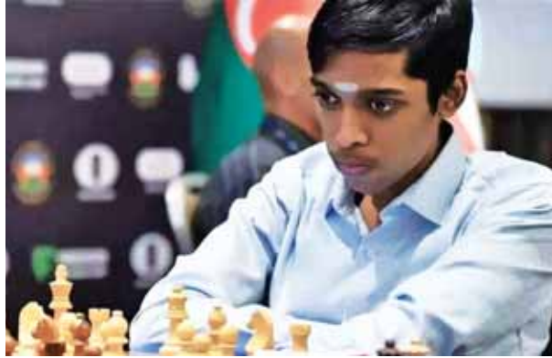
loss at the hands of Tingjie Lei of China and was relegated to fourth spot while Koneru Humpy went down to tournament leader Wenju Ju of China. Wenjun Ju of China strengthens her claim for the title by moving to 16 points. Tingjie Lei and Anna Muzychuk of Ukraine follow her 1.5 points behind while Vaishali on 11.5 is a distant

Indian Grandmaster R Praggnanandhaa went down fighting against Fabiano Caruana of United States while world number one Magnus Carlsen inflicted an Armageddon defeat on France's Firouzja Alireza in the penultimate round of Norway Chess tournament here. With 16 points in his bag, Carlsen stretched his lead to 1.5 points over nearest rival Hikaru Nakamura, who was in for a shock as World Champion Ding Liren, for once, did not blow his position away. Praggnanandhaa, despite the loss against Caruana in Armageddon, is still third on 13 points, a full point ahead of Alireza. Caruana on 10.5 comes in next in standings ahead of Liren (6), who spoiled Nakamura's party. In the women's section, R Vaishali succumbed to another