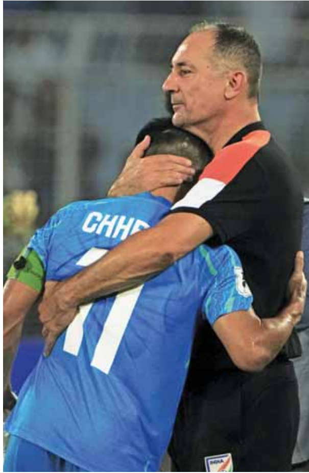
expected. The draw is realistic tonight, they opened the game much better and with more confidence — in terms of passing, speed of passing and moving," Stimac said.

Stimac was critical of Sahal Abdul Samad and Anirudh Thapa who failed to impress. "When you don't win the game and aren't happy with the result, how can you say that some players impressed you. You could see that we couldn't start dominating the game in the middle even if we started with Sahal and Thapa. I expected much more from them in the first half. "Sahal didn't play in the final stages. He was covering lots of ground, his defensive work was fantastic and he looked nice with Sunil. But I needed Sahal to be playmaker to dictate the game, create chances and also put in defensive work." Speaking about Thapa, Stimac said his performance was underwhelming considering that he is an experienced player. "Thapa has got enough experience to adapt to situations. I expect more from them as they have enough experience to do so," he added. The coach further gave his thumbs up to the fans for turning up in huge numbers to make Chhetri's last match extra special. "Huge appreciation for the fans, for their support." Chhetri stirred up emotions in his final outing but the Indian football team failed to convert the chances. "We are obviously disappointed with the result. The game was tough, as we