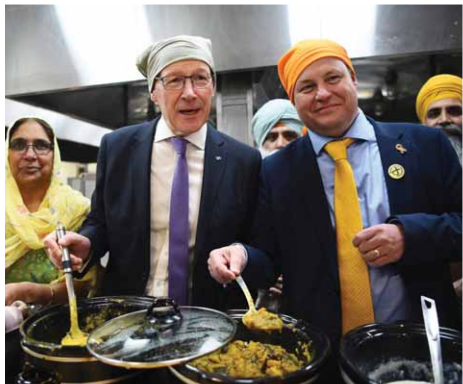
SNP leader John Swinney, centre, and parliamentary candidate Chris Stephens, right, are shown the kitchens during their visit to the Glasgow Gurdwara, while on the General Election campaign trail, in Glasgow, Scotland, Friday.

weekend," Democratic Alliance federal chairperson Helen Zille said Friday. The fifth-biggest party with nearly 4 per cent of the national vote, the Inkatha Freedom Party, on Friday expressed willingness to be part of the government of national unity, but was also set to discuss the matter with its party structures over the next few days. "In principle, the IFP is not averse to a GNU (government of national unity). However, the devil is in the details, which will become clearer in the coming days ... enabling the IFP to make a well-considered decision," IFP spokesman Mkhuleko Hlengwa said. The uMkhonto weSizwe Party led by former President Jacob Zuma, who left the ANC, was the latest to enter the negotiations, with the party confirming on Thursday that it had begun talks with the ANC after initially failing to respond to the party's invitation.