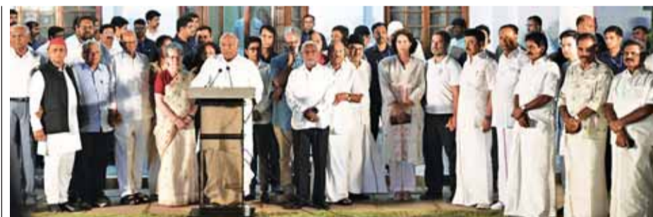
INDIA Bloc leaders in New Delhi

sessions, leading to blockades within the complex. The Parliament Library building and the Annex are separated by a road that has a reception office and a row of barracks, housing security offices along a compound wall. The statue of Babasaheb Ambedkar is located inside the Parliament complex and thousands of visitors through the premises to pay tributes to him on his birth and death anniversaries. The Red Cross Road outside the Parliament premises will also become a part of the complex as there are plans to develop offices for Lok Sabha and Rajya Sabha members on the land which currently houses the International Red Cross Society. The row of barracks has been vacated and plans are also being made to demolish the compound wall separating the Parliament buildings from the Annex. These offices have been shifted to the North Utility Block of the new Parliament building.