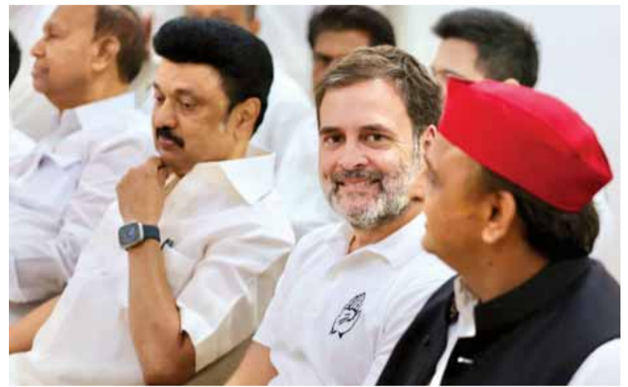
Congress leader Rahul Gandhi, Samajwadi Party leader Akhilesh Yadav, DMK supremo and Tamil Nadu Chief Minister MK Stalin amongst other INDIA Bloc partners at a meeting in New Delhi on Wednesday

Struggling for a tally to form a Government at the Centre by dislodging BJP-led NDA claims, the Congress led INDIA Bloc on Wednesday welcomed all parties that share a fundamental commitment to the values enshrined in the Preamble of Constitution towards formation of a government. Indicating for an "appropriate time", the INDIA Bloc in a statement said it will continue to fight against the fascist rule of the BJP-led by Narendra Modi. "We will take appropriate steps at the appropriate time to realise the people's desire not to be ruled by the BJP Govt. This is our decision that whatever promises we have made to the people, we will keep it up," Congress president Mallikarjun Kharge said while addressing the Opposition leaders who converged at his residence for the first meeting of the Bloc after its impressive gains in Lok Sabha that pulled down the ruling BJP's mark below the majority figure of 273 of the 543 members of Lok Sabha. "The mandate is decisively against Modi, against him and the substance and style of his politics. It is a huge political loss for him personally apart from being a clear moral defeat as well. However, he is determined to subvert the will of the