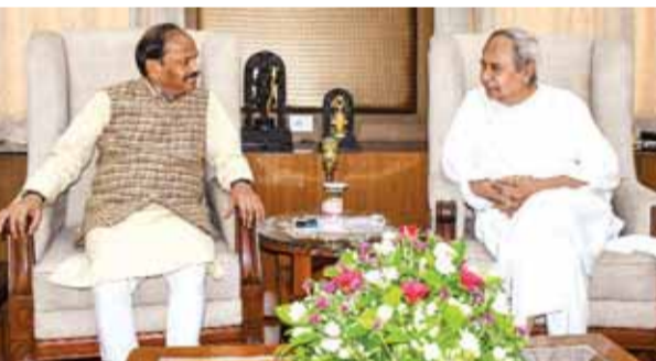
Outgoing Odisha Chief Minister Naveen Patnaik meets Governor Raghuraj Das to submit his resignation following the defeat of his party in the State Assembly elections at Raj Bhavan in Bhubaneswar on Wednesday

waiting journalists and left the premises after submitting his resignation letter. The BJP stormed to power in Odisha by securing 78 of the 147 Assembly seats, while the BJD managed to win only 51 seats. Congress bagged 14 constituencies and CPI (M) secured one, while three Independent candidates also emerged victorious. Patnaik and BJP and Congress State presidents Manmohan Samal and Sarat Pattanayak respectively, had to suffer defeats in the Odisha Assembly elections. Although Patnaik won from his traditional Hinjili Assembly seat in Ganjam district by a slender margin of 4,636 votes, the five-term