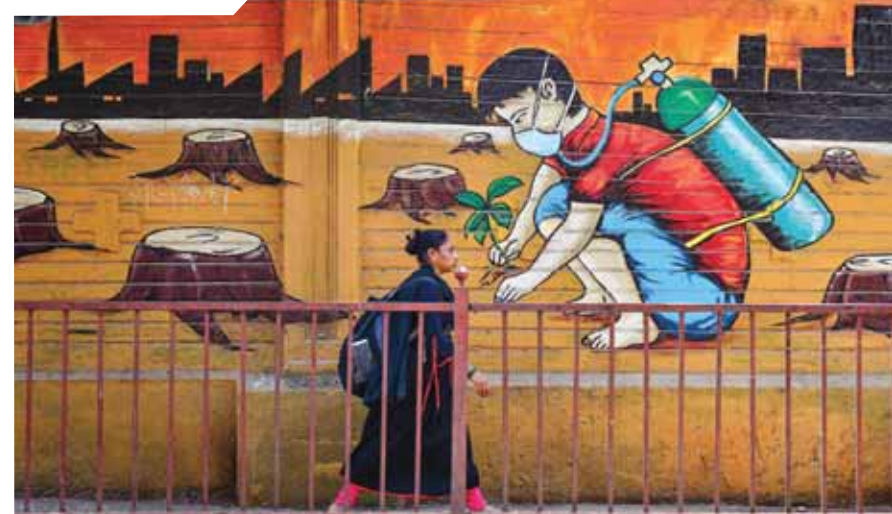
A pedestrian walks past a mural, made to create awareness on the environment and reforestation, in Mumbai