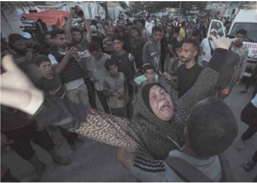
Palestinian woman mourns relatives killed in the Israeli bombardment of the Gaza Strip outside a hospital in Deir al Balah on Tuesday.

In New Jersey's primary, "uncommitted" was on the ballot in many counties above the phrase, "Justice For Palestine, Permanent Ceasefire Now!" More than 35,000 people voted "uncommitted" in New Jersey as of late Tuesday.