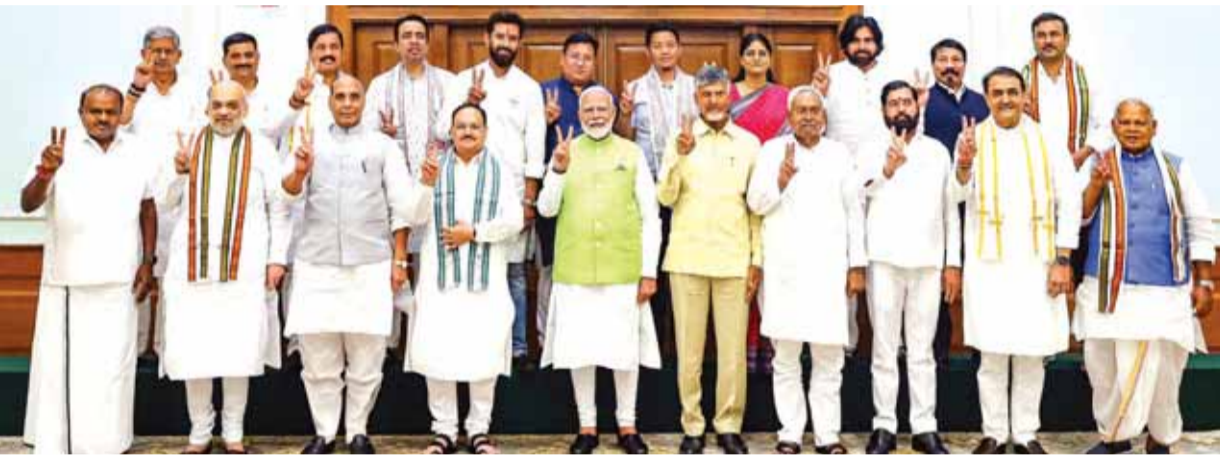
Prime Minister Narendra Modi, BJP president JP Nadra and other leaders during a meeting of the National Democratic Alliance (NDA) at 7, Lok Kalyan Marg, in New Delhi, on Wednesday