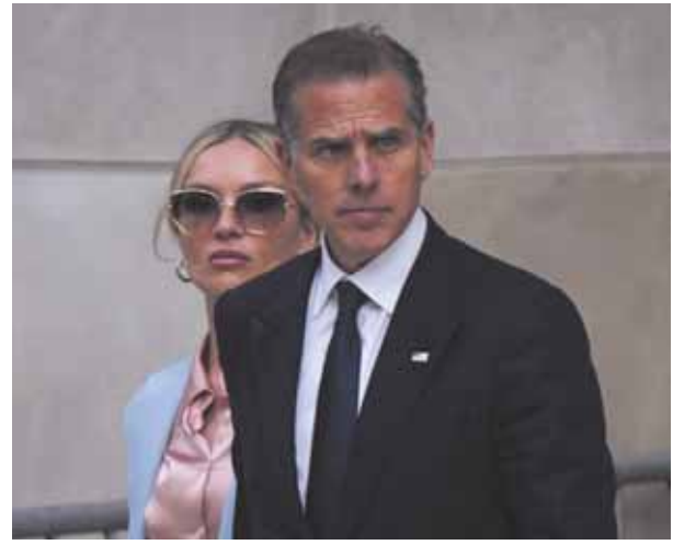
Hunter Biden, accompanied by his wife, Melissa Cohen Biden, departs from federal court, Tuesday, June 4, 2024, in Wilmington.