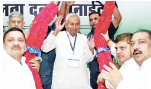
Bihar Chief Minister and JD(U) leader Nitish Kumar during the party's National Executive Meeting in New Delhi on Saturday

The Janata Dal (U), a major partner in the NDA Government at the Centre, on Saturday urged the Central Government to consider either special category status or a special package for Bihar underlining the party's important role in the formation of the Prime Minister Narendra Modi-led Government. The party's national executive meeting held in the national Capital flagged price rise and unemployment as "burning issues", as its political resolution expressed the confidence that the National Democratic Alliance (NDA) Government would take more effective steps to handle them. In the meeting chaired by JD (U) president and Bihar Chief Minister Nitish Kumar, the party appointed Rajya Sabha MP Sanjay Kumar Jha as its working president since he enjoys good rapport with the BJP leadership and is considered to be very good at crisis management. Meanwhile, Congress took the opportunity to ask JD (U) to pass a Cabinet resolution for the special status in Bihar where it's in alliance with the BJP and simultaneously hoped that another major partner of NDA, TDP, too would gather courage to press demand for a special package.