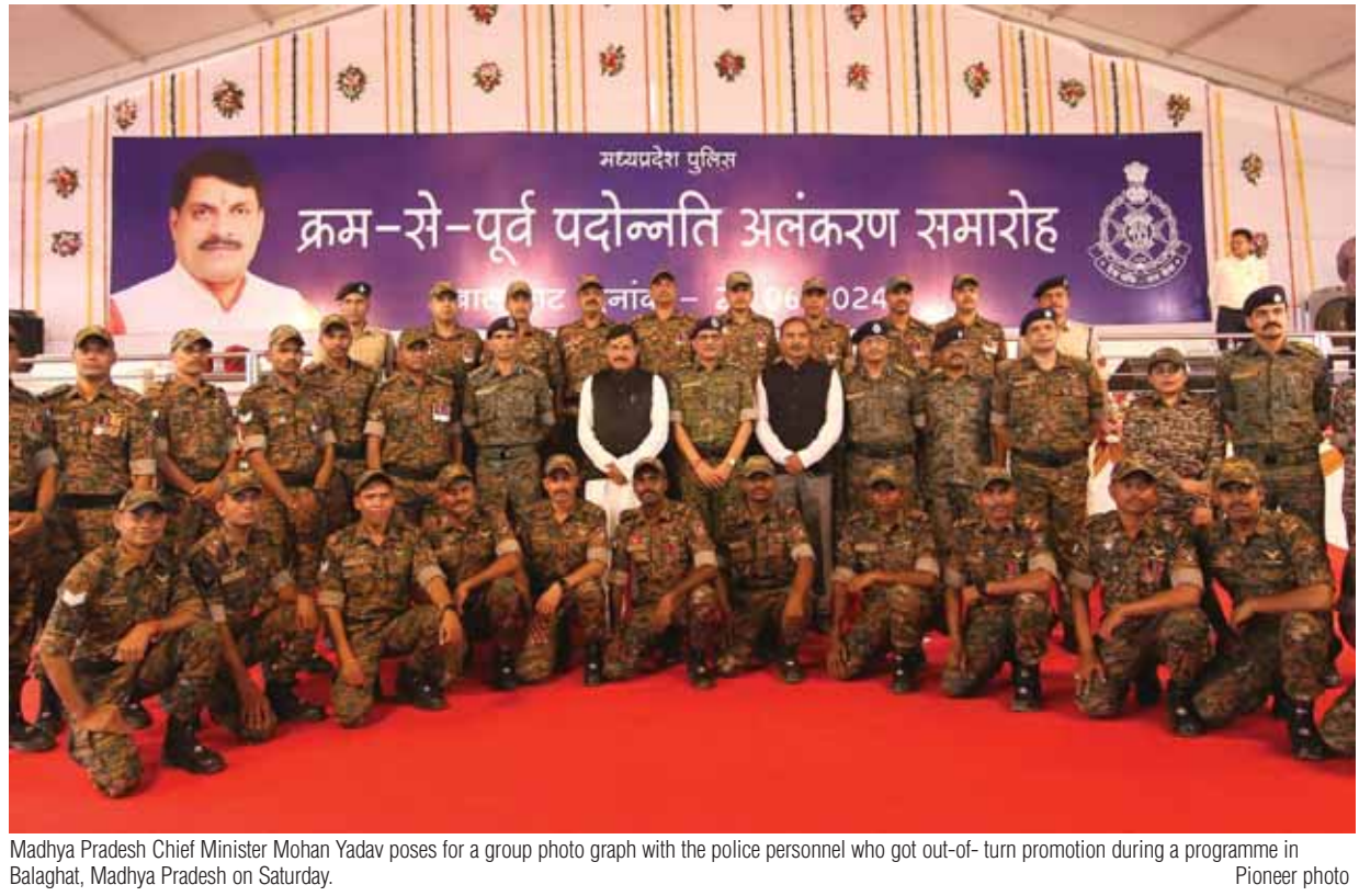
Madhya Pradesh Chief Minister Mohan Yadav poses for a group photo graph with the police personnel who got out-of- turn promotion during a programme in Balaghat, Madhya Pradesh on Saturday.

has occurred for the third time in 10 years. Heavy rain will continue on Sunday as well. In such a situation, the record of the year 2021 is likely to break.