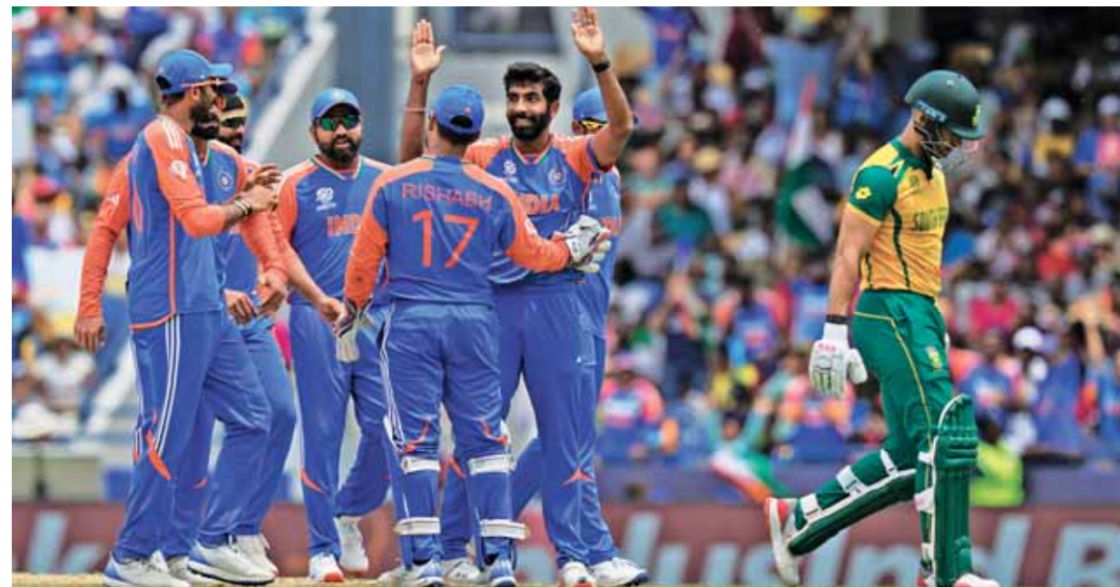
Team India erupts in celebration after South Africa's Reeza Hendricks, right, leaves the field after losing his wicket to India's Jasprit Bumrah, centre, with his arms raised, during the ICC Men's T20 World Cup final cricket match between India and South Africa at Kensington Oval in Bridgetown, Barbados, on Saturday