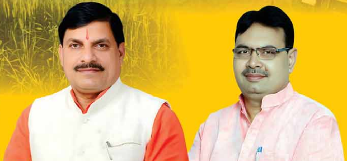
भजनलाल शर्मा, मुख्यमंत्री, राजस्थान

- डॉ. मोहन यादव, मुख्यमंत्री, मध्यप्रदेश