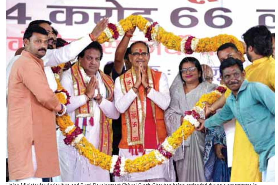
Union Minister for Agriculture and Rural Development Shivraj Singh Chouhan being garlanded during a programme in Mandideep, district Raisen at his Lok Sabha constituency, Madhya Pradesh on Saturday.