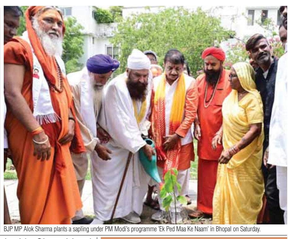
BJP MP Alok Sharma plants a sapling under PM Modi's programme 'Ek Ped Maa Ke Naam' in Bhopal on Saturday.

The Chief Minister highlighted that Ayushman cardholders needing treatment in another city will now have access to a free air ambulance service, complete with a doctor, nurse, and advanced medical equipment. Additionally, those without Ayushman cards can avail of this service at concessional rates. He further mentioned that air taxi services have been initiated in cities like Jabalpur, Gwalior, and Rewa, and will soon expand to smaller cities with airstrip facilities. Dr. Yadav also stated that Regional Industry Conclave will be held in Jabalpur on July 20, which is expected to boost regional development and create employment opportunities. Furthermore, the Religious Endowments Department will identify and develop religious sites associated with Lord Ram and Krishna into pilgrimage destinations.