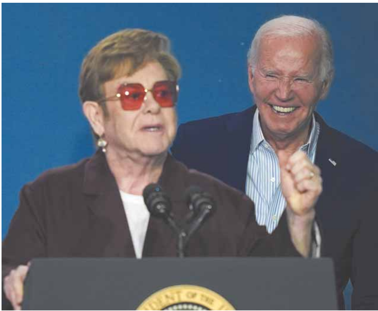
Elton John speaks as President Joe Biden listens at the grand opening ceremony for the Stonewall National Monument Visitor Center in New York.

tion — a scenario fraught with its own problems for the Democratic Party. However, it does mean that the president has to reassure Americans who might now have doubts about his fitness for another term.