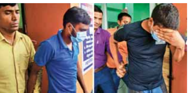
In this combo photo, men arrested in the NEET-UG paper leak case being taken to custody following their medical check-up at LNJP hospital, in Patna PTI

BUMRAH 1000 TIMES BETTER THAN ME: KAPIL DEV 12 SPORTS