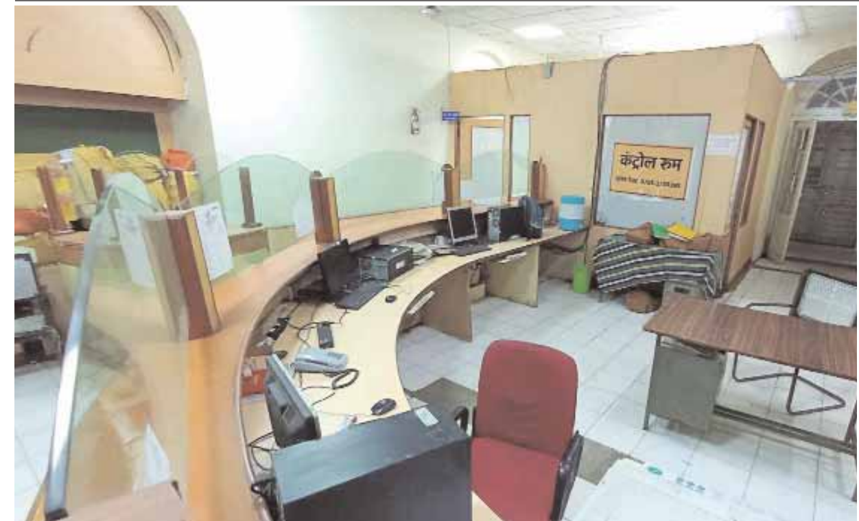
A deserted view of collector office at 10:30 AM as employees unable to reach the office despite the Government order of the office timing from 10 Am to 6 Pm in Bhopal on Thursday.