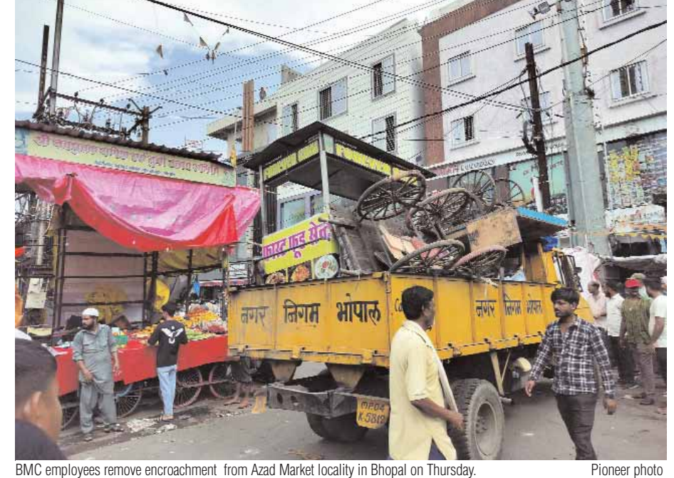
BMC employees remove encroachment from Azad Market locality in Bhopal on Thursday.