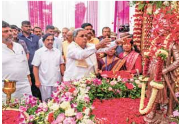
Karnataka Chief Minister Siddaramaiah pays floral tribute during the 515th birth anniversary celebration of Bengaluru's founder Nadaprabhu Kempegowda, at Kanteerava Stadium, in Bengaluru