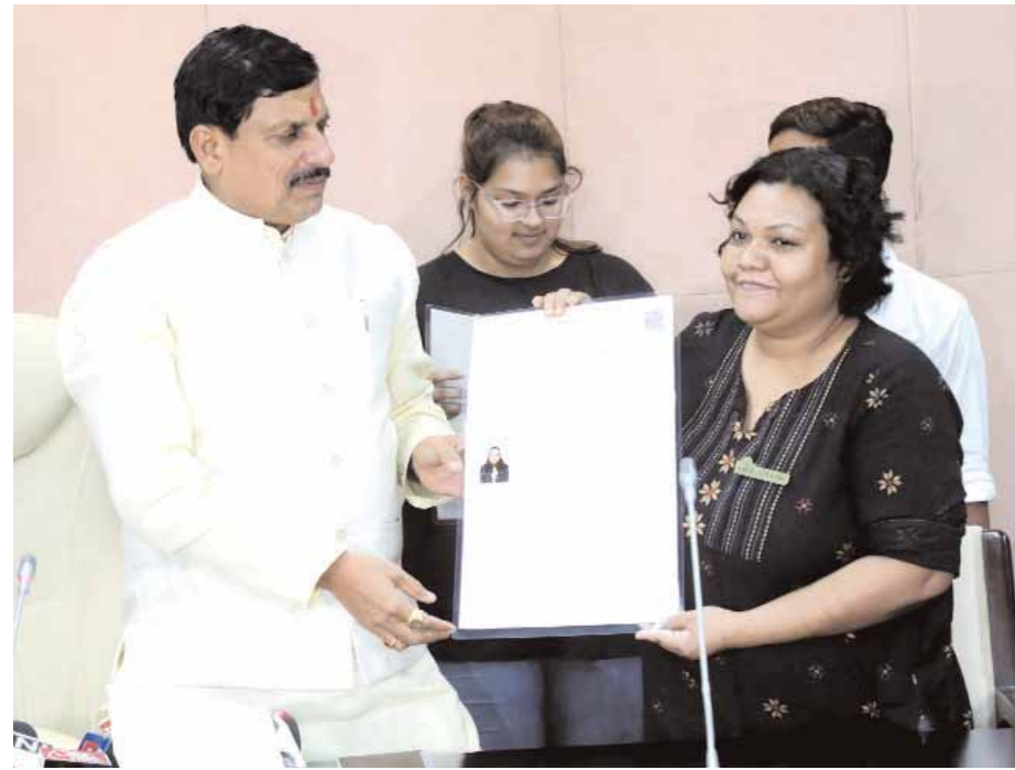
Madhya Pradesh Chief Minister Mohan Yadav gives citizenship certificates to the first three applicants of the State under the Citizenship Amendment Act, at his residence in Bhopal on Thursday.

time in Madhya Pradesh. Section 6B has been added to the Citizenship Act 1955 to provide citizenship under the Citizenship Amendment Act, 2019 (CAA). To be granted citizenship under CAA, the migrant must belong to any one of the communities out of the Hindu, Sikh, Buddhist, Jain, Parsi, and Christian communities, the migrant must have entered India on or before December 31, 2014. Applications under CAA are filed online on the website https://indiancitizenshiponline.nic.in/ or through the mobile application, CAA-2019.