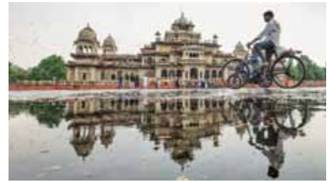
Albert Hall Museum is reflected in the puddle after rain in Jaipur

Rainfall is likely to intensify over the plains of Northwest India with heavy to very heavy rain likely to lash various regions including the national capital, Punjab and parts of Rajasthan from between June 28 and June 30 June, according to the India Meteorological Department (IMD). This forecast comes as a welcome development promising relief from a rather long spell of intense heat that posed health risks to the people of all ages. The IMD announcement on Thursday said that heatwave conditions across the country have subsided. Regionwise, the MET has forecast, fairly widespread to widespread light to moderate rainfall accompanied with thunderstorm and lightning very likely over Konkan and Goa, Madhya Maharashtra, Karnataka, Kerala &