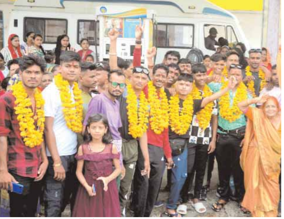
Devotees under the banner of Yuva Sewa Samiti before they leave for Kedarnath shrine for a pilgrimage in Bhopal on Thursday.

said that the empowerment of women is a continuous process. Suggestions will be taken for policy formulation and a draft will be prepared. Gazette notification will also be issued after approval. Besides, the policy points will also be continuously monitored and reviewed.