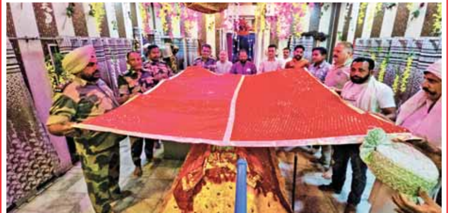
BSF personnel, along with villagers, offer 'chadar' at Baba Chamliyal shrine after the annual Indo-Pak fair organised on the two sides of the International Border (IB), in Samba district, on Thursday