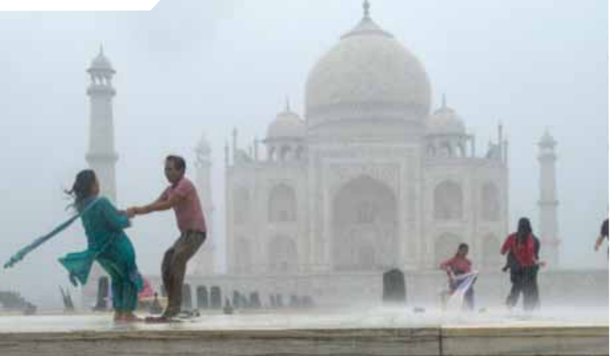
Tourists enjoy during rains, at the Taj Mahal, in Agra