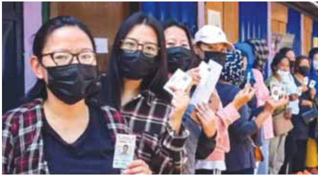
Voters exercise their franchise in the Nagaland civic polls