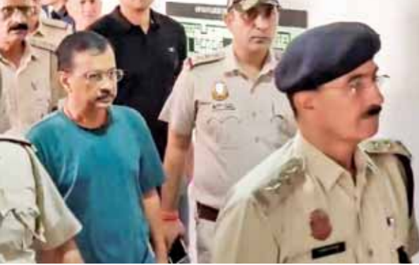
Delhi Chief Minister and AAP leader Arvind Kejriwal being produced before the Rouse Avenue Court in connection with a money laundering case related to the Delhi liquor policy, in New Delhi, on Wednesday