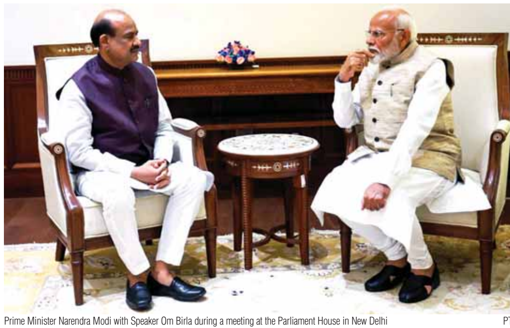
Prime Minister Narendra Modi with Speaker Om Birla during a meeting at the Parliament House in New Delhi

resolution condemning the imposition of Emergency and termed the decision by then prime minister Indira Gandhi an attack on the Constitution, triggering a wave of protests by the opposition in the House. Birla's reference to the Emergency, shortly after his election as Lok Sabha speaker, also saw a face-off between the government and the opposition in the first session of the lower house. "This House strongly condemns the decision to impose Emergency in 1975. We appreciate the determination of all those people who opposed the Emergency, fought and fulfilled the responsibility of protecting India's democracy," Birla said amid vociferous protests by opposition parties. Opposition MPs, including from the Congress, were on their feet, raising slogans against the reference to the Emergency. "June 25, 1975 will always be known as a black chapter in the history of India. On this day, then prime minister Indira Gandhi imposed Emergency in the country and attacked the Constitution made by Babasaheb Ambedkar," the speaker said. Birla said India was known all over the world as the mother of democracy. "Democratic values and debate have always been supported in India. Democratic values have always been protected, they have always been encouraged.