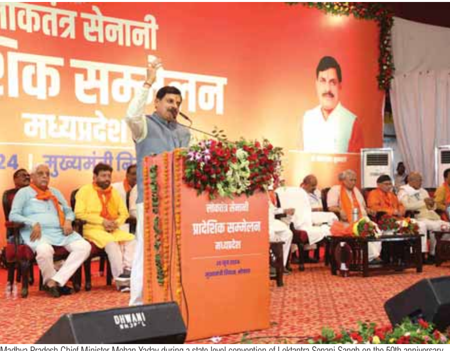
Madhya Pradesh Chief Minister Mohan Yadav during a state level convention of Loktantra Senani Sangh on the 50th anniversary of Emergency at CM's residence in Bhopal on Wednesday.

President of India, the world's largest democracy. The Chief Minister said that Lok Sabha Speaker Om Birla, in his first speech, remembered the struggle of the Loktantra Senanis and saluted them. He said that the smooth functioning of the democratic system in the country has been possible due to their efforts.