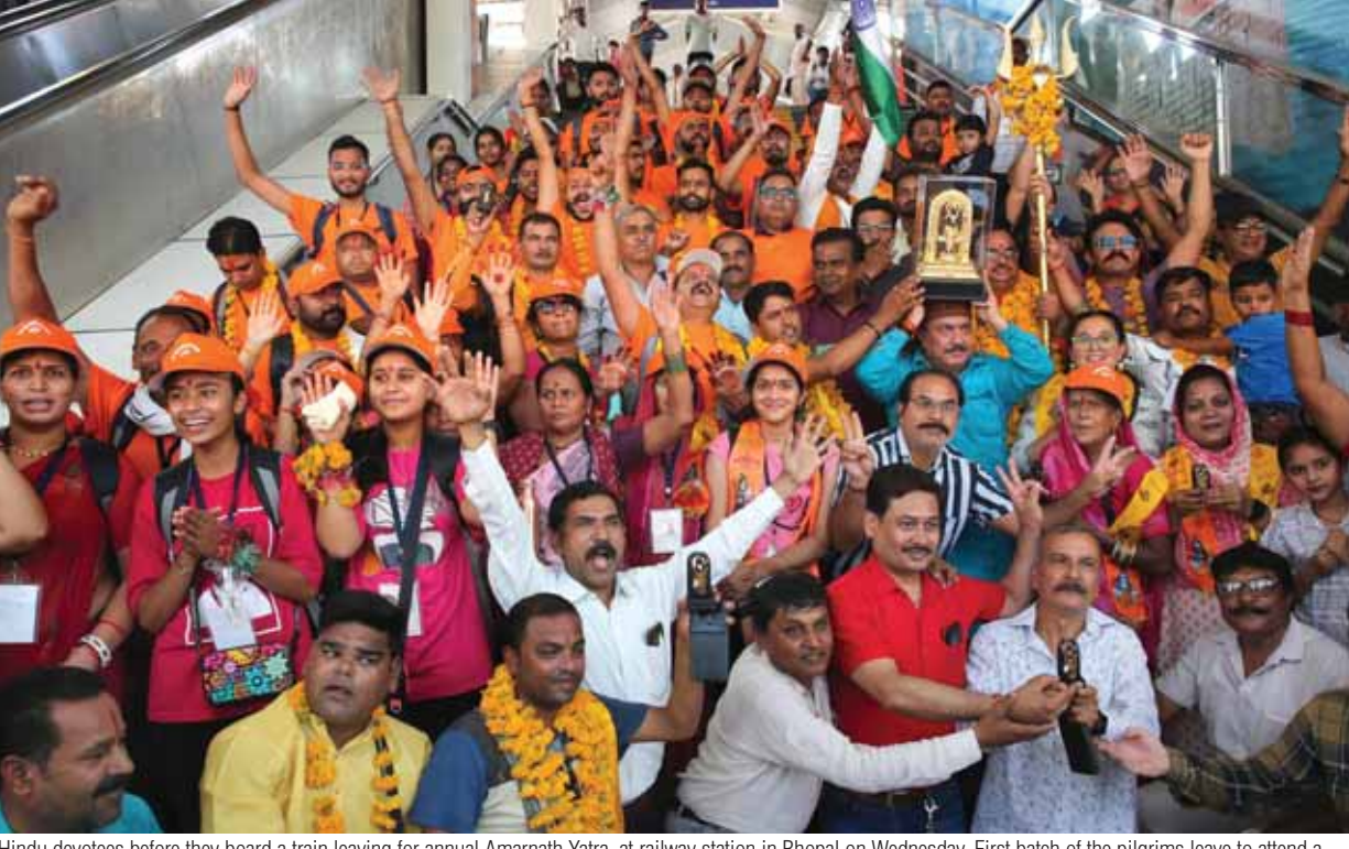
Hindu devotees before they board a train leaving for annual Amarnath Yatra, at railway station in Bhopal on Wednesday. First batch of the pilgrims leave to attend a 52 day annual pilgrimage to the cave shrine in South Kashmir set to start on June 29 and conclude on Aug 19.

Pamphlets and leaflets, Pasting of stickers, Programmes at various prominent public places i.e. Railway stations, Bus stands, Airports, Zoo Park, Rajwada Area etc. Nukkad Natika.