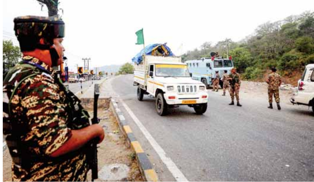
Security personnel stand guard as vehicles leave the Amarnath yatra base camp Bhagwati Nagar during a 'dry run' conducted by the authorities ahead of annual Amarnath Yatra, in Jammu, on Wednesday