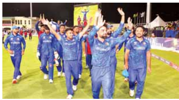
After scripting history on Tuesday by storming into the semi-finals of T20 World Cup, Afghanistan players celebrate

Sachin Tendulkar, Virender Sehwag, former Australia all-rounder Tom Moody, almost all Indian Premier League (IPL) teams and former India cricketers Yuvraj Singh,