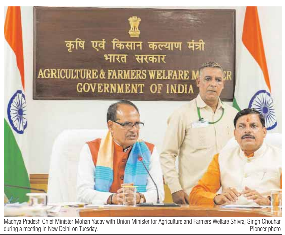
Madhya Pradesh Chief Minister Mohan Yadav with Union Minister for Agriculture and Farmers Welfare Shivraj Singh Chouhan during a meeting in New Delhi on Tuesday.

fight for the truth. From Mahatma Gandhi and Lala Lajpat Rai to Vinoba Bhave and Anna Hazare, Satyagrahis fasted to reveal the truth, not to hide their administrative failures, as Atishi intended to do," he said. Atishi had begun her hunger strike on June 21. AAP Rajya Sabha MP Sanjay Singh said the minister ended her indefinite fast after she was hospitalised. At a press conference, Singh said Atishi's health deteriorated after being on fast for nearly five days and she was admitted to the LNJP Hospital around 3.45 am. The AAP leader said all MPs of the party will write to Prime Minister Narendra Modi to provide Delhi with its rightful share of water from Haryana. The issue will also be raised by AAP and its political allies in Parliament, he added.