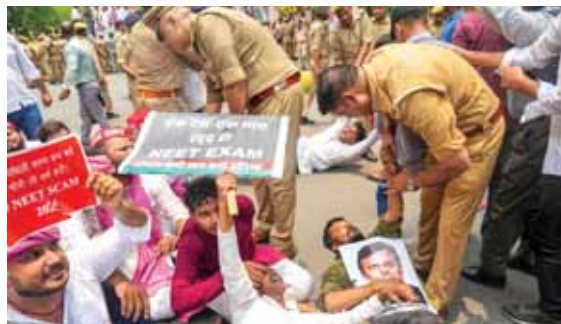
Police personnel detain Samajwadi Party workers protesting over the alleged irregularities in NEET 2024 results, near party chief Akhilesh Yadav's residence, in Lucknow, on Tuesday

According to sources present in the meeting, the committee took stock of the current situation and