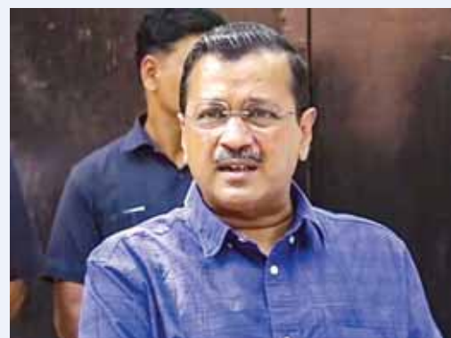
Delhi Chief Minister Arvind Kejriwal File photo

"The Vacation Judge while passing the Impugned Order did not appropriately appreciate the material/documents submitted on record and pleas taken by ED and