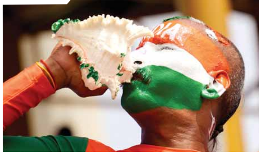
An Indian cricket fan blows into a shell horn prior to the ICC Men's T20 World Cup cricket match