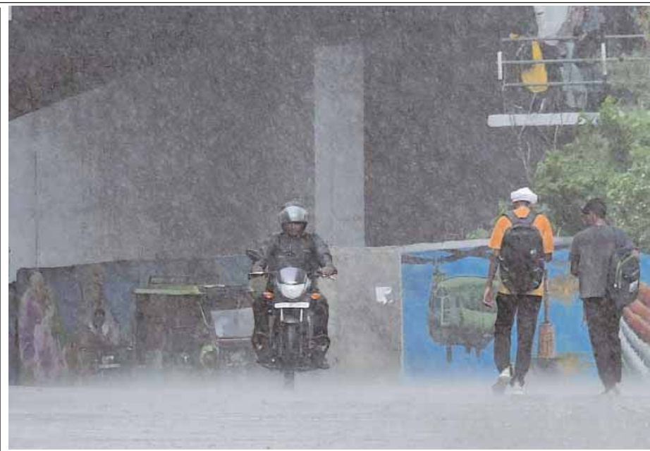
Commuters move on the road amid rain in Bhopal on Tuesday.

on social media two days ago with a false claim of leak of the 'General Studies' subject paper. "We compared the suspicious question paper with the original one of the subject for the preliminary round of the state service exam held on Sunday and found it to be fake," he said. Nearly 1.83 lakh candidates were eligible to appear in the preliminary round of the examination held on Sunday across 55 district headquarters in the state, as per officials. The examination was conducted for 110 posts, including 15 posts of deputy collector and 22 of deputy superintendent of police, they said.