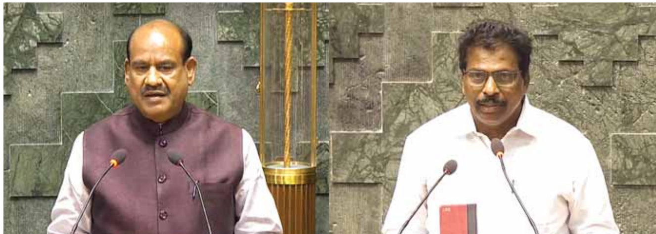
BJP MP Om Birla takes oath as a member of the House during the first session of the 18th Lok Sabha, in New Delhi, on Tuesday. Congress MP Kodikunnil Suresh (R) takes oath as a member of the House on Monday

"I appeal again that they should think about keeping in mind the dignity of the post of Speaker. We have the numbers but still, we are requesting that there should be no election for the post of Speaker because this post does not belong to any party," the