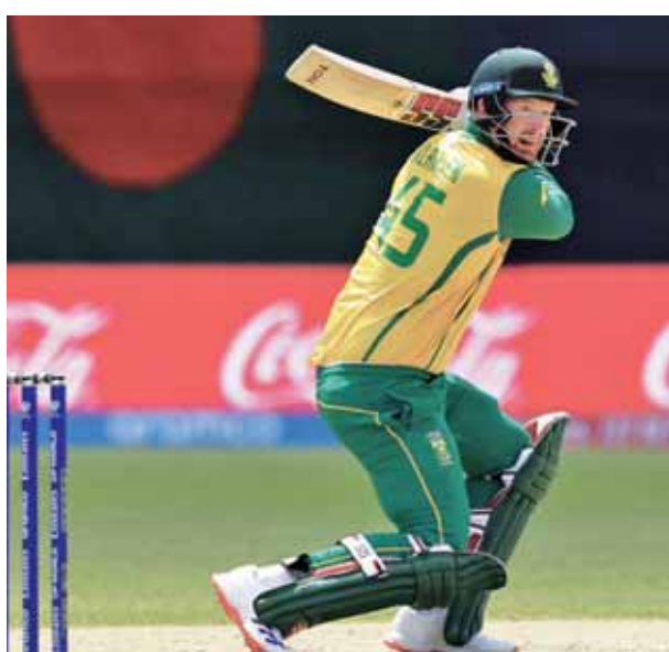
he said before elaborately explaining his take. "I played in Dallas and in North Carolina where I think there's a little bit more cricket there. The wickets (pitches) are better so it's easier to sell cricket in that aspect," he said.

"I think all the batters are keen to get out of this place, to be fair. The bowlers would love to stay here but - no we've done our job that was the goal to win three out of three here. Obviously, it was a little bit harder than what we thought," he said.