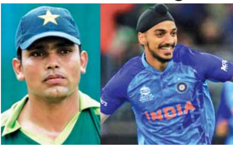
wrote on X, tagging Harbhajan. Akmal's remarks came during the tense penultimate over of the clash, when Pakistan needed 17 runs in the last over in their chase of 120.

PTI ■ LAHORE A day after being called out for making disrespectful comments against India pacer Arshdeep Singh, former Pakistan wicketkeeper-batter Kamran Akmal apologised for his "inappropriate" remarks while analysing the recent T20 World Cup clash between the two sides in New York.