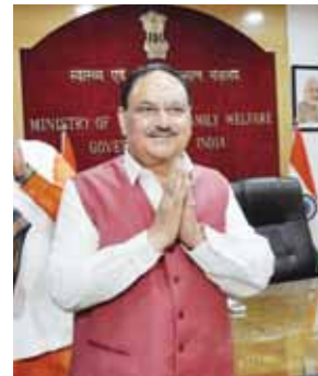
Union Health Minister JP Nadda

After that several names are doing the rounds which include the party's general