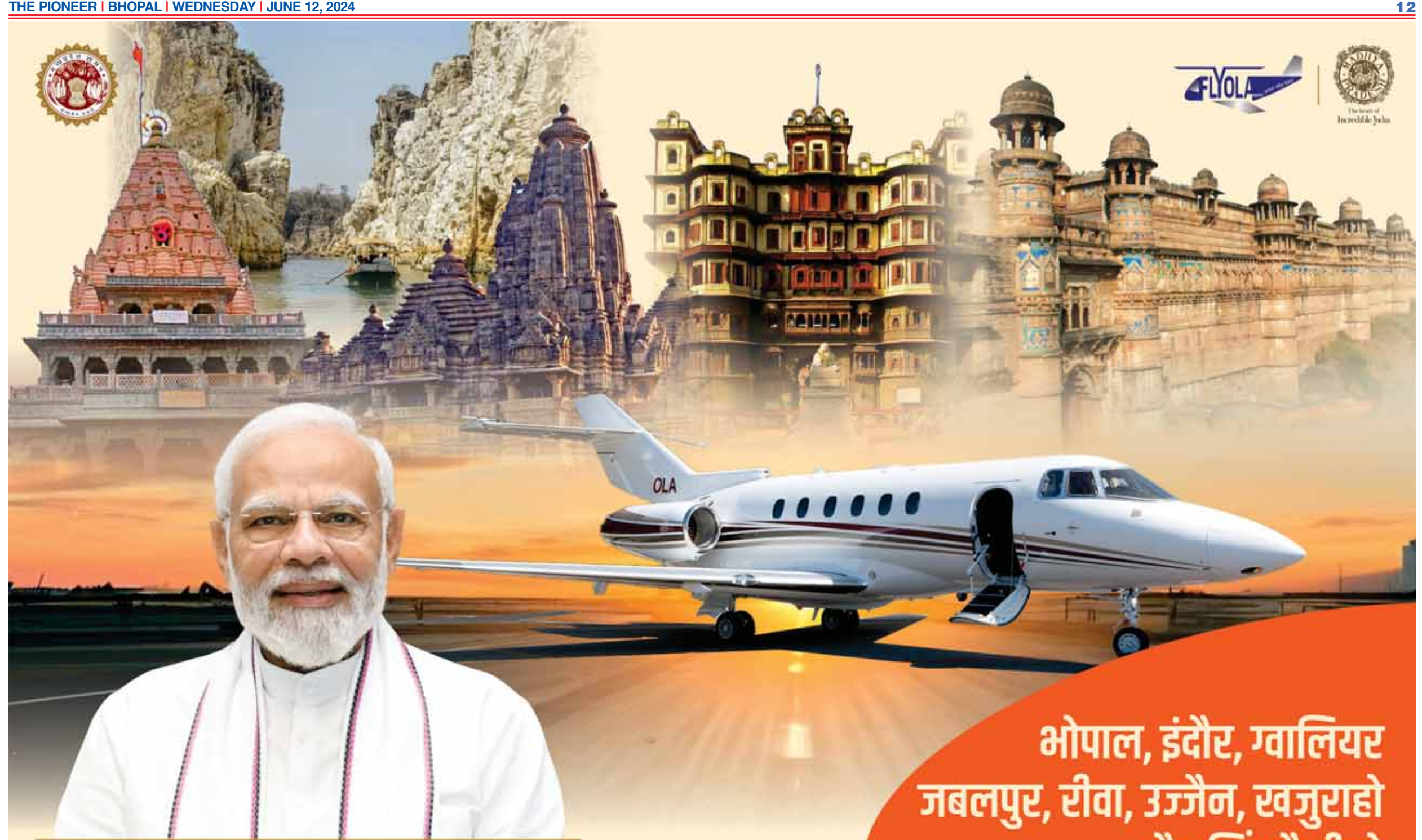
नरेन्द्र मोदी, प्रधानमंत्री

भोपाल, इंदौर, ग्वालियर जबलपुर, रीवा, उज्जैन, खजुराहो और सिंगरौली से अंतरराज्यीय उड़ान