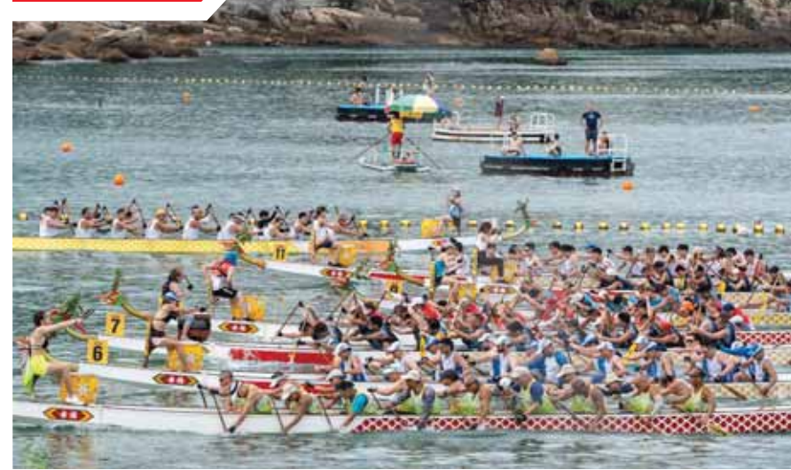
Competitors at the annual dragon boat race in Hong Kong