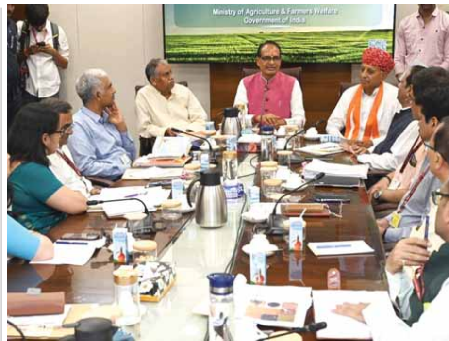
Union Minister for Agriculture and Farmers Welfare Shri Rajendra Singh Chouhan holds a meeting with the officials after taking charge in New Delhi on Tuesday.

lakh for the patient/victim and accident insurance of Rs 25 lakh for third party and accident insurance of Rs 25 lakh for third party damage is provided by the service provider. In case of paid service, the service providing agency will have to pay Rs 1,94,500 per hour (flying hour) for helicopter and Rs. 1,78,900 per hour (flying hour) for fixed wing converted flying ambulance. Nodal officer for the facility of air ambulance service In case of accident/disaster, the District Collector will be able to give approval within the division on the recommendation of the Chief Medical and Health Officer of the district for free transportation of the victim within the division and approval for going outside the division will be given by the Health Commissioner.