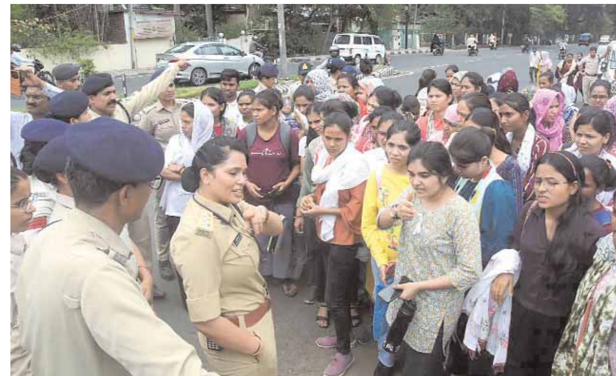
Police personnel stop General Nursing and Midwifery students as they march to protest demanding posting in Government jobs, at CM residence in Bhopal on Tuesday.

result. After the orders of the court, the institute declared the result, after which they got their mark sheet printed. Now these students are constantly struggling for their jobs and are getting pushed around the officials. The students said that they have made thousands of rounds of DHS (District Health Society) Bhopal, but no responsible officer is there to listen to their problem. For one and a half years, these students have become upset sitting at home. These students have now written a letter to the President and sought permission for euthanasia. They said that they do not understand whom they should go to now for their job and whom they should tell their mistake.