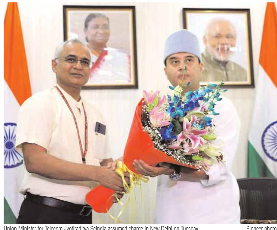
Union Minister for Telecom Jyotiraditya Scindia assumed charge in New Delhi on Tuesday.

40.5 degrees, Khargone was 40.4 degrees and Narmadapuram was 40.2 degrees. Bhopal was 39.3 degrees, Indore was 35.8 degrees, Gwalior was 38.2 degrees, Jabalpur was 39.4 degrees and Ujjain was 36 degrees. The Met has issued warning of heat waves in Singrauli and Sidhi while hail storm, thunder showers and gusty winds in Burhanpur, Khandwa, Khargone, Barwani, Alirajpur, Jhabua, Dewas, Shajapur, Jabalpur, Narsinghpur, Chhindwara, Pandhurna, Seoni, Mandla, Balaghat, Rajgarh, Narmadapuram, Betul, Harda, Neemuch, Guna, Ashoknagar, Shivpuri, Ampur, Shahdol, Umaraya, Dindori, Katni, Patna, Damoh, Sagar, Tikamgarh and Niwari.