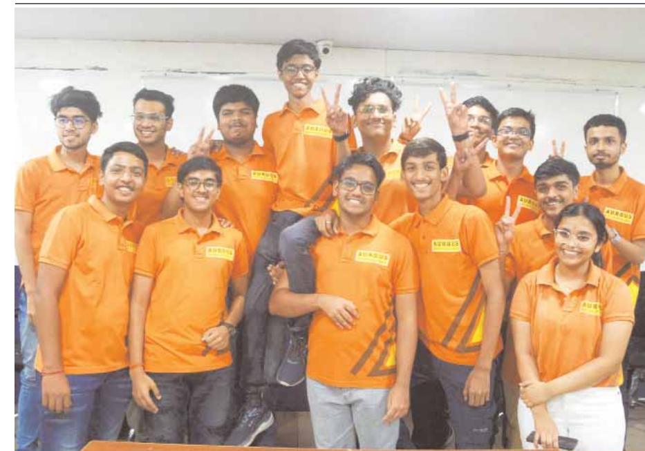
Students celebrate their victory after the results of JEE advanced were declared in Bhopal on Sunday.