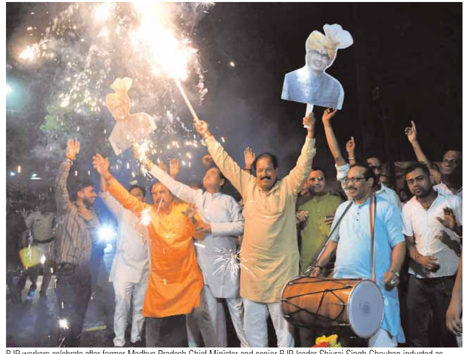
BJP workers celebrate after former Madhya Pradesh Chief Minister and senior BJP leader Shivraj Singh Chouhan inducted as Union Cabinet Minister, outside at his residence in Bhopal on Sunday.

Ujjain divisions and normal in all the remaining districts. The night temperature increased significantly in the districts of Ujjain division and there was no significant change in temperatures in all the remaining districts. They were below normal in the districts of Jabalpur division; they were above normal in the districts of Rewa, Sagar divisions; they were noticeably higher than normal in the districts of Shahdol division and normal in all the remaining districts. Dust storm occurred in Rampur Kalan, Neemuch, Mandasaur from yesterday till today morning; thunderstorms and strong winds occurred in Jhabua, Dhar, Indore, Alirajpur, Barwani, Khargone, Neemuch, Ratlam, Ujjain, Agar, Dewas, Sehore, Rajgarh, Guna, Betul, Chhindwara, Pandhuna, Seoni, Balaghat, Mandla, Dindori, Anuppur, Shahdol, Jabalpur, Damoh.