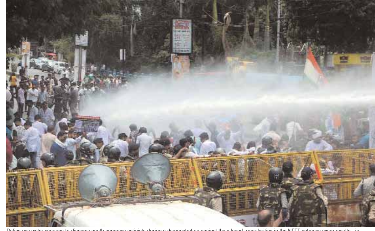
Police use water cannons to disperse youth congress activists during a demonstration against the alleged irregularities in the NEET entrance exam results, in Bhopal on Sunday.

ist in Masters of Philosophy from the Barkatullah University Bhopal. He also served as general secretary of the BJP and president of the party's MP unit. Chouhan was first elected to the MP assembly from Budhni constituency in 1990. He was elected as Member of Parliament for the first time from Vidisha constituency the following year. He was re-elected from the seat in 1996, 1998, 1999 and 2004. He won his fifth Lok Sabha election with an impressive margin of over 2,60,000 votes. In the run-up to the 2024 Lok Sabha polls, Chief Minister Mohan Yadav and Chouhan campaigned extensively for the BJP in the state where the party won all the 29 Lok Sabha seats, including Congress bastion Chhindwara, which the saffron party failed to win in 2019.