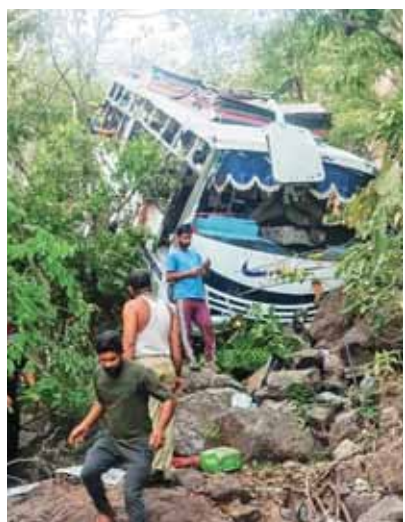
The damaged bus after it plunged into a gorge following an alleged attack by suspected terrorists, in Reasi district of Jammu and Kashmir