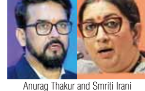
Anurag Thakur and Smriti Irani

Husbandry and Dairying in the Cabinet reshuffling of 2021, is likely to be dropped this time. During the election campaign, Rupala courted controversy by calling erstwhile 'maharajas' being subjects of the British and foreign rulers, angering the Kshatriya community. The omission of Union and Information Minister Anurag Thakur has surprised many as he was not among the leaders invited to meet Modi. The PM customarily