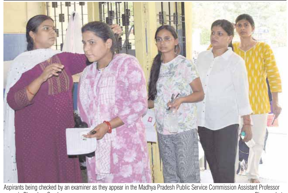
Aspirants being checked by an examiner as they appear in the Madhya Pradesh Public Service Commission Assistant Professor exam, in Bhopal on Sunday.