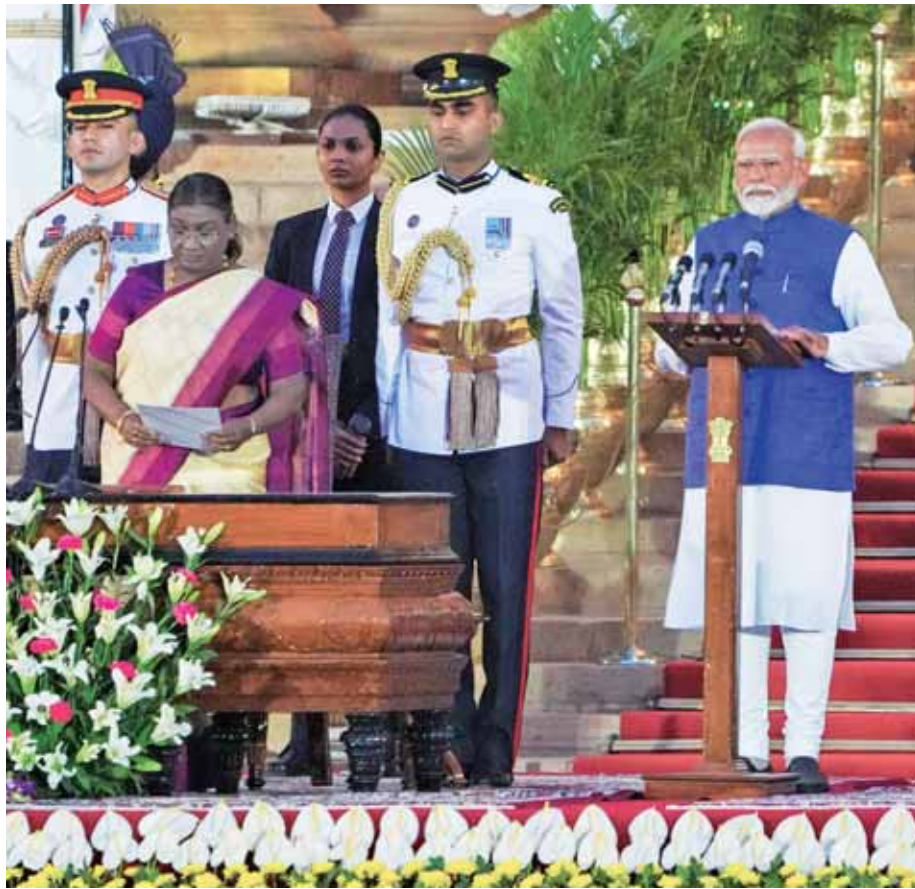
President Droupadi Murmu administers the oath of office to Narendra Modi as Prime Minister at Rashtrapati Bhavan in New Delhi on Sunday

Scripting a history, Prime Minister Narendra Modi on Sunday took over as Prime Minister for a third consecutive term becoming the first non-Congress leader and second after first Prime Minister Jawaharlal Nehru to don the mantle. With this Modi also becomes the only leader in the country to hold a constitutional post back to back for more than two decades which includes — three term as PM and prior serving 12 years as Chief Minister of Gujarat. President Draupadi Murmu administered Modi the oath of office and with this he also become the only PM to have been administered the oath by three presidents, including Pranab Mukherjee and Ramnath Kovind. Modi also under his regime was part of the consecration of Ram Temple in Ayodhya early this year and dedicated to the nation a new Parliament last year in September. If Modi completes his current five year term as PM leading the NDA regime he will have served a total of 27 years in office. He has been since leading his party to victory and power in 2002, 2007 and 2012 in Gujarat as CM and then in 2014 and 2019 at the Centre and again in 2024. It is though different this time as the BJP has lost majority on its own. Modi's third term which has