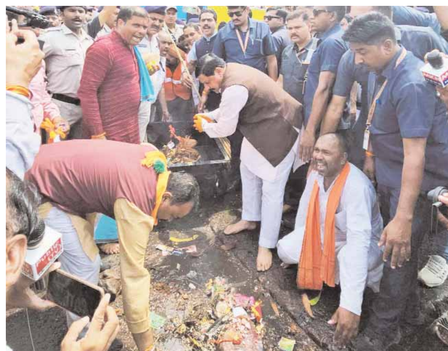
Madhya Pradesh Chief Minister Mohan Yadav participates in a cleanliness drive during 'Jal Ganga Samvardhan' campaign in Nemawar, Dewas district Madhya Pradesh on Sunday.

parts of the national capital no-flying zone for the swearing-in ceremony Sunday evening. The prohibitory orders will remain in force on June 9 and 10. More than 2,500 police personnel along with paramilitary staff have been deployed to maintain law and order. Modi is set to take oath on Sunday for a third straight term as the head of a coalition government after two full tenures in which the BJP enjoyed a majority on its own. The 73-year-old will be equalling the feat of first prime minister Jawaharlal Nehru, who won in 1952, 1957 and 1962 general elections. Leaders from India's neighbourhood and the Indian Ocean Region are among the dignitaries and special invitees expected to attend the swearing-in ceremony of the prime minister and his council of ministers at Rashtrapati Bhawan at 7.15 pm.