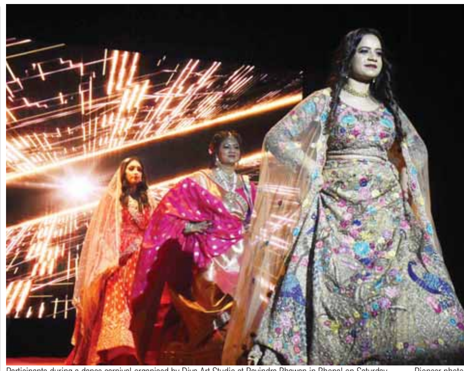
Participants during a dance carnival organised by Diya Art Studio at Ravindra Bhawan in Bhopal on Saturday.