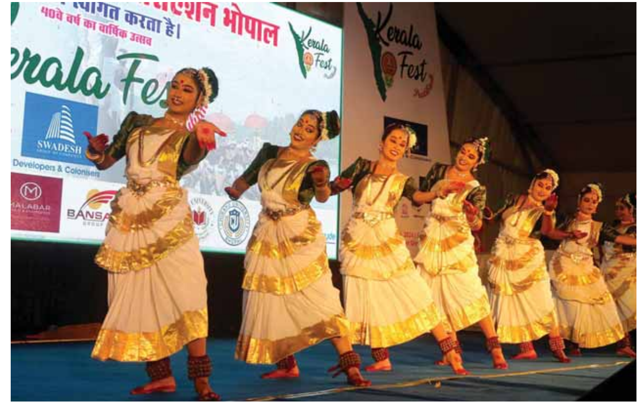
Artists perform during the three-day Kerala Festival organised by United Malayalee Association, in Bhopal on Saturday.