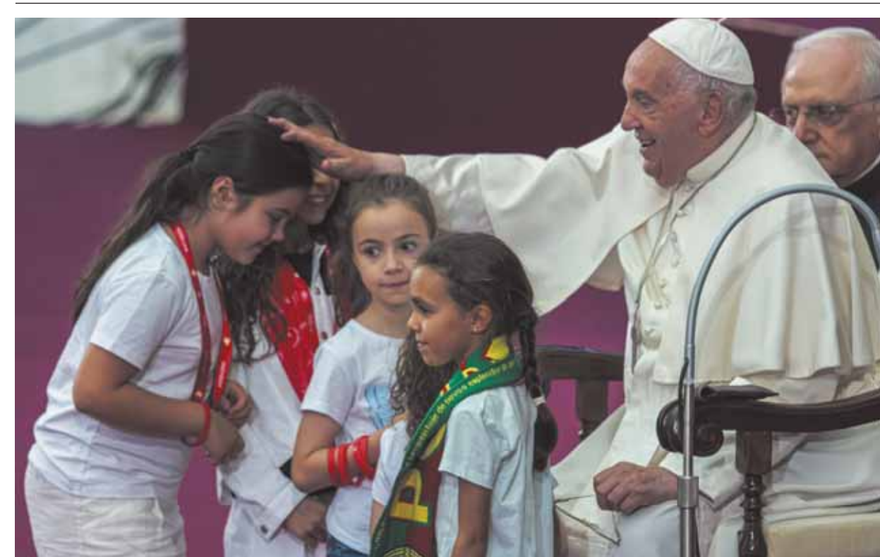
Pope Francis cheers at children during an audience with members of choirs from different countries in the Paul VI Hall at The Vatican on Saturday.