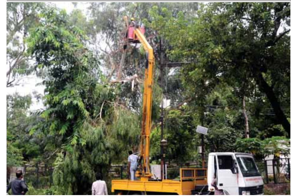
Madhya Pradesh Madhya Kshetra Vidyut Vitaran Co Ltd employees chopping branches of trees as they carry out maintenance work ahead of the monsoon season in Bhopal on Saturday.