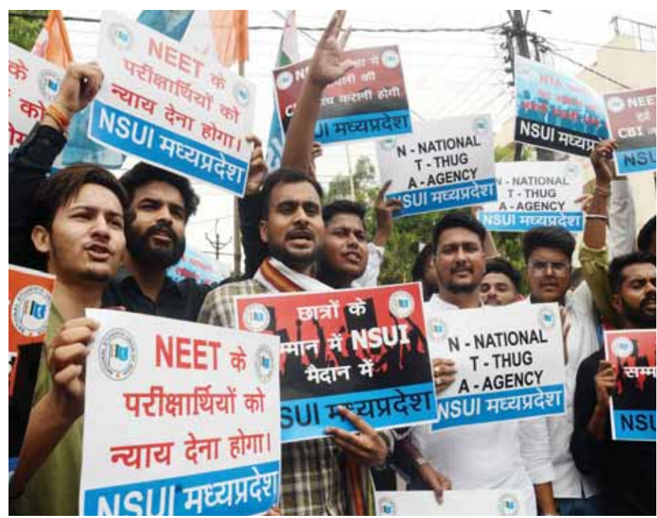
National Student Union of India (NSUI) activists stage a protest against National Testing Agency (NTA) over the alleged irregularities in the NEET entrance exam results, at PCC headquarters in Bhopal on Saturday.

dignitaries attending the swearing-in will be given designated routes from their hotels to the venue and back. Snipers and armed police personnel will remain deployed on the routes of the dignitaries and drones, while drones will be deployed at strategic locations in the national capital. As the event is scheduled to be held inside the Rashtrapati Bhavan, it will have a three-layered security both inside and outside the premises. Commandoes from Delhi Police's SWAT (Special Weapons And Tactics) and NSG will remain deployed around the President's house and various strategic locations on the event day. "Around 2500 police personnel, including five companies of paramilitary and Delhi Armed Police (DAP) jawans, have been planned to be deployed around the venue," an official said.