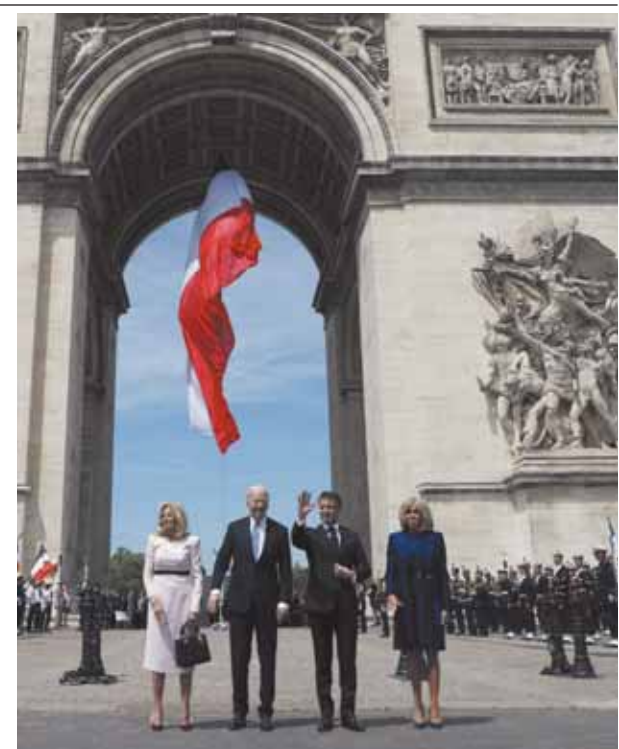
French President Emmanuel Macron, center right, stands with US President Joe Biden, First Lady Jill Biden and Brigitte Macron, right, during a ceremony at the Arc de Triomphe on Saturday in Paris. President Joe Biden is being feted by French President Emmanuel Macron with a state visit Saturday, as the two allies aim to show off their partnership on global security issues and move past trade tensions.