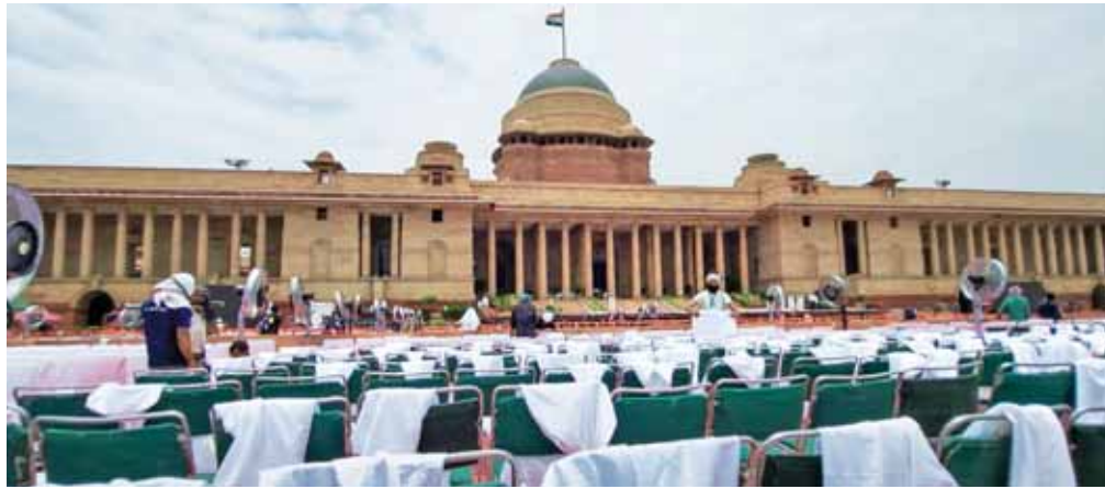
Preparations underway for the swearing-in-ceremony of the new Government, at the Rashtrapati Bhavan in New Delhi

Telangana BJP may get four Ministers and JD (United) three seats each. Three of the four TDP leaders who may find a place in PM Modi's new Cabinet are - Ram Mohan Naidu, Harish Balayogi and Daggumala Prasad. JD (U) has proposed the name of two senior leaders - Lalan Singh and Ram Nath Thakur. Lalan Singh was elected to the Lok Sabha from Bihar's Munger, while Ram Nath Thakur is a Rajya Sabha MP. Thakur is the son of Bharat Ratna recipient Karpoori Thakur. The JD (U) and TDP both are interested in funds for the