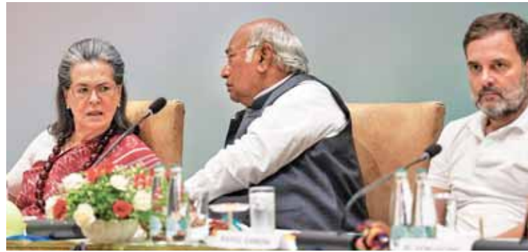
Congress President Mallikarjun Kharge with party leaders Sonia Gandhi and Rahul Gandhi during the extended Congress Working Committee meeting, in New Delhi

Sri Lankan President Ranil Wickremesinghe, his Maldivian counterpart Mohamed Muizzu, Bangladeshi Prime Minister Sheikh Hasina and Nepalese Prime Minister Pushpa Kamal Dahal "Prachanda" will attend the ceremony, according to the Ministry of External Affairs (MEA). Modi is expected to hold separate meetings with the visiting leaders, it was learnt.