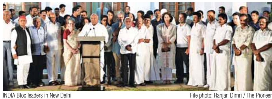
INDIA Bloc leaders in New Delhi

The row of barracks has been vacated and plans are also being made to demolish the compound wall separating the Parliament buildings from the Annexe. These offices have been shifted to the North Utility Block of the new Parliament building.