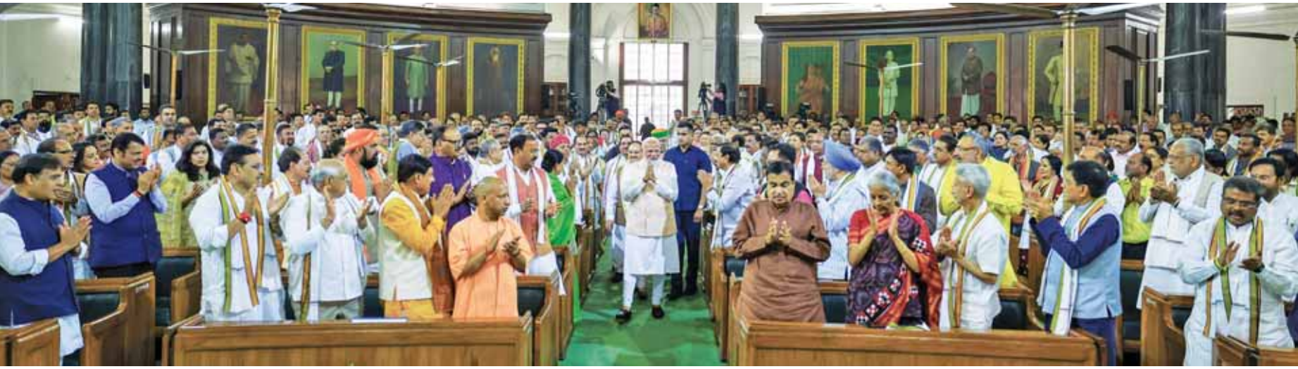
Prime Minister Narendra Modi arrives to attend the NDA Parliamentary Party meeting at Samvidhan Sadan, in New Delhi, on Friday

NEW INDIA, DEVELOPED INDIA, ASPIRATIONAL INDIA