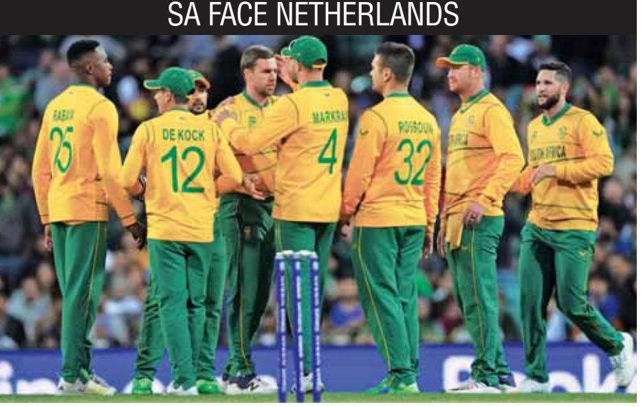
SA FACE NETHERLANDS

would certainly want a reversal this time around. The most encouraging signal from their win over Sri Lanka was the form of Anrich Nortje. The pacer, who was a shadow of his intimidating self in the IPL, seemed to have regained his rhythm on a spicy New York pitch while grabbing four wickets against the Islanders. Along with Kagiso Rabada,