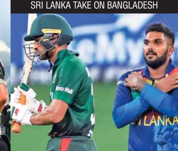
SRI LANKA TAKE ON BANGLADESH

On paper, New Zealand have all bases covered, they have depth in batting and variety in bowling. Trent Boult will look dominate with the new ball, with Lockie Ferguson and Tim Southee complementing him. Left-arm spinner Mitchell Santner has a phenomenal record in the Caribbean, averaging under 17 with the ball at an economy of 5.5 and he will be look to outsmart the Afghans. Meanwhile, Afghanistan secured a thumping victory over Uganda in their opener. If the opening duo of Rahmanullah Gurbaz and Ibrahim Zadran provided the team a great start with the bat, pacers Fazalhaq Farooqi, Naveen-ul-Haq, and skipper Rashid Khan exhibited exceptional prowess with the ball. But apart form Gurbaz and Zadran none of the other batters manage to stick around and against a formidable Kiwi side, they will need to do better. TEAMS (FROM): New Zealand: Kane Williamson (c), Finn Allen, Trent Boult, Michael Bracewell, Mark Chapman, Devon Conway, Lockie Ferguson, Matt Henry, Daryl Mitchell, Jimmy Neesham, Glenn Phillips, Rachin