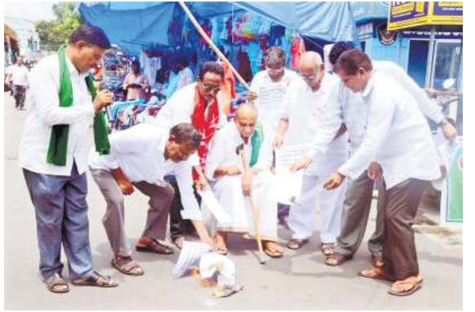
Andhra Pradesh Rythu Sanghala Samanvaya Samithi leaders burning copies of the budget at the Dharna Chowk in Vijayawada on Sunday

These funds have been sanctioned under the Upadhi scheme, he added.