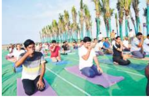
Minister for Mines & Geology and Excise Kollu Ravindra, Krishna District Collector DK Balaji and Joint Collector Geethanjali Sharma performing yoga asanas on the Manginapudi Beach on Sunday

announced that he will soon constitute a Beach Development Committee comprising some of the prominent political leaders. Also, he said several multinational companies (MNCs) are coming forward to set up beach resorts in Manginapudi. Furthermore, he said efforts are underway to boost temple tourism in Manginapudi Beach. The Minister added that MP Vallabhaneni Balashoury is striving for the development of Manginapudi Beach. A 'Beach Festival' was organised during the TDP regime from 2014 to 19. Boat riding and cultural programmes were organised grandly. Today, 6,000 to 7,000