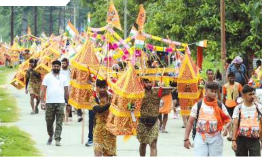
'Kanwariyas' carry Ganga water during their pilgrimage in the holy month of 'Shravan', in Haridwar