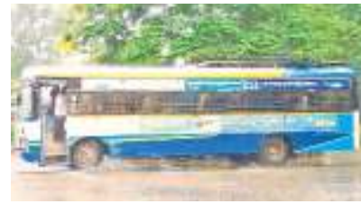
The situation has been particularly dire in the Agency areas where roads were inundated and obstructed by fallen trees.

Before the cyclone's onset, APSRTC enjoyed a comfortable 70 per cent occupancy rate during the first 18 days of the month. However, these figures plummeted to 52 per cent between Friday and Tuesday, illustrating the storm's significant impact. This drop in occupancy translates to a substantial daily revenue loss of Rs. 20 lakh, with the average daily income dipping from Rs. 98 lakh to Rs. 78 lakh. The situation has been particularly dire in the Agency areas where roads were inundated and obstructed by fallen trees. Some regions witnessed a complete standstill in bus services, especially