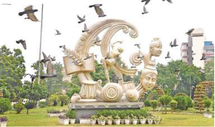
Pigeons fly past the new sculpture 'Natyashastra' installed at Mandi House, New Delhi