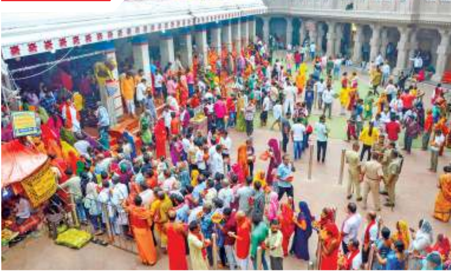
Devotees wait in queues to offer prayers at Vindhyavasini Temple on the occasion of Guru Purnima, in Mirzapur