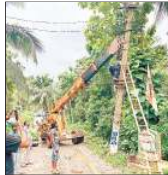
Power restoration works going on in APEPDCIL in the rain affected areas.