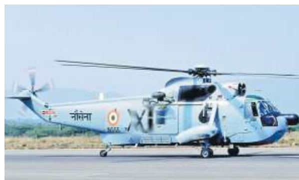
The UH-3H helicopter, with its storied 17-year career in the Indian Navy, has a rich history of contributing to special operations, investigations, disaster relief, and critical support

It will feature a retired Indian Navy UH-3H helicopter