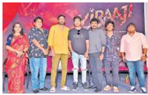
Viraaji , Varun Sandesh teased, "This role is unlike any I've played before. It required extensive preparation, and I can confidently say it's one of my craziest yet. The first look at the film, set to be unveiled on the July 10, will give audiences a glimpse into this exciting journey."