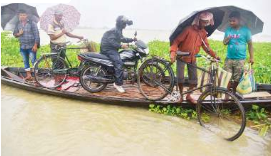
Villagers use a boat to travel across a flood affected area after heavy rainfall, in Morigaon district