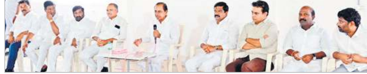
BRS chief K Chandrasekhar Rao addressing ZP chairpersons in his farmhouse at Erravelli on Tuesday

• Asserts confident KCR, recalls 10 years of BRS's good governance