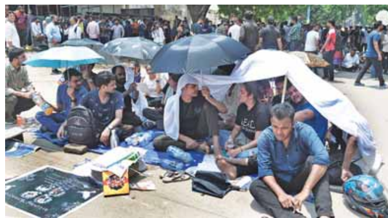
Students stage a protest after three civil services aspirants died due to drowning at a coaching centre in Old Rajinder Nagar area, in New Delhi on Tuesday

"The opening in the shape of the manhole over the drainage system has also been covered with finishing items, thus leaving no scope for cleaning of the drains. They have covered the existing, built up section