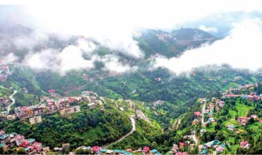
Clouds hover over the hill town of Shimla