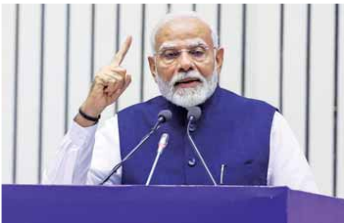
Prime Minister Narendra Modi speaks during CII post-Budget conference in New Delhi

India is growing at 8 per cent and the day is not far when the country will become the third-largest