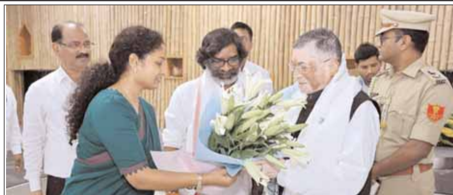
Chief Minister Hemant Soren and his wife and MLA Kalpana Soren greet Governor designate Santosh Gangwar upon his arrival in Ranchi on Tuesday.