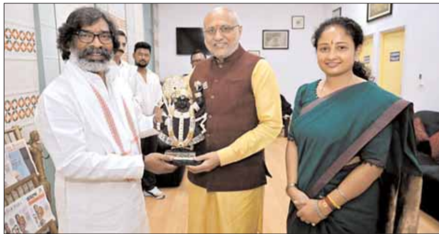
outgoing Governor 3: Chief Minister Hemant Soren and his wife and MLA Kalpana Soren greet outgoing Governor CP Radhakrishnan at Raj bhavan in Ranchi on Tuesday.