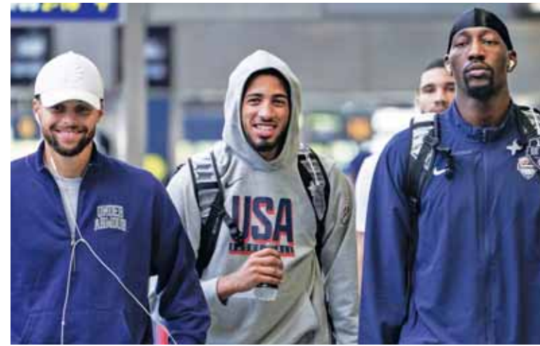
still figuring out how best to utilize its talent. "We're still trying to build identity around who we are with this 12-man group," Curry said. "It's important to stay focused on not just getting a win, but how we do it." Coach Steve Kerr said aside from it being almost impossible to give sufficient minutes to 12 players in a 40-

The question was apt, but at the same time a little flabbergasting for Stephen Curry to ponder. Could he envision a scenario in which Kevin Durant, who shined in the U.S. men's basketball team's Olympic-opening victory over Serbia, might continue to come off the bench? "We're talking about Kevin Durant as a sixth man," Curry replied. "That tells you how good this team can be." Highlights were plentiful for the U.S. in the Serbia win. LeBron James awed with his signature one-handed dunks and celebratory flexes. Durant had a nearly perfect shooting night in his first official basketball game in two months because of a calf strain. And everybody - who played that is - scored. That's because just as eye-popping was that Jayson Tatum - the newly minted highest-paid player in the NBA - and Tyrese Haliburton, who recently signed franchise record contract himself, didn't see the court. It illustrates the embarrassment of riches that exists for a team that says it's