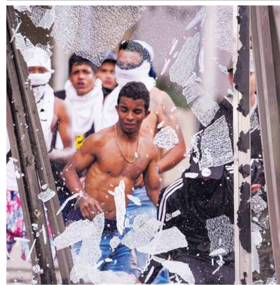
Protesters smash an advertising board during demonstrations against the official election results declaring President Nicolas Maduro's reelection, the day after the vote in Caracas, Venezuela on Monday.

a dance class," she wrote on Instagram. "I am at a complete loss for how to ever convey my sympathies to these families." A 17-year-old boy was arrested on suspicion of murder and attempted murder. Local people left flowers and stuffed animals in tribute at a police cordon on the street lined with brick houses in the seaside resort near Liverpool – nicknamed "sunny Southport" – whose beach and pier attract vacationers from across northwest England. Witnesses described scenes "from a horror movie" as bloodied children ran from the attack just before noon on Monday.