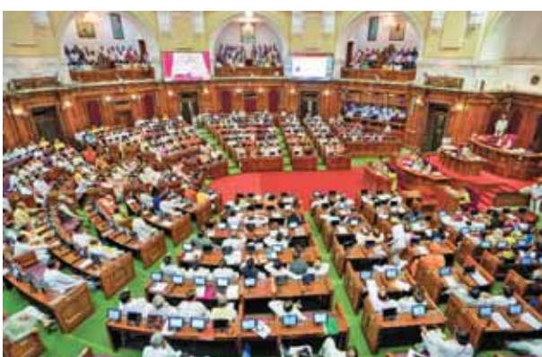
Uttar Pradesh Finance Minister Suresh Khanna presents a supplementary Budget in the presence of Chief Minister Yogi Adityanath and other members during the Monsoon Session of State Legislative Assembly at Vidhan Bhawan, in Lucknow, on Tuesday

According to the new provisions, if any minor,