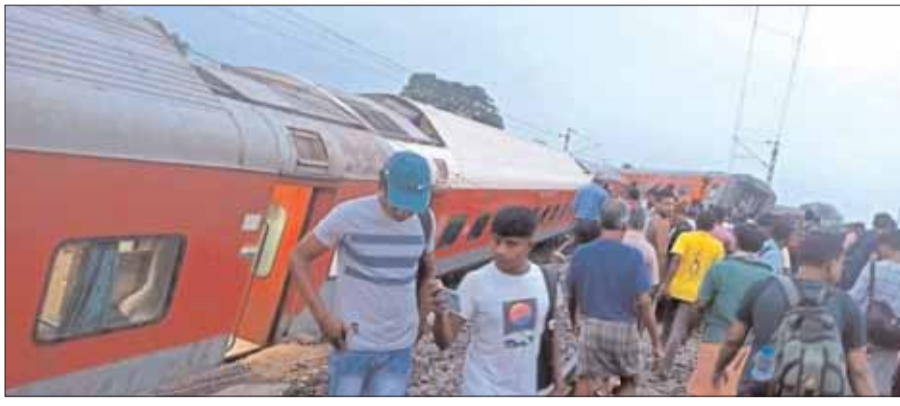
Howrah Mumbai train derailed in which two passengers died and over 20 passengers were injured and relief operation is going on at Potobera village near Kharsawan under Saraikela district on Tuesday.

Railway authorities have launched an investigation to determine the exact cause of the accident. Preliminary reports suggest that the stationary goods train may have