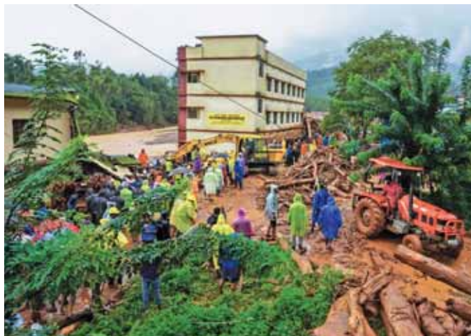
Rescue operation underway following landslides triggered by heavy rain at Chooralmala, in Wayanad district, Kerala, on Tuesday

Indian Air Force have deployed two choppers from its Sulur base