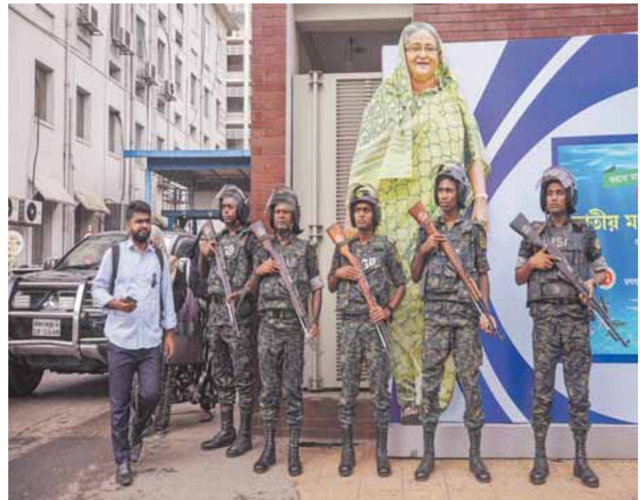
Military personnel stand guard in front of a large cutout portrait of Prime Minister Sheikh Hasina during the national mourning day, declared by the Bangladesh government to remember victims of the recent countrywide deadly clashes, in Dhaka, Bangladesh, on Tuesday, July 30

Prime Minister Sheikh Hasina's ruling Awami League's (AL) general secretary Obaidul Quader, meanwhile, said the government would thoroughly examine legal aspects before banning Jamaat-Shibir to block any possible legal loophole, which could be exploited by "this extremist group" to engage in politics in Bangladesh. For the sake of the country, the 14-party alliance has decided to ban Jamaat-Shibir to eliminate anti-national evil forces, Quader said. Quader, also the Road Transport Minister, said that Jamaat and BNP used students as "shields" during the movement while "the government is aware of the sources of their instructions, incitements, and funding." Violence gripped Bangladesh for almost the entire of July when the protests that had started in universities and colleges earlier this month, quickly turned into a widespread agitation against Prime Minister Sheikh Hasina and her government's policies. The government called in the army to quell protests against job quotas after the unrest left at least 150 dead and several thousand people, including policemen, wounded and major government installations damaged. Meanwhile, the ruling Prime Minister Sheikh Hasina's Awami League-led 14-party alliance leaders held a meeting with Hasina in the chair and