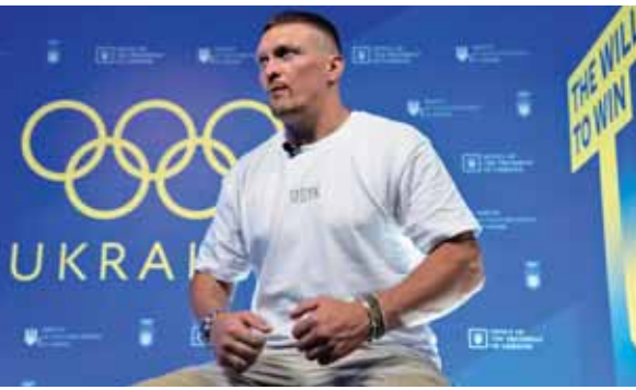
daily missile strikes, damaged sports infrastructure, and Russian occupation of regions that were home to many athletes. "We are at war. But our athletes still came," he said. "They are fighting." On both of his arms, he has tattoos of the Olympic rings. One of them is labeled "London 2012" where he won the gold medal in the heavyweight category. "We support all our Olympians

Heavyweight boxing champion Oleksandr Usyk has come to Paris to support Ukrainian athletes at the Olympics amid war at home. On Monday, he visited the Ukrainian House in Paris and from there he watched the fencing competition in which Ukrainian Olga Kharlan won the bronze medal in women's individual saber, marking the first medal for Ukraine at the 2024 Olympics. "My personal wish was, and I probably knew, that Olga is one of those people who would bring a medal for Ukraine," Usyk told the Associated Press minutes after Ukrainian fencer won the medal. Usyk expressed hope that there would be more medals as the competitions continue. He emphasized that the presence of the Ukrainian team is significant, considering the