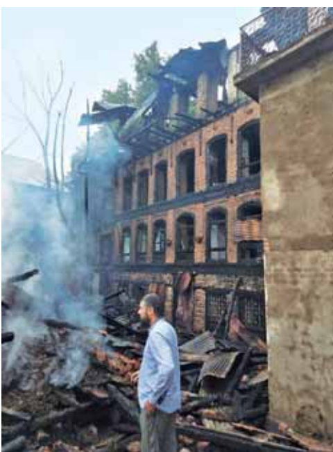
At least four houses belonging to Kashmiri Pandits were gutted under mysterious circumstances in the Mattan area of Anantnag district.

A late-night fire incident, in which at least four houses belonging to Kashmiri Pandits were gutted under mysterious circumstances in the Mattan area of Anantnag district on Sunday, has once again sparked a debate and raised serious security concerns among the Kashmiri Pandit community living in exile since 1990. The houses stood tall and witnessed over three-decade-long struggle before they were gutted under mysterious circumstances late last night. "We received this news early in the morning. The fire incident took place around 2.30 am. We demand a high-level probe into the fire," a close relative of the family living in Jammu told reporters. The multi-floor building was considered heritage site in the area. Most visitors reaching Mattan to fulfil their religious obligations used to pay a visit to the area and soak themselves in the glorious history of their forefathers who had constructed these architecturally rich structures. A prominent Kashmiri Pandit activist Ravinder Padita, associated with the Save Sharda in a post on X commented, "Is it sabotage or natural causes? One needs to know".