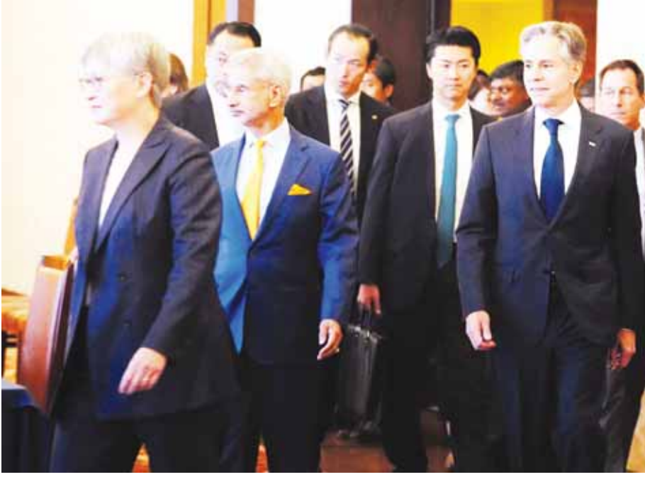
Australian Foreign Minister Penny Wong, left, Indian External Affairs Minister Subrahmanya Jaishankar, second left, and U.S. Secretary of State Antony Blinken, second right, arrive for the Quad Ministerial Meeting, at the Foreign Ministry's Iikura guesthouse in Tokyo, Monday.