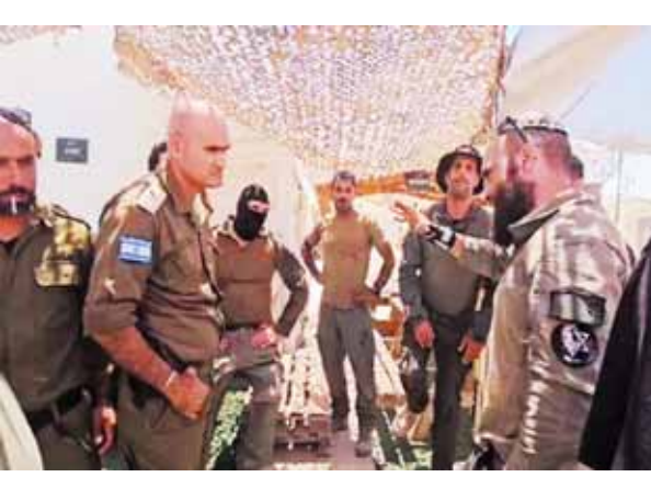
A heated argument erupts between soldiers at the Sde Teiman detention facility in southern Israel after Military Police investigators arrived to detain suspects for questioning.

The Israeli military said Monday it was holding nine soldiers for questioning following allegations of "substantial abuse" of a detainee at a shadowy facility where Israel has held Palestinian prisoners throughout the war in Gaza. The military did not disclose additional details surrounding the alleged abuse, saying only that its top legal official had launched a probe. An investigation by The Associated Press and reports by rights groups have exposed abysmal conditions at the Sde Teiman facility, the country's largest detention centre. A report by the United Nations agency for Palestinian refugees, UNRWA, earlier this year said that detainees alleged they were subjected to ill-treatment and abuse while in Israeli custody, without specifying the facility.