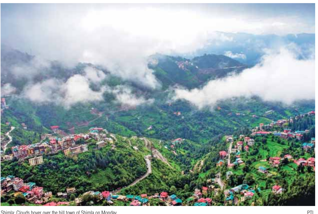
Shimla: Clouds hover over the hill town of Shimla on Monday