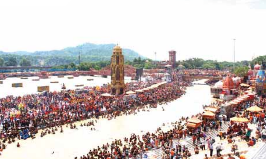
'Kanwariyas' gather at Har Ki Pauri ghat to collect 'Ganga jal', in Haridwar