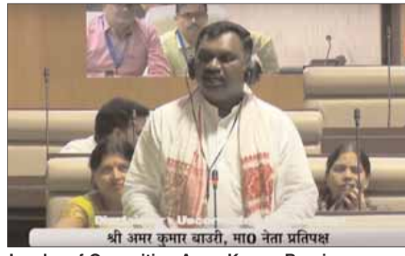
Leader of Opposition Amar Kumar Bauri addresses the House during the Monsoon Session of Jharkhand Assembly on Monday.

After political and social pressure, finally a case was registered on the 18th. He said that when the students of K M College tried to take out a public outrage rally against this loot on July 27, which was also informed to the Deputy Commissioner and Superintendent of Police of the district, the police and goons attacked the students late at night and beat them up a night before. Not only this, the police also tried to change the whole matter by calling it a case of kidnap-