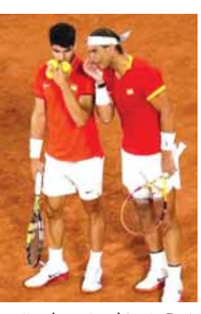
major championships in Paris and grabbed the last four games to beat Romania's Irina-Camelia Begu 6-2, 7-5, while reigning French Open

and owns two Summer Games golds, was a surprise torch carrier during the rain-soaked opening ceremony along the Seine River on Friday night. He won his doubles opener alongside Alcaraz on Saturday night. Nadal has not made entirely clear whether or not these Summer Games will be the final event of his career. He is 38 and has been dealing with injuries for much of the past two seasons. Nadal and Alcaraz never had played doubles together, but they got past the sixth-seeded Argentine duo of Maximo Gonzalez and Andres Molteni 7-6 (4), 6-4. The No. 1-ranked Swiatek claimed four of her five career