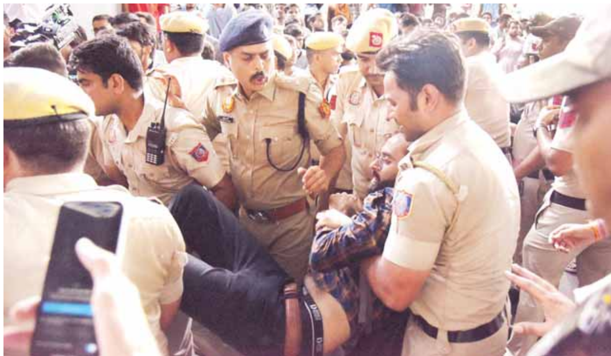
Police detain students protesting outside Karol Bagh metro station after three IAS aspirants died in the basement of Rau's IAS Study Circle at Old Rajinder Nagar area, in New Delhi, on Sunday

Phones kept buzzing with messages on WhatsApp groups with helpless students trying to find where their friends — studying at the Rau's Coaching centre's library on Saturday evening — were following the death of three civil services aspirants due to rain-induced flooding in the basement of the coaching centre. While reports claimed only three lives were lost, students who were witness to the tragic incident unfolding before their eyes claimed a higher number. All the deceased had cleared their preliminary examination, the results of which was declared a few days ago and were burning midnight oil to prepare for the Mains examinations scheduled in October-November which is second stage of Civil Services Examinations to qualify to become an IAS, IPS or allied services officer.