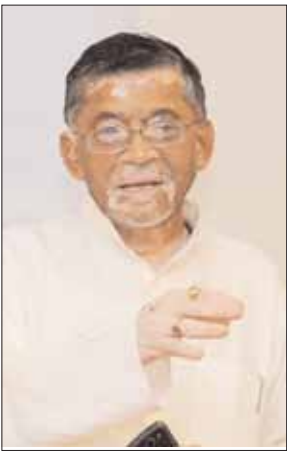
Jharkhand, has been an MP 8 times. Gangwar was active in BJP for a long time. He has also been an MP from Bareilly Lok Sabha

Santosh Kumar Gangwar will be the new Governor of Jharkhand. The current Governor C.P. Radhakrishnan has been made the Governor of Maharashtra.