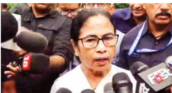
West Bengal Chief Minister Mamata Banerjee interacts with the media after walking out of a NITI Aayog meeting chaired by Prime Minister Narendra Modi, in New Delhi, on Saturday

To begin with, Mamata claimed that she was unfairly stopped midway through her speech, despite being the sole representative of the Opposition. She said her microphone was switched off after five minutes, while other Chief Ministers were allowed to speak for longer duration.