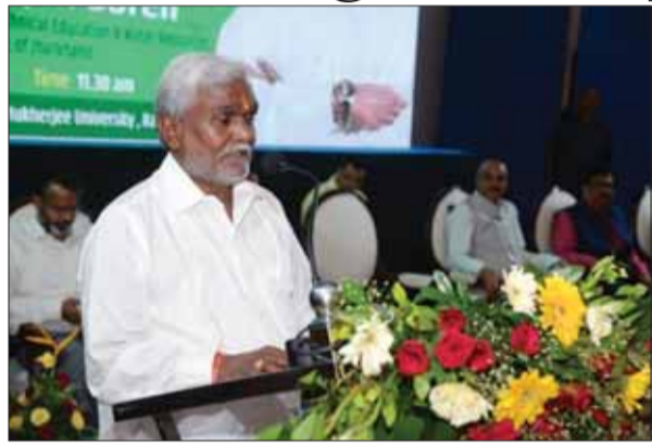
Higher and Technical Education Minister Champai Soren addressing the workshop on the topic "Digital Initiatives for Higher Education in Jharkhand" organized by the Department of Higher and Technical Education at Dr Shyama Prasad Mukherjee University in Ranchi on Thursday.

On this occasion, while listing the priorities of the Jharkhand Government in the field of higher education, Champai said that many schemes including Gurujit Student Credit Card, Manki Munda Scholarship have been started to encourage students for higher education. "The main objective of these schemes is to connect the poor tribals, natives and common people of this mineral-rich state with educa-