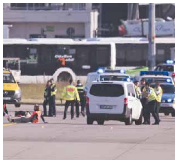
Emergency vehicles from the police, fire department and airport security are parked on the apron of Frankfurt Airport, where a few activists have taped themselves up, in Frankfurt, Germany, on Thursday

Germany's busiest airport canceled more than 100 flights Thursday as environmental activists launched a coordinated effort to disrupt air travel across Europe at the height of the summer holiday season to highlight the threat posed by climate change.