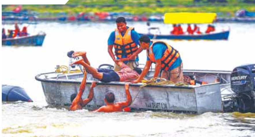
Members of the State Disaster Management Authority perform rescue operation during a mock drill, in Prayagraj