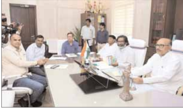
Assembly Speaker Rabindra Nath Mahto along with Chief Minister Hemant Soren during the all party meeting on the eve of 'Monsoon Session' of Jharkhand Assembly in Ranchi on Thursday.

He has been critical of Chief Minister Hemant Soren. Another disqualified