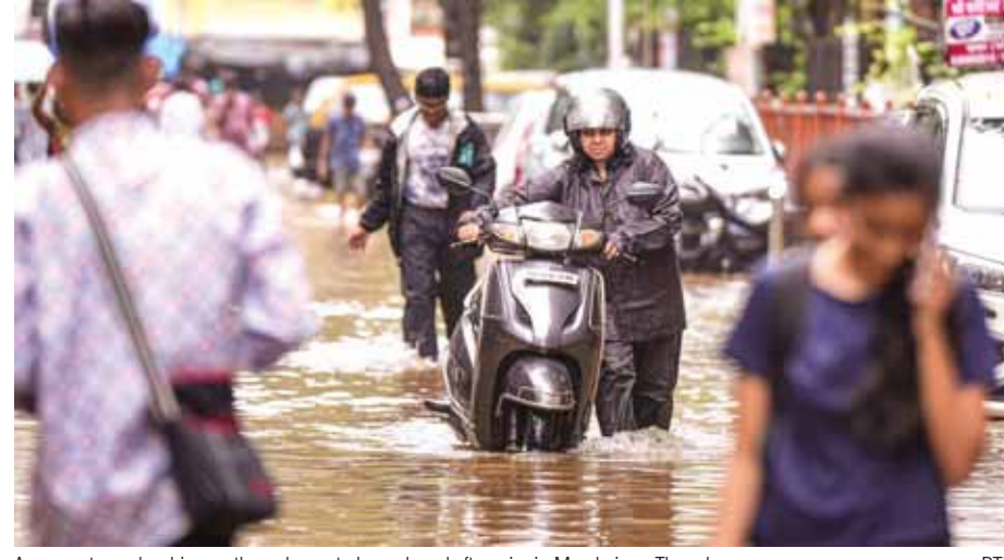
A commuter makes his way through a waterlogged road after rain, in Mumbai, on Thursday

At least three people were electrocuted in Pune and three others feared trapped under the debris of three collapsed villas in a hill slide at Lavasa, even as the heavy rains wreaked havoc in Pune, Mumbai and various parts of Maharashtra, prompting the Maharashtra Government to seek the assistance of the Army and Navy to deal with the monsoon-related incidents. Many parts of Pune lay thick sheets of water as the heavy rains ravaged the city since Wednesday night, while intense rains battered Mumbai, Thane, Palghar and other surrounding areas resulting in heavy flooding in low-lying areas and disruption in train and flight operations. As a precautionary measure, the authorities declared holidays for schools and colleges in Pune, Mumbai and Thane. Three mobile snacks stall owners were electrocuted when they tried to move their handcarts to safety through the flood waters near Z bridge at around 3.30 am in Pune, while three others were feared trapped nearby Lavasa city after a hill-slide buried three villas. A Nepali boy Shiv Jidbahadur Pariyar (18) was among three persons killed in Pune, while two others killed in an electrocution incident were identified Akash Mane (21) and Abhishek Ghanekar (25). The State's cultural, academic