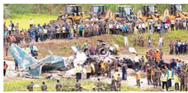
Rescue operations are underway at the site of a plane crash at Tribhuvan International Airport in Kathmandu, Nepal, on Wednesday

The top court said the Centre has to examine the demands of the farmers as a welfare state. "Some demands may be genuine, others may not be acceptable," the bench said.