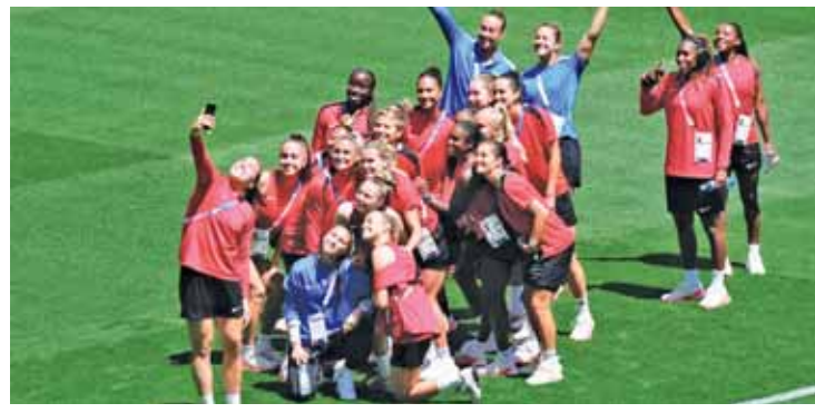
apologies to New Zealand Football, to all the players affected, and to the New Zealand Olympic Committee." The NZOC said it and New Zealand

"Team support members immediately reported the incident to police leading to the drone operator, who has been identified as a support staff member of the wider Canadian Women's football team, to be detained," the NZOC said in a statement. "The NZOC has formally lodged the incident with the IOC integrity unit and has asked Canada for a full review." The Canadian Olympic Committee has apologized to the NZOC and New Zealand Football. "The Canadian Olympic Committee stands for fair play and we are shocked and disappointed," the statement said. "We offer our heartfelt