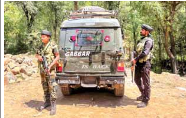
Security personnel stand guard during an encounter with terrorists in Trimukha area of Sopore in North Kashmir, on Wednesday