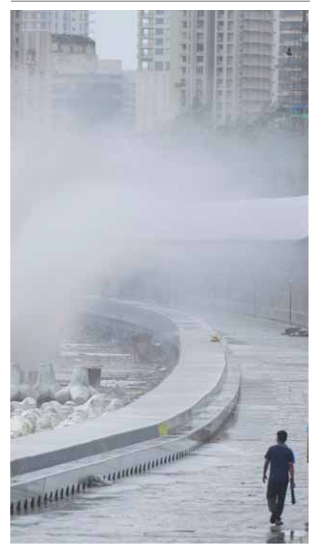
People walk past as sea waves crash against the promenade during high tide, at Marine drive, in Mumbai, on Wednesday

issues such as import duties on automobiles and scotch whisky and visas for business people. The British readout said Lammy will highlight the importance of a new partnership with India that focuses on economic, domestic and global security. Economic, domestic and global security will be at the heart of the Foreign Secretary's first visit to India as he travels to New Delhi to unlock the full potential of the UK-India partnership. He will tell his Indian counterpart that he wants to drive forward greater growth for both countries, it said. The Foreign Secretary will underscore the importance of the "living bridge" between the UK and India. It represents the 1.7 million people with Indian heritage that have made their home in the UK and make an exceptional contribution to British life, the readout released by the UK high commission in New Delhi said. "In a visit to India's third largest technology company, the Foreign Secretary will meet business leaders to highlight how the UK and India are working together on shared ambitions such as cutting-edge science to encourage innovation, boost trade, and improve the livelihoods of working people in both countries," it said.