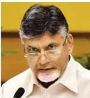
Andhra Pradesh Chief Minister CHANDRABABU NAIDU

not possible because of practical difficulties?" JD(U) lashed out at the Opposition RJD-Congress-Left combine for creating a ruckus over the demand for Special Status "forgetting that the UPA, of which they were a part, had rejected demand while it was ruling the Centre?" "We were speaking of Special Status, and a lot of people said the provision for Special Status has been done away with much earlier. So, instead of that, aid should be given to help development in Bihar. Now, they have begun doing,"