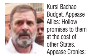
Kursi Bachao Budget. Appease Allies: Hollow promises to them at the cost of other States. Appease Cronies: Benefits to AA with no relief for the common Indian. Copy and Paste: Congress manifesto and previous Budgets

Elaborating upon the relief for the middle class, Sitharaman pointed to the hike in standard deduction — a flat deduction from total salary earned by an employee in a year before calculating applicable