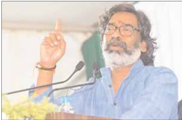
Chief Minister Hemant Soren addresses during the inauguration of Mudma Leprosy Asylum Project in Ranchi on Tuesday.

Soren said that today is a historic day. The state government has made a better effort. Hundreds of people are becoming owners of their homes today. They will live with their entire family in these newly built houses from today. The Chief Minister said that such welfare schemes are being started in different districts for