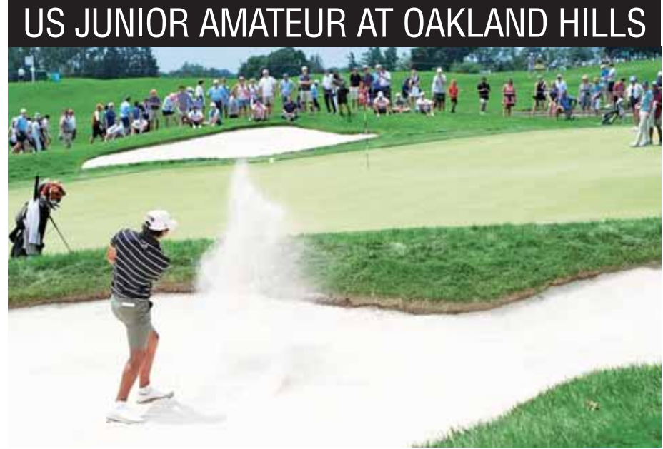
US JUNIOR AMATEUR AT OAKLAND HILLS