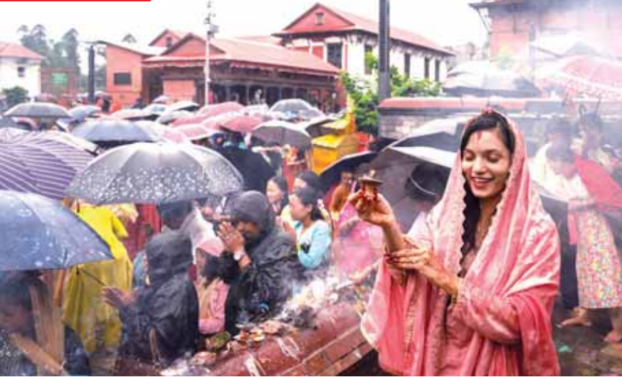
Hindu devotees offer prayers during the holy month of Shrawan at the Pashupatinath Temple in Kathmandu