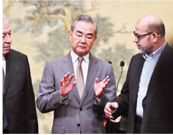
China's Foreign Minister Wang Yi, center, hosts an event for Mahmoud al-Aloul, left, vice chairman of Fatah, and Mussa Abu Marzuk, a senior member of Hamas, to meet at the Diaoyutai State Guesthouse in Beijing, Tuesday.

West Bank hilltops are the primary drivers of violence and displacement of Palestinians. In the last month alone, Israel's government has legalized five formerly unauthorized settlements and made the largest land grab in the West Bank in three decades, declaring a wide swath of the territory state land in preparation for new construction. Palestinians say violence by people associated with these farms has soared since Hamas' October 7 attack, which sparked Israel's war against the militant group in the Gaza Strip. On Friday, the top United Nations court said Israel's presence in the Palestinian territories is unlawful and called for an immediate halt to settlement construction. Prime Minister Benjamin Netanyahu quickly denounced the nonbinding opinion, saying the territories are part of the Jewish people's historic homeland. Israel captured the West Bank, east Jerusalem and Gaza — areas claimed by the Palestinians for a future state — in the 1967 Mideast war. It has settled over 5,00,000 Jews in the West Bank, most of whom live on authorized settlements, in addition to over 2,00,000 others in contest-