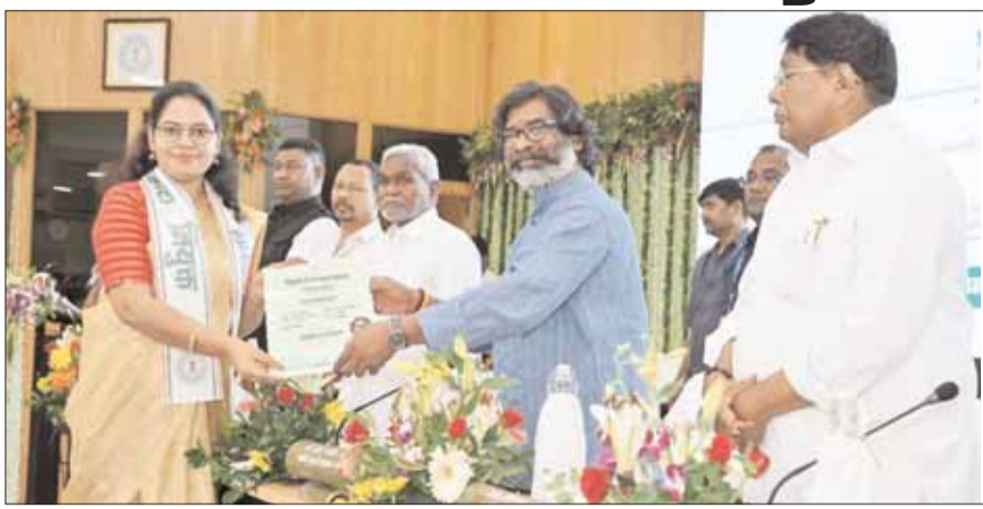
Chief Minister Hemant Soren gives an appointment letter to a selected candidate during a programme at Project building in Ranchi on Tuesday.

"I am confident that the newly appointed candidates who are taking appointment letters today will become an important link in the all-round development of the state. Today the Town Planner has been appointed. His effort should be to ensure the all-round development of the city. Based on