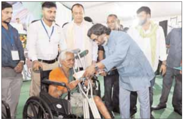
Chief Minister Hemant Soren felicitates people with Pradhan Mantri Awas Yojna (PMAY) scheme during inauguration of Mudma Leprosy Asylum project in Ranchi on Tuesday. PNS

Gifts houses to 256 special families, reiterates commitment to serve all sections of society