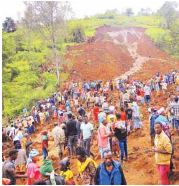
In this handout photo released by Gofa Zone Government Communication Affairs Department, hundreds of people gather at the site of a mudslide in the Kencho Shacha Gozdi district, Gofa Zone, southern Ethiopia, Monday, July 22, 2024. At least 146 people were killed in mudslides in a remote part of Ethiopia that has been hit with heavy rainfall, according to local authorities.