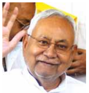
Bihar Chief Minister NITISH KUMAR

Although a "Special Package" for Narendra Modi's major allies — the JD(U) and TDP-ruled State Governments of Bihar and Andhra Pradesh was announced by Finance Minister Nirmala Sitharaman, a cryptic response by Bihar Chief Minister Nitish Kumar on the Centre's refusal of "Special Category Status" set tongues wagging throughout the day, given the senior JD(U) leader's political maneuvering over the years. "You will get to know all things slowly, and slowly," Nitish said when asked by media in Patna a day after his demand for Special Status was completely denied by the BJP-led NDA regime at the Centre. Nitish led a resolution by his party recently which reiterated firm demand Special Status Category and the conditional support to BJP on the issue. By evening, however, Nitish claimed the Budget "meets our demand for special assistance, if grant of special status was