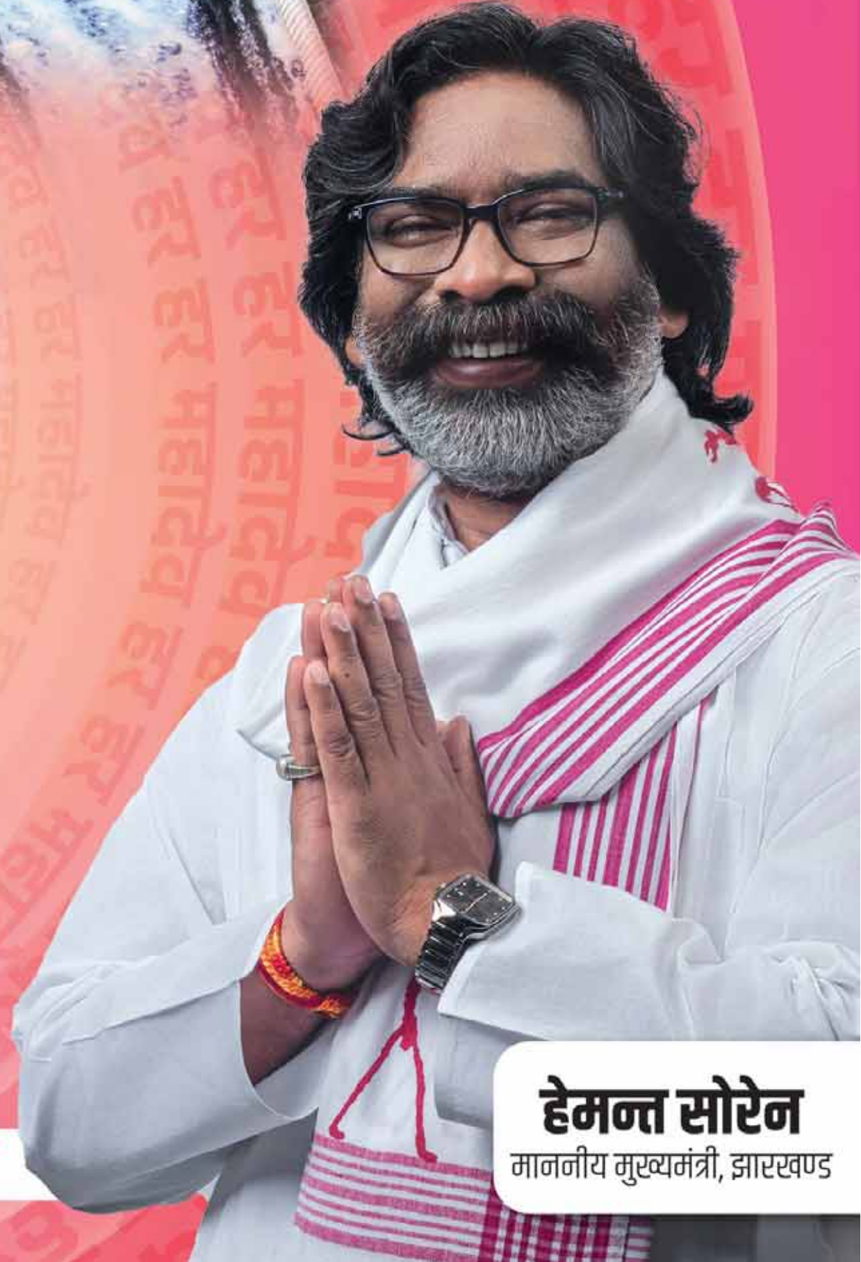
हेमन्त सोरेन माननीय मुख्यमंत्री, झारखण्ड

सूचना एवं जनसम्पर्क विभाग, झारखण्ड सरकार