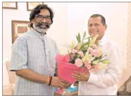
Dr Achyut Samant founder of KIIT Group of Institutions meets Chief Minister Hemant Soren at his official residence in Ranchi on Sunday.

On the occasion, Chief Minister Hemant Soren discussed with Dr. Achyuta Samant about the establishment of a branch of Kalinga Institute of Social Sciences (KISS) in the state. The Chief Minister told Dr. Achyuta Samant that during his visit to Odisha recently, he had the opportunity to attend the function organized by Kalinga Institute of Social Sciences, at the same time, there was a positive discussion on opening a branch of KISS in Jharkhand as well. The Chief Minister told him that his government will give concrete shape to the establishment of this educational institution by mak-