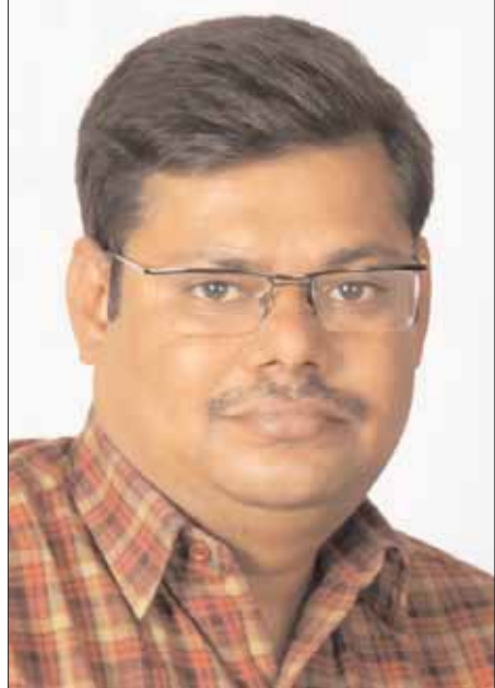
PROF. ANANT KUMAR

The National Health Policy (NHP, 2017) emphasizes universal health care with a comprehensive primary health care approach to ensure 'health for all'. The policy envisages attaining the highest possible level of health and well-being for all through preventive and promotive health care and universal access to good quality health care services.