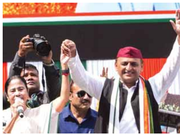
West Bengal Chief Minister and TMC chief Mamata Banerjee with Samajwadi Party (SP) National President Akhilesh Yadav during TMC 'Martyr's Day' rally in Kolkata, on Sunday.

After major allies like JD (U) and LJP, BJP's another significant ally in the NDA --the Rashtriya Lok Dal -- on Sunday demanded the Uttar Pradesh Government roll back its order that eateries along the Kanwar route must display the names of their owners, saying the pilgrimage does not belong to any one religion or caste. Union Minister Jayant Chaudhary said Kanwaris ask no-one their religion when they seek any service from them, neither should the matter (the pilgrimage) be linked to any religion. Chaudhary also wondered if one should wear a name tag on one's clothes to identify one's religion. "Where all one would be made to place these identifiers! Should we now wear name tags too? So that one knows who to shake hands with?" he said. "It seems that the order was taken without much thought and the Government is adamant on it because the decision has been taken," Rajya Sabha member Chaudhary told reporters here.