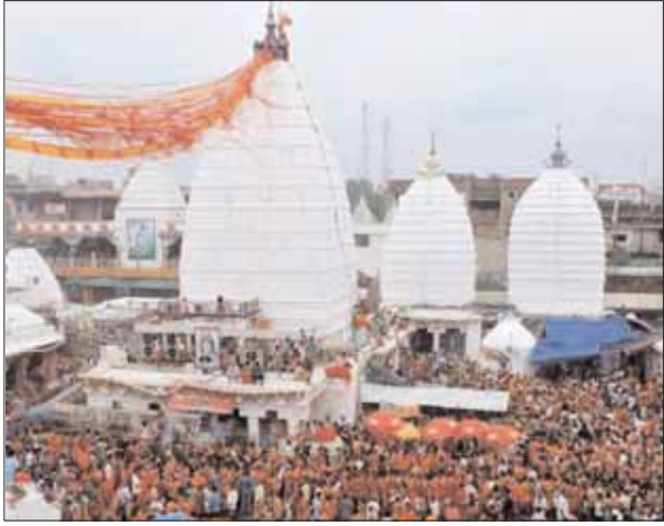
pletely closed during the state Shravani Mela.