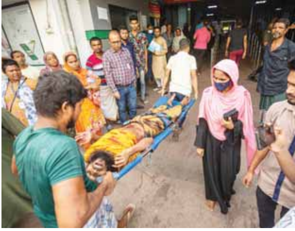
An injured student is carried on a stretcher as students clash with police over the quota system in public service brought to a hospital, in Dhaka, Bangladesh, on Saturday, July 20

Saturday that at least 103 people have died so far. Sporadic clashes in some parts of Dhaka, the capital, were reported on Saturday but it was not immediately clear whether there were any fatalities. Ahead of the Supreme Court hearing, soldiers patrolled cities across the South Asian country. Home Minister Asaduzzaman Khan said the stay at home order will be relaxed from 3 pm to 5 pm on Sunday for people to run essential errands. Meanwhile, the government has declared Sunday and Monday as public holidays, with only emergency services allowed to operate. Protesters argue the quota system is discriminatory and benefits supporters of Hasina, whose Awami League party led the independence movement, saying it should be replaced with a merit-based system. Hasina has defended the quota system, saying that veterans deserve the highest respect for their contributions in the war against Pakistan, regardless of their political affiliation. Representatives from both sides met late Friday in an attempt to