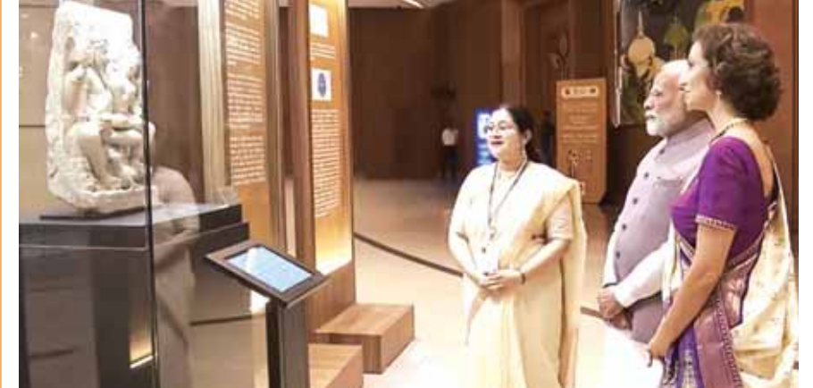
Prime Minister Narendra Modi watches exhibition during the inauguration of the 46th Session of World Heritage Committee, at Bharat Mandapam, in New Delhi, Sunday.