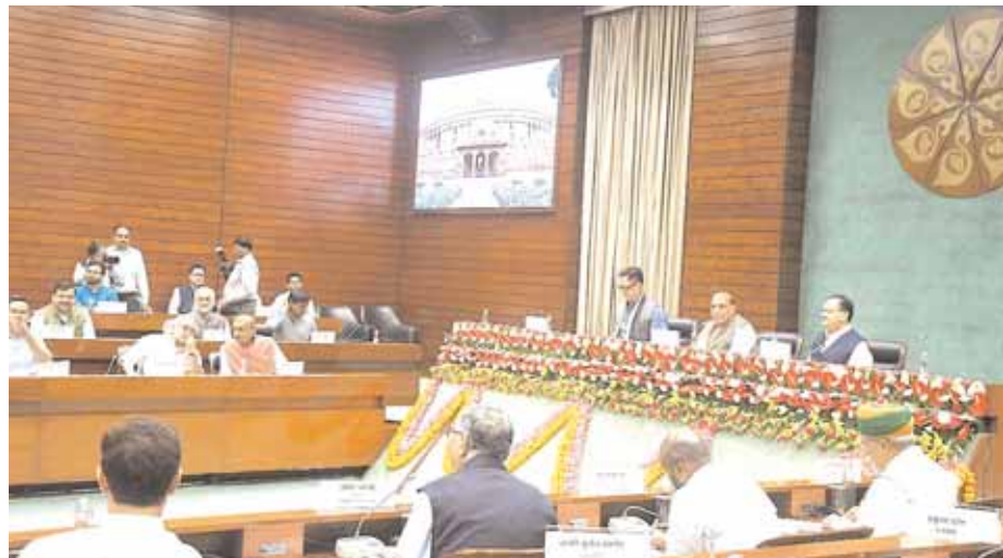
Defence Minister Rajnath Singh, Union Minister for Parliamentary Affairs Kiren Rijiju and Union Minister Jagat Prakash Nadda during the all-party meeting ahead of the Budget session of Parliament, in New Delhi on Sunday.

The Monsoon Session which will also see presentation of the annual Budget of the first year of Narendra Modi's third tenure as the Prime Minister, is all set to begin at the backdrop of several contentious and controversial issues including Kanwar yatra order, an alleged compromised UPSC, NEET, train accidents concerning both the ruling as well as the Opposition which is now in a commanding strength in the Lok Sabha. At the all-party meeting convened by the Centre on Sunday, the Opposition parties while insisting for the post of Deputy Speaker in the Lok Sabha also drew battle lines for the three weeks session to allow discussion on a range of issues. Representatives from the JD (U), a BJP ally, the BJD and the YSR Congress Party demanded the most favoured States status for Bihar, Odisha and Andhra Pradesh, respectively, at the meeting of 44 parties, including some having only one MP. During the meeting, which was chaired by Defence Minister Rajnath Singh, Opposition RJD and BJP ally LJP (Ram Vilas) echoed the demand for Bihar. The Monsoon Budget session will have 19 sittings till August 12 when the