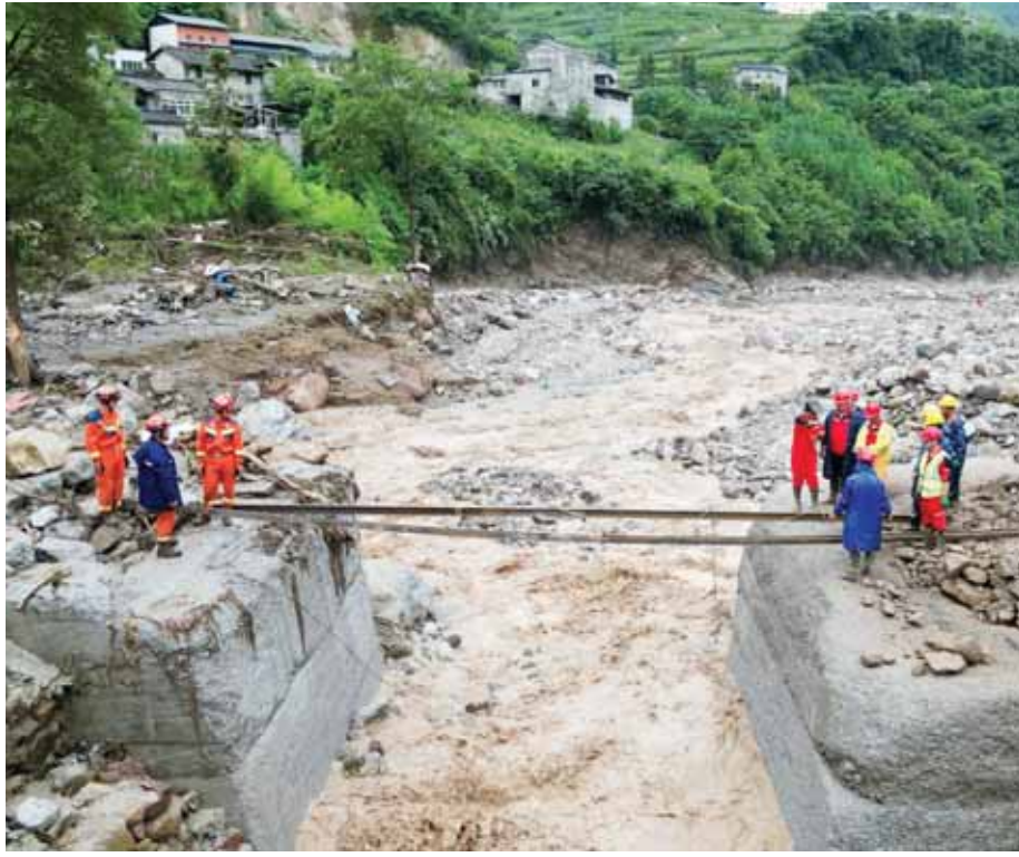
In this image made from video released by Xinhua News Agency, rescue workers set up a temporary crossing in the aftermath of floods in Xinhua Village of Hanyuan County, Ya'an City, southwest China's Sichuan Province, July 20