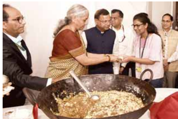
The Union Minister for Finance and Corporate Affairs, Nirmala Sitharaman, commences final stage of Union Budget 2024 with halwa ceremony, in New Delhi, on Tuesday

The Centre has convened an all-party meeting on July 21 ahead of the Monsoon session of Parliament which will start next Monday during which the full fledged annual Budget of the third term of the Narendra Modi-led NDA Government will be presented. The traditional "halwa" ceremony, marking the final stage of the Budget preparation process for Union Budget 2024, was held in North Block on Tuesday, in the presence of Union Finance Minister Nirmala Sitharaman. The customary ceremony begins with the Finance Minister stirring the "halwa" in the kadhai and then serving it to the colleagues in the Ministry. It is a tradition performed every year ahead of the Budget and it marks the final stage of preparing the plan for the upcoming financial year. Meanwhile, the Opposition parties under the INDIA Bloc too have convened a meeting of their Parliamentarians the same evening and another on July 22 morning ahead of the resumption of Parliament to discuss the strategy to raise the issues during the three-weeks-long Monsoon cum