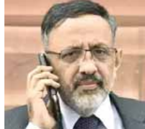
Rajiv Gauba File photo

Top bureaucrats of all Central Government Ministries and departments have been directed to identify at least one impactful project to be commissioned in the first 100 days of the Government and implementation of action points, as envisioned by Prime Minister Narendra Modi. In a communication to all secretaries, Cabinet Secretary Rajiv Gauba also said the 'whole of the Government' approach has to be adopted by the Ministries and departments in formulating and implementing their policies