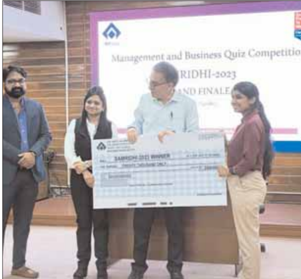
team members on this remarkable achievement,