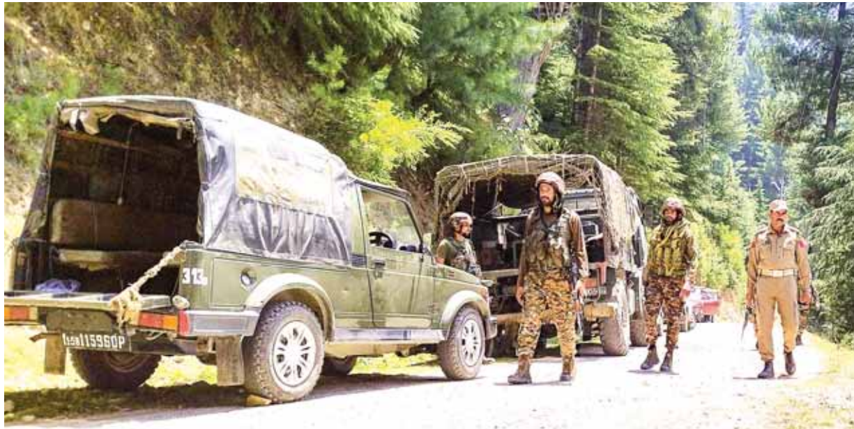
Security forces personnel during an encounter with terrorists in Doda forest area, in Doda district of Jammu and Kashmir, on Tuesday

A Captain of the Indian Army, along with three other soldiers, was martyred during a fierce gunfight with a group of suspected foreign terrorists in Jammu Dassa forest area, which shares its boundaries with Basantgarh in Udhampur, Anantnag, Keshwan in Kishtwar, and Pogal Paristan in Ramban district, late Monday night. It is suspected the joint team of security forces was lured into the deep forest area where they were ambushed by the well-entrenched group of the foreign terrorists. Kashmir Tigers, a proxy outfit of the Jaish-e-Mohammad, has claimed responsibility for the attack. The gruesome attack comes close on the heels of another deadly ambush on the soldiers near Badnota village of Machhedri in the Billawar tehsil of Kathua district on July 8 in which five soldiers were martyred and five others were injured. The Indian Army, however, maintained that a joint operation with J&K Police was launched in the general area of Urabaggi, 10 km North of Doda. At about 8.40 pm on Monday, the search party was able to establish