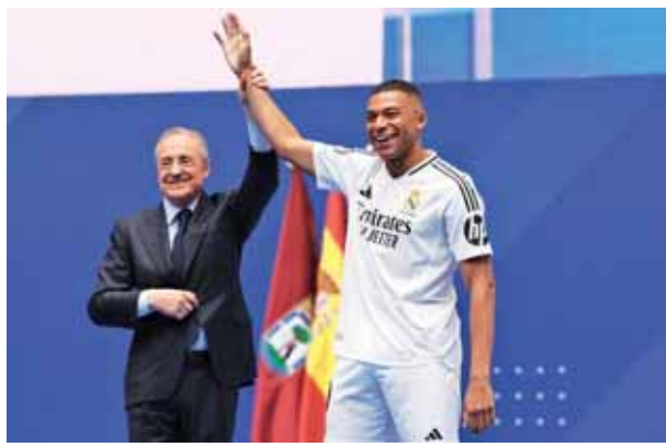
Bernabeu, which had its roof closed for the midday ceremony in the Spanish capital. Kids linked to

cheers by the Madrid fans. Wearing the No. 9 jersey, Mbappé smiled broadly and waved to the fans who chanted his name, then embraced Pérez and former Madrid player and coach Zinedine Zidane, who invited Mbappé to visit the Spanish club for the first time when he was just a teenager. "It's incredible day for me," Mbappé told the crowd, in Spanish. "Since being a kid I dreamed about playing for Madrid and today I'm here. It means a lot to me." Mbappé's relatives, club officials and several former players were by the stage at the