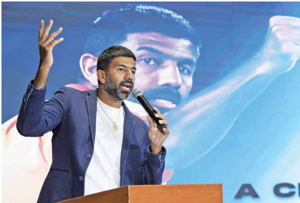
(Matthew) Ebden, who I'm playing with, he's somebody who's more agile, more explosive on that surface. "And for clay, especially, I need a partner who would suit me

the French Open where Bopanna was pushed along with Matthew Ebden by the Tamil Nadu player and his Mexican partner Miguel Reyes-Varela. Not only this, Balaji had a consistent run on the ATP Tour where he scalped a few big names such as Americans Rajeev Ram and Austin Krajicek -- both top-10 players -- at the Houston ATP 250 event on clay. With his German partner Andre Begemann, Balaji also defeated Austria's top-50 players Alexander Erler and Lucas Miedler. Balaji also showed that he can quickly adapt to conditions when he was asked to do the singles duty during the Davis Cup tie against Pakistan on grass. The rival was not of the highest quality but Balaji showed that he was willing to come out of his comfort zone if the team demands. "The idea is to go prepared, at least believe in as a team. That is what we're trying to do. With Bala, he definitely has the firepower to do well," Bopanna said. He also gave his reason for picking Balaji over Bhambri. "I felt Balaji, depending on the surface we're playing with, which is the clay, would have been the ideal partner. Currently, even if you look at