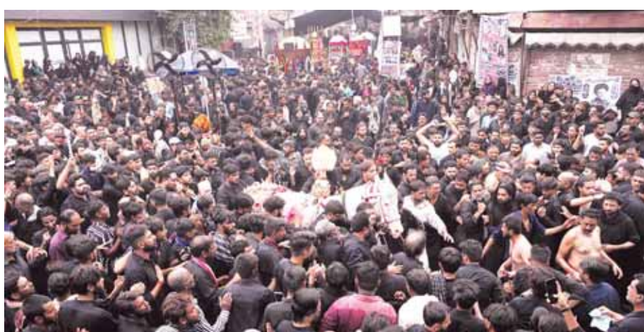
Shiite Muslims touch a horse, that symbolizes the horse that carried Imam Hussein during the battle of Karbala, during a Muharram procession, in Lahore, Pakistan, Tuesday.

Tehran (AP): Iranian Shiite Muslims on Tuesday commemorated Ashura, a remembrance of the seventh century martyrdom of the Prophet Muhammad's grandson, Hussein, that gave birth to their faith. Over 1,340 years after Hussein's death, Tehran and other cities across the country were adorned with symbols of Shiite piety and repentance. Red flags represented Hussein's blood, black funeral tents and clothes indicated mourning, and processions of chest-beating and self-flagellating men expressed fervour. Some sprayed water over the mourners in the intense heat. Many Iranian people also travelled to the Iraqi city of Karbala, where Hussein is entombed in a gold-domed shrine, to mourn there. Iranian state TV broadcast live from there, showing people at the shrine. Shiites represent over 10 per cent of the world's 1.8