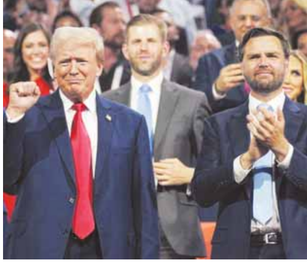
Republican presidential candidate former President Donald Trump and Republican vice presidential candidate Sen. JD Vance, R-Ohio, attend the first day of the Republican National Convention, Monday.

Donald Trump, wearing a white bandage partially covering his injured right ear, stole the show when he made his first public appearance on the opening night of the Republican National Convention here, days after surviving an assassination attempt. Trump on Monday entered the convention hall to roaring applause from thousands of delegates and holding his fist aloft towards the end of the first day of the four-day convention being held at the Fiserv Forum in Milwaukee, a city in the US state of Wisconsin. The former president entered the convention arena here with a fist raised and to the strains of a live performance of "God Bless the USA". He then slowly walked through cheering delegates who pumped their fists and called out "Fight! Fight! Fight!" He then greeted key political allies and members of his fam-