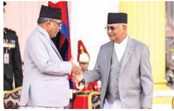
Outgoing Prime Minister Pushpa Kamal Dahal (left) congratulates newly-elected Prime Minister Khadga Prasad Oli (right) after the oath of office at the Presidential residence in Kathmandu on Monday.

KP Sharma Oli on Monday was sworn in as Nepal's Prime Minister for the fourth time to lead a new coalition government that faces the daunting challenge of providing political stability in the Himalayan nation. The leader of Nepal's largest communist party was appointed as prime minister on Sunday by President Ram Chandra Paudel to lead the coalition government with the Nepali Congress (NC), the largest party in Parliament, apart from other smaller parties. Oli, 72, succeeds Pushpa Kamal Dahal 'Prachanda', who lost the vote of confidence in the House of Representatives (HoR) on Friday, leading to the formation of the new government. Chairman of the Communist Party of Nepal-United Marxist Leninist (CPN-UML), Oli was sworn in by President Paudel at Shital Niwas, the main building of Rashtrapati Bhawan at a ceremony that was delayed by more than half an hour. According to the news portal MyRepublica, the swearing-in ceremony was delayed due to the failure of the Nepali Congress to finalise the names