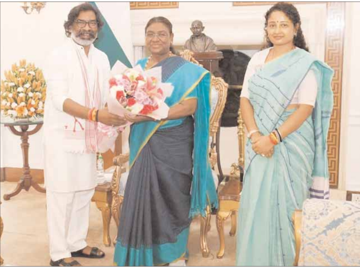
President Droupadi Murmu receives a bouquet from Jharkhand Chief Minister Hemant Soren during a courtesy meet at Rashtrapati Bhawan in New Delhi on Monday. JMM MLA Kalpana Soren also seen in the picture.