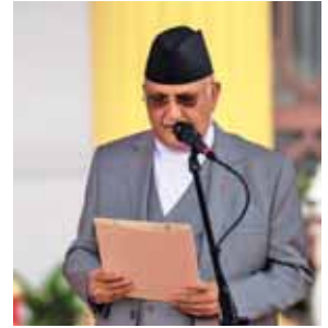
Newly elected Prime Minister Khadga Prasad Oli is being sworn in by president Ram Chandra Paudel, unseens, at the Presidential residence in Kathmandu, Nepal

KP Sharma Oli on Monday was sworn in as Nepal's Prime Minister for the fourth time to lead a new coalition Government that faces the daunting challenge of providing political stability in the Himalayan nation. The leader of Nepal's largest communist party was appointed as Prime Minister on Sunday by President Ram Chandra Paudel to lead the coalition Government with the Nepali Congress (NC), the largest party in Parliament, apart from other smaller parties. Oli, 72, succeeds Pushpa Kamal Dahal 'Prachanda', who lost the vote of