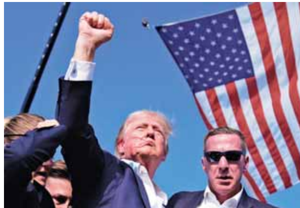
Republican presidential candidate former President Donald Trump reacts as he is surrounded by US Secret Service agents at a campaign rally, in Butler