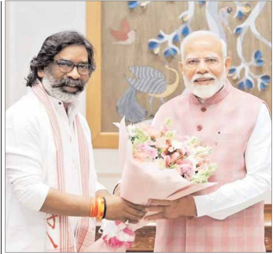
Prime Minister Narendra Modi receives a bouquet from Jharkhand Chief Minister Hemant Soren during a courtesy meet in New Delhi on Monday.