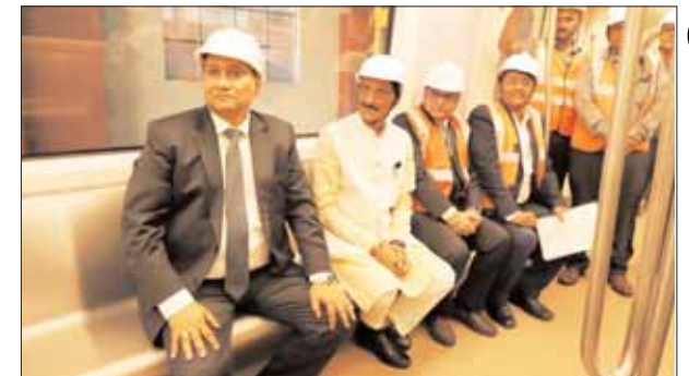
Minister of State for Defense, Government of India Sanjay Seth, alongwith officials during flagging off of a new driverless MRS-1 metro trainset at BEML's Bengaluru plant, on Monday.

Seth emphasised the significance of indigenously developed metro rail systems in enhancing urban mobility and further stated, BEML's contribution to the Make in India initiative is commend-