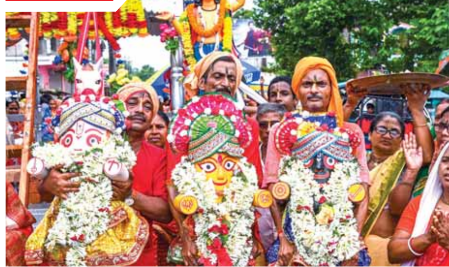
Devotees carry idols of Lord Jagannath, Balabhadra and Subhadra on the occasion of Ulta Rath Yatra in Nadia