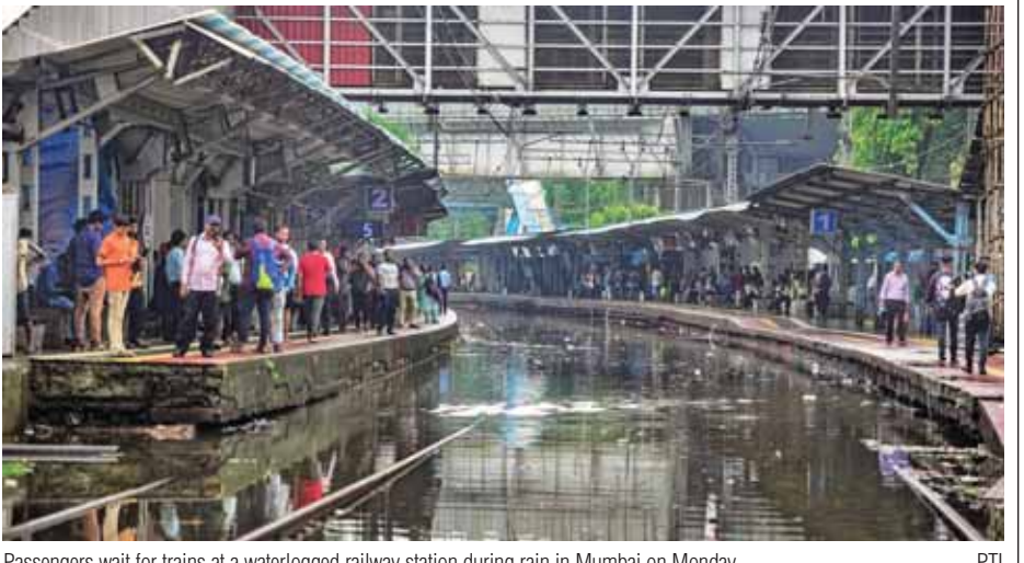
Passengers wait for trains at a waterlogged railway station during rain in Mumbai on Monday