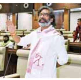
Jharkhand Chief Minister Hemant Soren speaks during a Special Session of the State Legislative Assembly, held in Ranchi on Monday

situation. "Unlike in the past, it has rained a lot in less time which is more than the city's carrying capacity. As a result, there was a water-logging on railway tracks and roads. Traffic has now resumed on all roads. Senior officials are present at all water-logging-prone spots in the city. The State Disaster Management Authority, NDRF, BMC are on alert," Shinde said. "There is movement of vehicles on Eastern and Western express highways and all railway lines. NDRF teams have reached all three coastal districts in the state. Army, Navy and Air Force are also on alert," Shinde said.