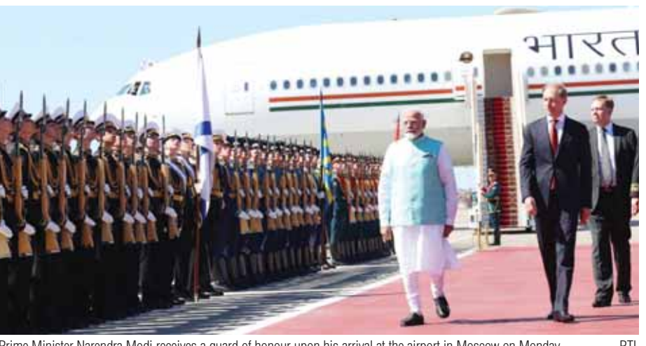
Prime Minister Narendra Modi receives a guard of honour upon his arrival at the airport in Moscow on Monday

the untainted students". "In a situation where breach affects the entirety of process and it is not possible to segregate the beneficiaries from others, it may be necessary to order a re-test," the bench said. The court said if the sanctity of NEET-UG 2024 is "lost" and if the leak of its question paper has been propagated through social media, then a re-test has to be ordered. The bench said the extent of question paper leak and the beneficiaries across geographical boundaries have to be ascertained before the top court may order a re-test in the controversy-ridden exam which was taken up by 23.33 lakh students at 4,750 centres in 571 cities including in 14 cities overseas.