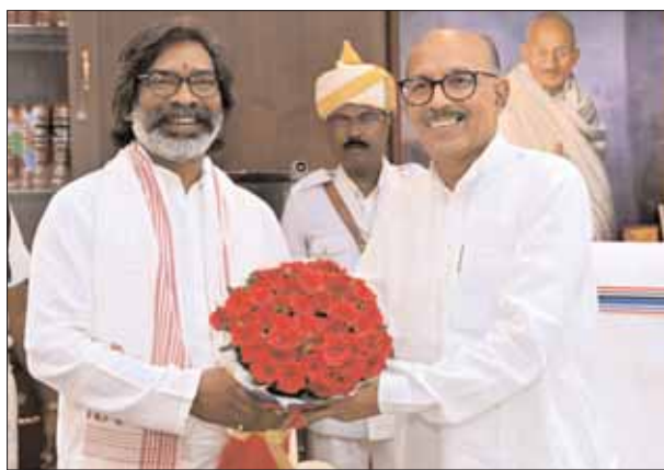
Chief Minister Hemant Soren speaks greets Speaker Rabindra Nath Mahto at the State Assembly in Ranchi, Jharkhand on Monday.