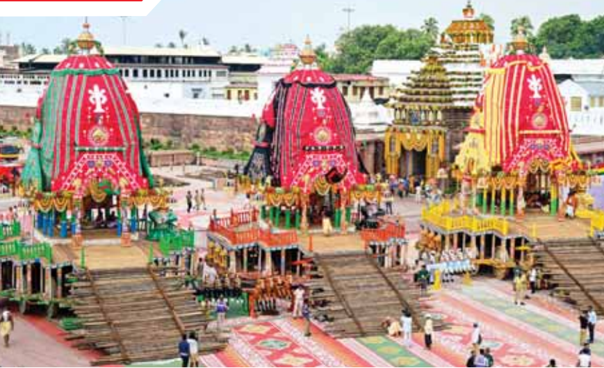
The chariots of Lord Jagannath, Balabhadra and Devi Subhadra prepared for annual Rath Yatra festival, in Puri