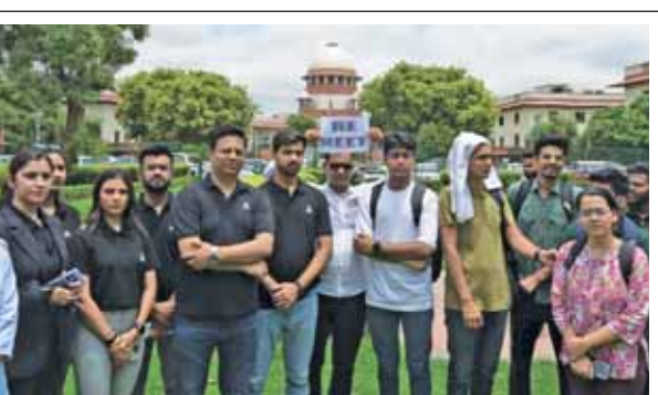
Students at the Supreme Court of India in New Delhi, on Monday. The apex court has begun the hearing for a number of petitions regarding the alleged irregularities in the NEET UG 2024 exams