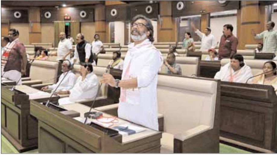
Chief Minister Hemant Soren speaks during a special assembly session for floor test of Soren's Government at the State Assembly in Ranchi, Jharkhand on Monday.

Following his victory in the trust vote, the expansion of the Hemant Soren Cabinet was done in the afternoon. The revamped Cabinet included three new ministers, in addition to retaining eight members, who were part of Champai Cabinet.