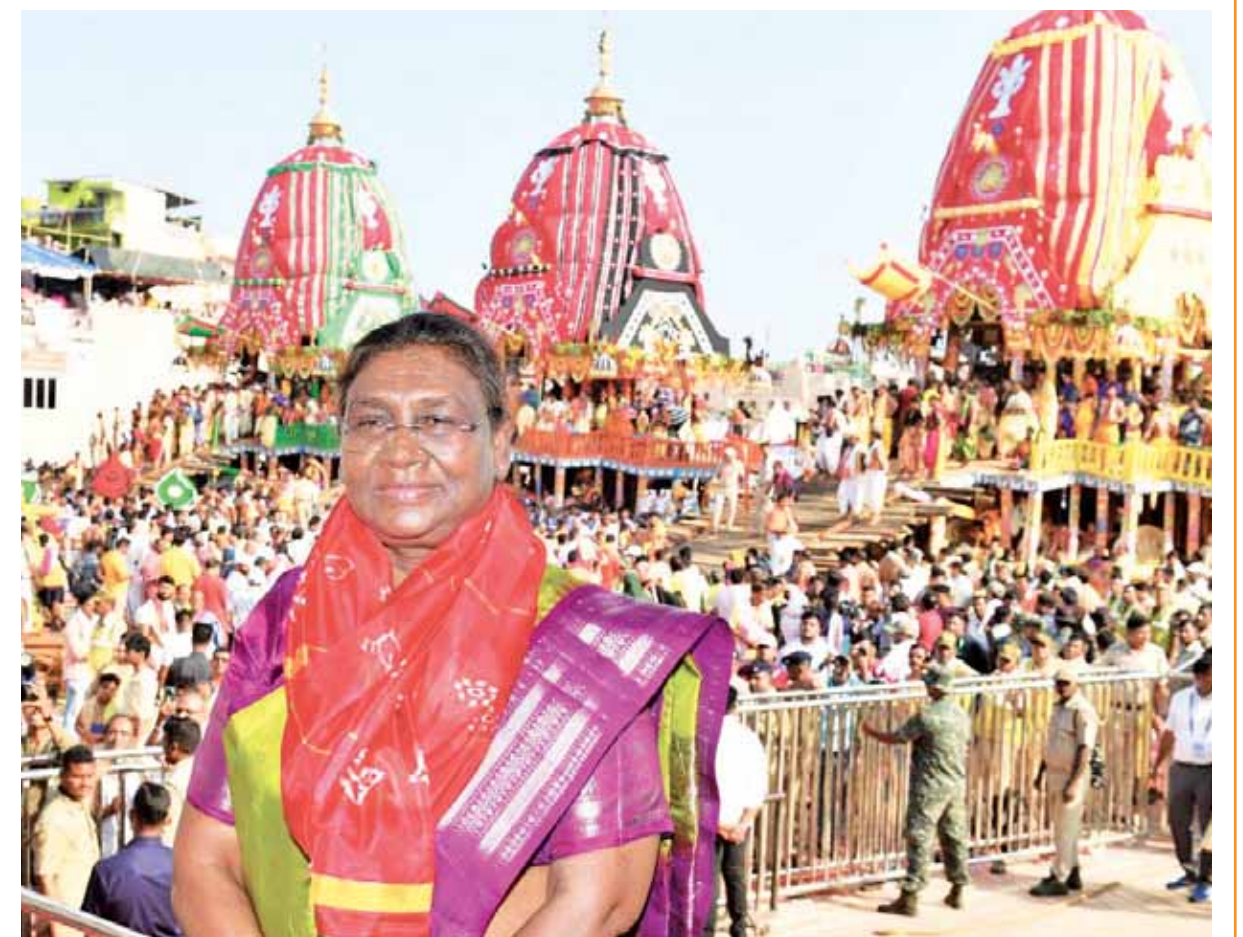
President Droupadi Murmu during the annual Rath Yatra in Puri on Sunday