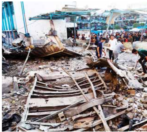
Palestinians look at the aftermath of the Israeli airstrike on a U.N.-run school that killed dozens of people in the Nusseirat refugee camp in the Gaza Strip on Saturday.

Marking nine months since the war in Gaza started, Israeli protesters blocked highways across the country Sunday, calling on Prime Minister Benjamin Netanyahu to step down and pushing for a ceasefire that could bring back the hostages held by Hamas. The demonstrations come as international mediators have renewed efforts to broker a deal. Hamas over the weekend appeared to have dropped a key demand for an Israeli commitment to end the war, according to Egyptian and Hamas officials who spoke to The Associated Press. The war, triggered by the Palestinian militant group following a cross-border attack on October 7, saw 1,200 people killed and 250 others taken hostage. A retaliatory Israeli air and ground offensive has killed over 38,000 Palestinians, according to the territory's Health Ministry, which does not distinguish between combatants and civilians in its count. Sunday's “Day of Disruption”