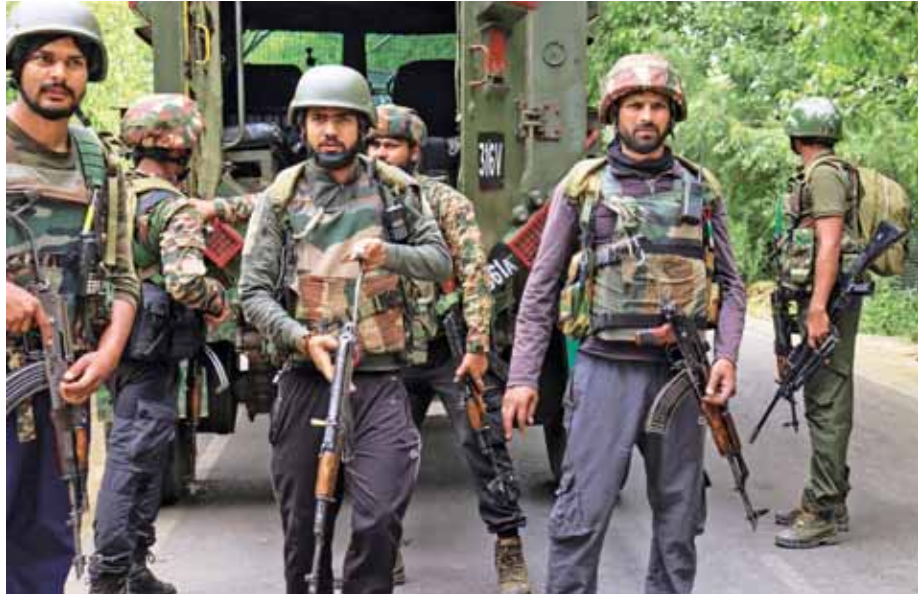
Security personnel stand guard during an encounter with terrorists in Kulgam