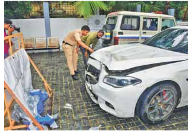
A damaged BMW car that was involved in a hit-and-run case, parked on the premises of Worli police station, in Mumbai, on Sunday