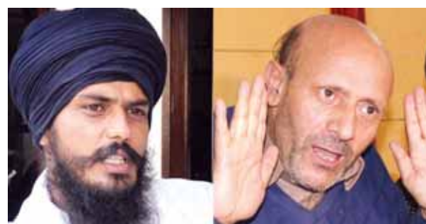
Sikh preacher Amritpal Singh and Kashmiri leader Sheikh Abdul Rashid

Jailed radical Sikh preacher Amritpal Singh and Kashmiri leader Sheikh Abdul Rashid, who were granted parole to take oath as members of the Lok Sabha, were sworn in as MPs on Friday, amid heavy deployment of security personnel in and around the Parliament complex. While Rashid, popularly known as Engineer Rashid, is in Delhi's Tihar jail in a terror-funding case registered under the Unlawful Activities (Prevention) Act, Singh is lodged in a prison in Assam's Dibrugarh district for offences under the National Security Act. They were brought to the Parliament complex by