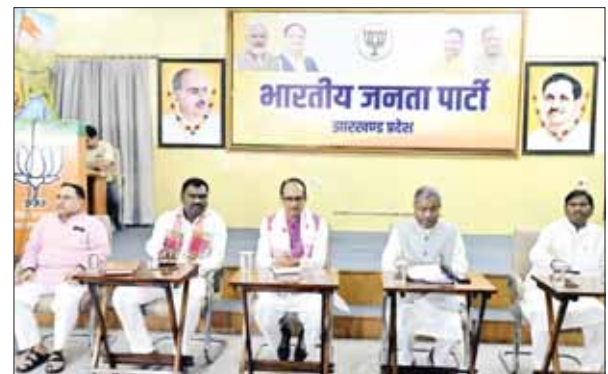
Union Agriculture Minister cum Jharkhand election incharge Shivraj Singh Chauhan alongwith Jharkhand BJP President Babul Marandi, former Union Minister Arjun Muunda conduct a meeting with MPs and MLAs in Ranchi on Friday.