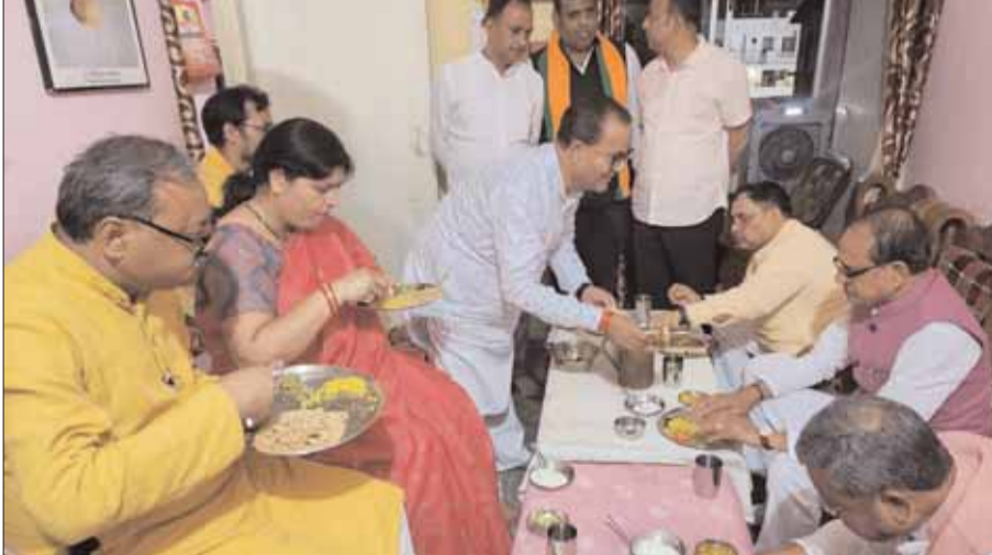
Jharkhand BJP Assembly Election Incharge and Union Minister Shivraj Singh Chauhan along with other leaders takes dinner at the House of a booth worker in Ranchi on Thursday.