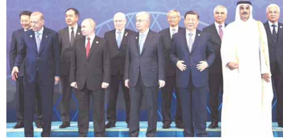
From left, front row, Turkish President Recep Tayyip Erdogan, Russian President Vladimir Putin, Kazakh President Kassym-Jomart Tokayev, Chinese President Xi Jinping and Qatari Emir Sheikh Tamim bin Hamad Al Thani pose for a photo at the Shanghai Cooperation Organisation (SCO) plus summit in Astana, Kazakhstan, on Thursday