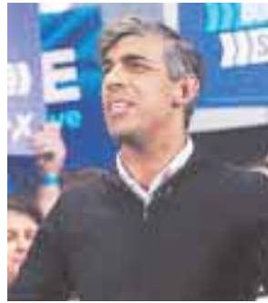
and has had to contend with trailing far behind 61-year-old Keir Starmer-led Labour Party throughout the six-week campaign. Both leaders wrapped up their poll pitches with contrasting messages — Sunak urging voters not to hand "tax-raising" Labour a "supermajority" and Starmer playing down the prospect of a landslide win for fear of a low turnout impacting the final outcome. Candidates are being fielded for 650 constituencies across England, Scotland, Wales, and

The future of Rishi Sunak as Britain's Prime Minister and leader of the Conservative Party hangs in the balance as polling booths opened across the UK on Thursday, with the British Indian leader and the man who wants his job — Keir Starmer — out early to cast their votes along with millions across the country. Sunak and his wife Akshata Murty walked hand-in-hand to their local polling booth on a sunny day in his constituency of Richmond and Northallerton in Yorkshire, northern England. A little later, Starmer and wife Victoria were at their polling station in Camden, north London, sporting Labour red colours. As is customary, there is no campaigning or party political canvassing on polling in the UK. Sunak, 44, is up against voter angst towards the incumbent Tories after 14 years in power