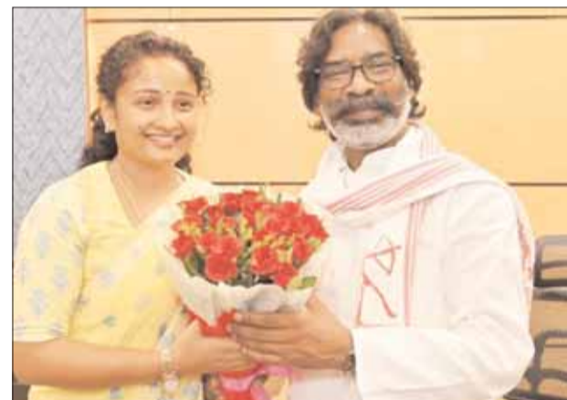
Chief Minister Hemant Soren being greeted by his wife and Gandey MLA Kalpana Soren after taking charge after swearing in ceremony at Project building in Ranchi on Thursday.

minister -- Arvind Kejriwal is the other -- from the front who was arrested by the fed-