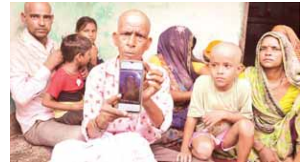
Family members sitting at a house after the Hathras stampede. Over 120 people were killed and several injured in the stampede, according to officials