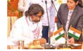
Jharkhand Mukti Morcha (JMM) leader Hemant Soren takes the oath of office and secrecy as the 13th Chief Minister of Jharkhand during the swearing-in Ceremony at the Raj Bhavan, in Ranchi

Jharkhand Mukti Morcha (JMM) executive president Hemant Soren on Thursday took oath as the 13th Chief Minister of Jharkhand, a day after Champai Soren stepped down from the post months ahead of the Assembly election. He was administered the oath of office and secrecy by