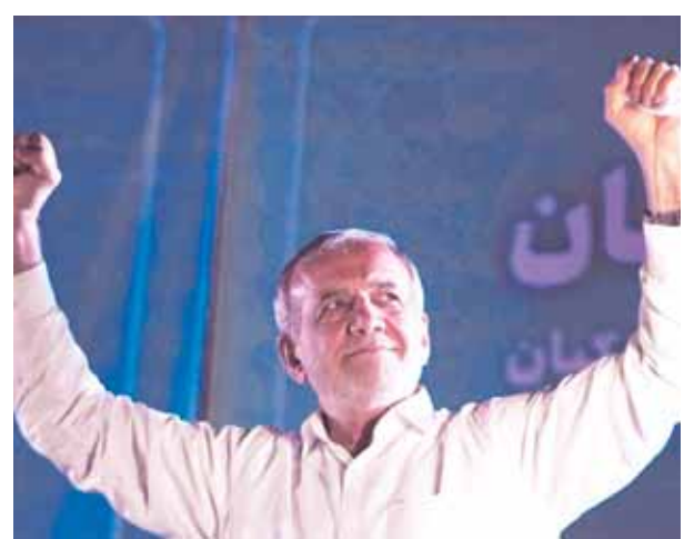
Reformist candidate for the Iranian presidential election Masoud Pezeshkian clenches his fists during a campaign rally in Tehran, Iran

times higher, based on remarks by those close to the hard-liner. That official, Majid Karimi, suggested Iranians should be paying the "world price" at the pump. People gathered at a Jalili rally carried a sign warning against any price hike, saying: "We do not want petrol at price of 250,000 Rial" a litre. That would be 40 cents a litre, or USD 1.55 a gallon. But no matter who is elected, it is likely Iran will see fuel price hikes. Iran raised minimum gasoline prices by 50 per cent to 15,000 rials per litre in 2019 — or 12 cents a litre, or about 50 cents a gallon. But with Iran's currency crashing since then, that's now 2 cents a litre, or 9 cents a gallon. After a monthly 60-litre quota, it costs 30,000 rials a litre. That had been nearly 24 cents a litre or 90 cents a gallon then, but now is nearly 5 cents a litre, or 18 cents a gallon. By comparison, an average gallon of regular gas in the US costs USD 3.50, according to AAA. Iran spent USD 52 billion on oil subsidies in 2022, according to the Paris-based International Energy Agency, the most of any country in the world. Iran spent 36 per cent of its overall gross domestic product, or USD 127 billion, that year on oil, electricity and natural gas