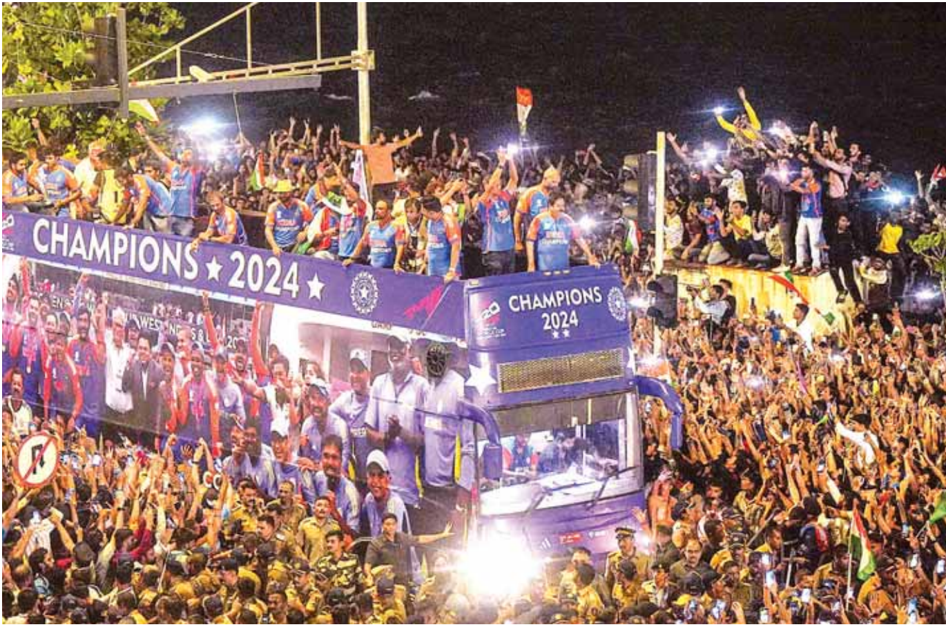
Players of the T20 World Cup-winning Indian cricket team with the championship trophy acknowledge fans during their open bus victory parade, in Mumbai, on Thursday

After Prime Minister Narendra Modi hosted the T20 World Cup-winning Indian cricket team for breakfast here on Thursday during which, he said, there were "memorable" conversations on the side's experiences through the marquee event co-hosted by USA and the West Indies, the team went to Mumbai for victory parade. The Rohit Sharma-led squad, that won the title after defeating South Africa by seven runs in the final last week, arrived in Delhi early morning after being stranded in Bridgetown, Barbados for five days due to a category 4 hurricane. The victory parade of the T20 World Cup winning Indian team commenced after a two-hour delay as complete crowd chaos along the stretch of South Mumbai brought the traffic to a halt after Rohit and his men touched down little after 5 pm here on Thursday. As per the itinerary shared by the officials here, the two-hour open bus parade started from the National Centre for Performing Arts (NCPA) in Nariman Point till the Wankhede Stadium started little after 7:30 pm in the evening as the Maximum City's stretch along the Marine Drive was drowned in an 'Ocean of Humanity'. The Wankhede Stadium here was thrown open to fans, who filled up the stands within minutes to celebrate the Indian