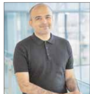
BY AVNISH ANAND

What is self-learning and why we need to practise it realise our true potential?