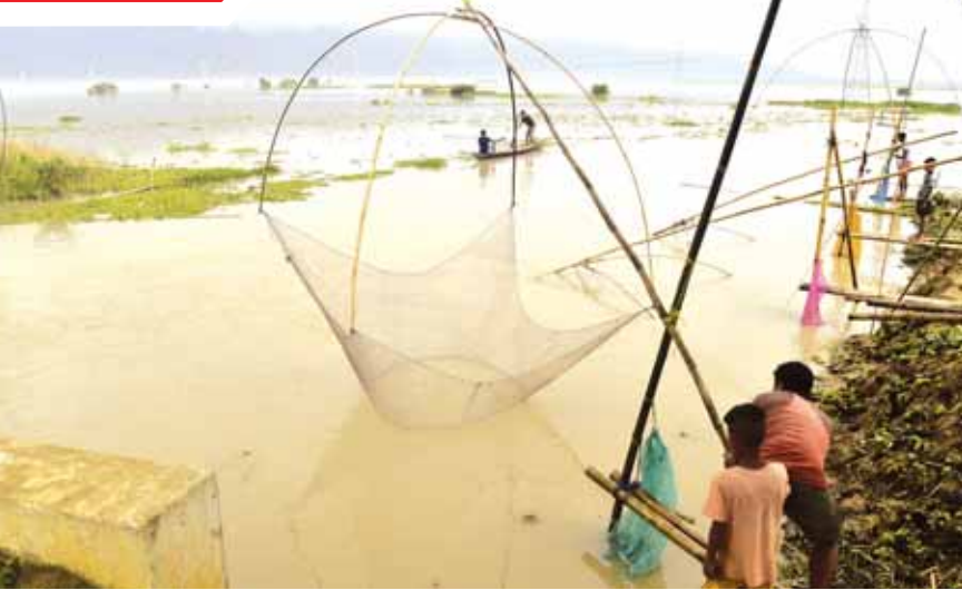
Villagers catch fish in flood water, in Morigaon district