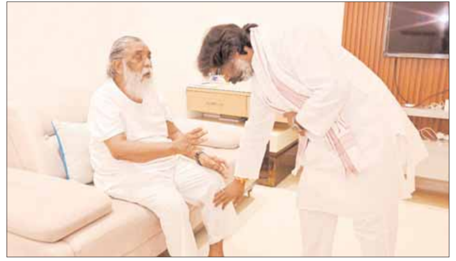
Chief Minister Hemant Soren gets blessing from his father and JMM Chief Shibu Soren before the swearing in ceremony at his official residence in Ranchi on Thursday.

Sources said that the JMM/Congress leadership decided to repose faith in Hemant once again keeping an eye on year end Assembly elections. The INDIA bloc doesn't want to give any chance to BJP and with sentiments high among tribal particularly after Hemant's arrest. The bail of Hemant had come as a shot in arm for Soren's party, and the INDIA bloc of opposition parties. Soren was the second chief