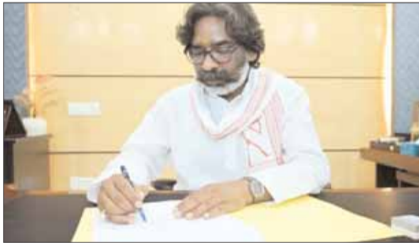
Chief Minister Hemant Soren signs in a file after taking oath at Project building in Ranchi on Thursday.