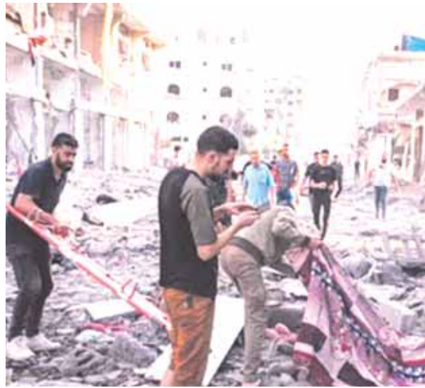
"military structures" in the southern border towns of Ramyeh and Houla. Lebanon's state-run National News Agency reported an Israeli drone strike of Houla killed at least one person. Israeli jets also broke the sound barrier over

The Lebanese Hezbollah group said it launched over 200 rockets on Thursday at several military bases in Israel in retaliation for a strike that killed one of its senior commanders. The attack by the Iran-backed militant group was one of the largest in the months-long conflict along the Lebanon-Israel border, with tensions escalating in recent weeks. The Israeli military said "numerous projectiles and suspicious aerial targets" had entered its territory from Lebanon, many of which it said were intercepted. There were no immediate reports of casualties. It said about 200 "projectiles" were launched toward the occupied Syrian Golan Heights and over 20 drones into Israeli territory, but that it had intercepted some of them. Israel after Hezbollah's attack struck various towns in southern Lebanon. The Israeli military said it struck Hezbollah's