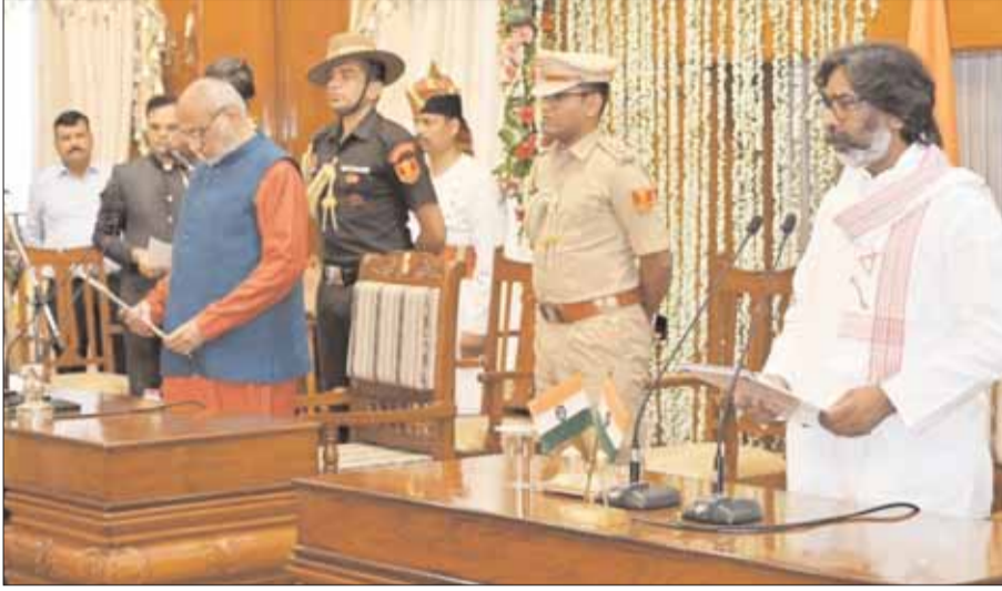
Governor CP Radhakrishnan administers oath of office and secrecy to JMM leader Hemant Soren as 13th Chief Minister of Jharkhand at Raj Bhawan in Ranchi on Thursday.

Jharkhand Mukti Morcha (JMM) executive president Hemant Soren was sworn in as Jharkhand new Chief Minister for the third term today at Raj Bhawan. Governor C.P. Radhakrishnan administered the oath of office and secrecy to the new Chief Minister. Hemant will be 13th Chief Minister of State. Prior to today's oath, Hemant had assumed the office of Chief Minister for the first time for 14 months and second time for four years.