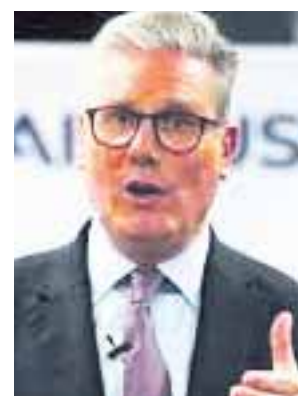
party's fortunes from one of its worst poll performances in the 2019 general election to the edge of government. The other turnaround Starmer worked on was to try and rebuild Labour's connect with the Indian diaspora, alienated under former leader Jeremy Corbyn over a perceived anti-India stance on Kashmir.