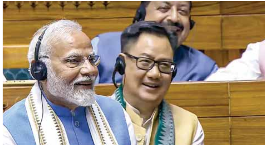
Prime Minister Narendra Modi reacts as he replies to the Motion of Thanks on the President's Address in the Lok Sabha during the ongoing Parliament session, in New Delhi, on Tuesday

"Images of our Gods cannot be used for personal political interests. They coined phrases like 'Hindu terrorism', their ally likened this religion to dengue; country will never forgive them," Modi said taking a swipe on Rahul's