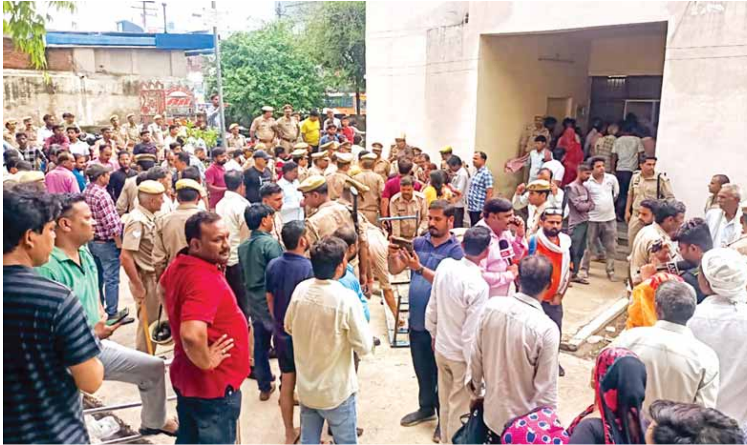
Relatives outside a hospital where victims of the Hathras' stampede are admitted, in Etah, on Tuesday. Many people were killed and several injured in the stampede, according to officials

In a statement from the UP CM Office, Yogi also wished for the speedy recovery of the injured. He directed the district administration officials to ensure that the injured receive proper treatment and to expedite relief efforts on-site. An investigation into the causes of the incident was