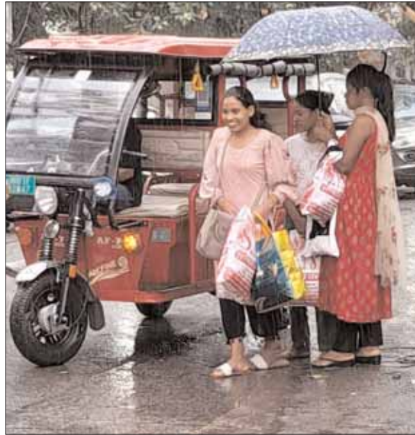
Girls walking in rain with an umbrella in Ranchi on Tuesday.

The weather of the State Capital has become pleasant as the temperature in the city came down to 25 degrees Celsius. Torrential rains brought relief to the people from the heat. Dark clouds have been looming in the sky since morning. Till the time of writing the news, light and moderate rains are happening in different parts of the state including Ranchi. The weather center located in Ranchi has predicted that the monsoon will remain active for the next two-three days. Due to this, it will keep raining in different parts of the State. The Meteorological Department has predicted thunderstorms in many parts of the State from Tuesday till July 7. The Department has also pre-