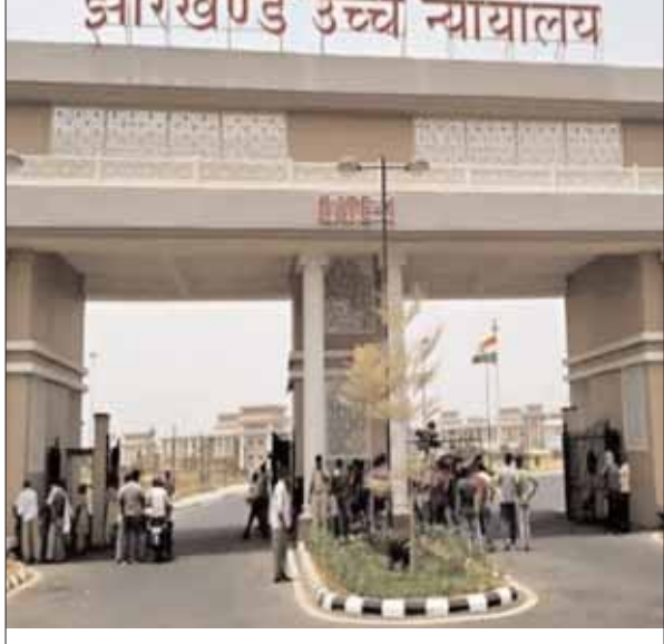
Entrance of the High Court in Ranchi.