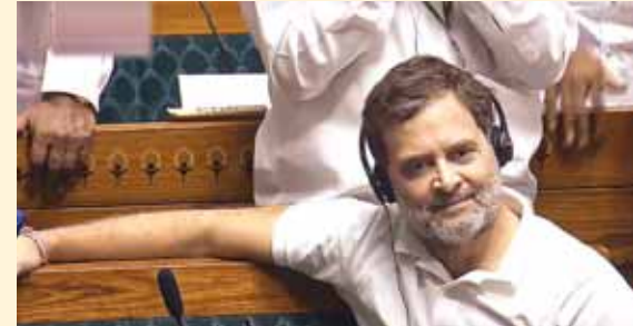
Leader of Opposition in Lok Sabha Rahul Gandhi during Prime Minister Narendra Modi's reply to the Motion of Thanks on the President's Address, in New Delhi on Tuesday

"Whatever I had to say, I have said and that is the truth. They can expunge as much as they want, but the truth will prevail," Rahul told reporters in Parliament