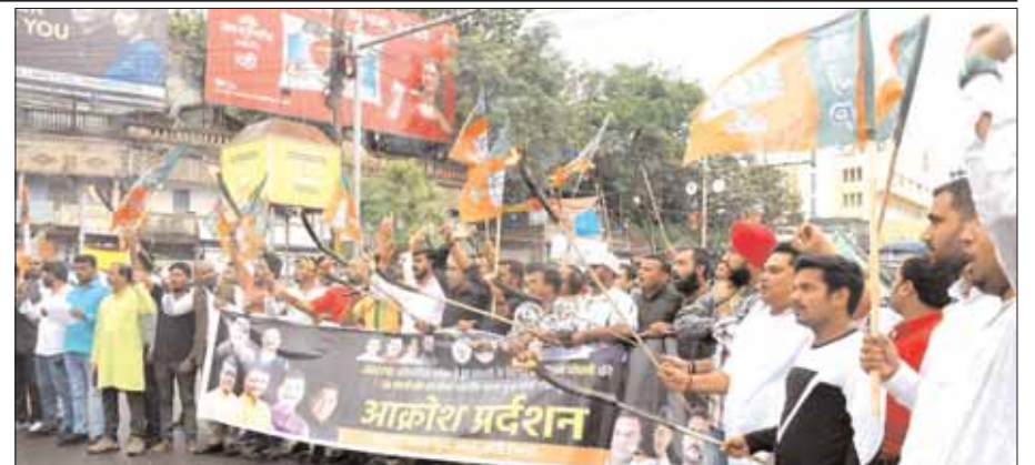
BJP Yuva Morcha workers raise slogans during a protest against the JSSC PGT exam in Ranchi on Tuesday.